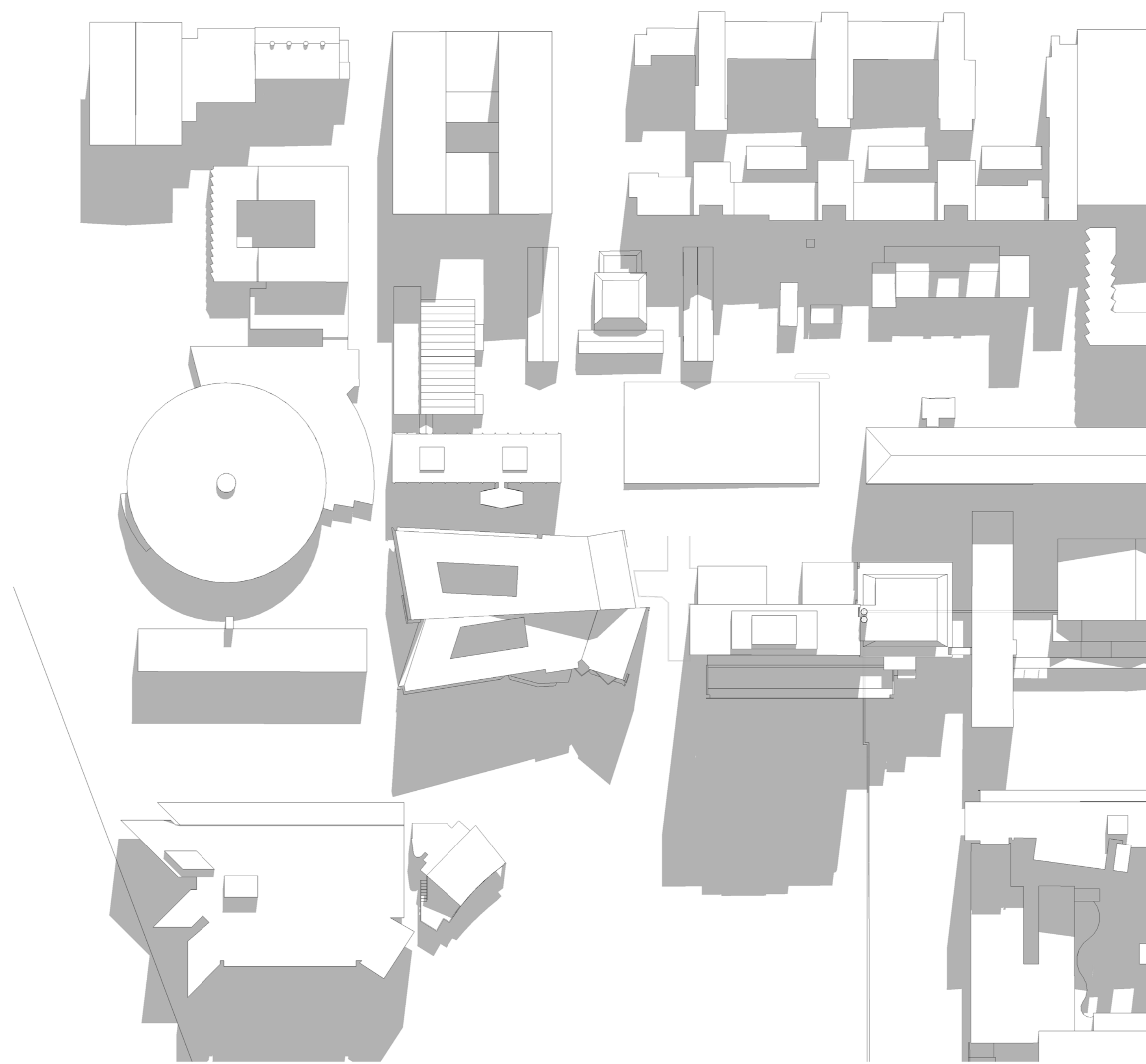
2 Shadow Study Jun 21 1200 SCALE : 1 : 1000