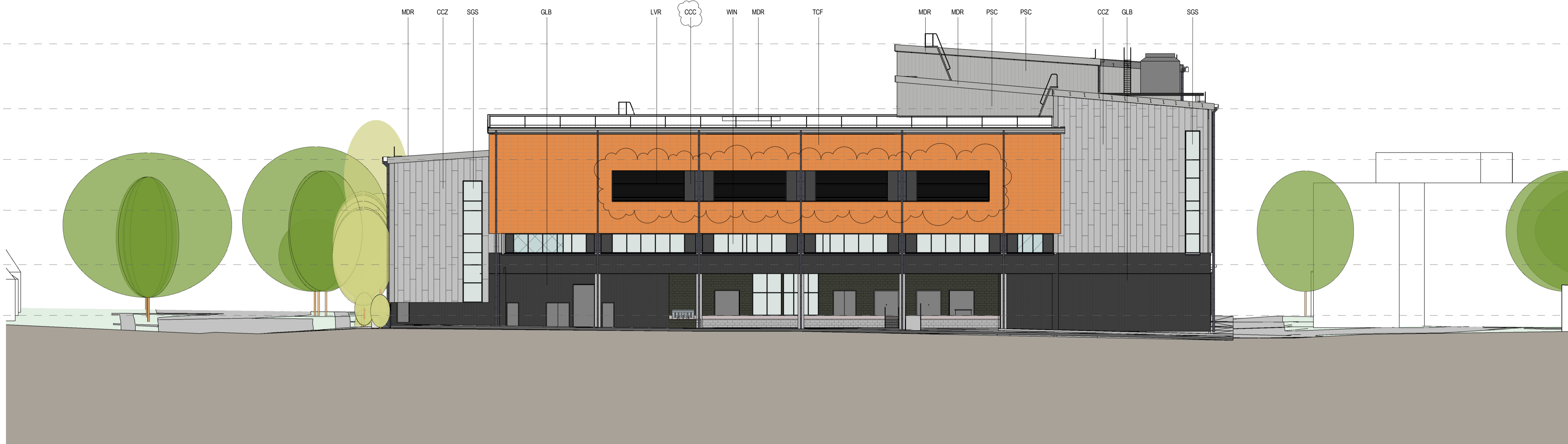
1 EAST ELEVATION A-A 1:200

▼ STAGE 1 - L05 +198.10 m ▼ STAGE 1 - L04 +193.90 m ▼ STAGE 1 - L03 +189.70 m ▼ STAGE 1 - L02 +185.20 m ▼ STAGE 1 - L01 +181.00 m