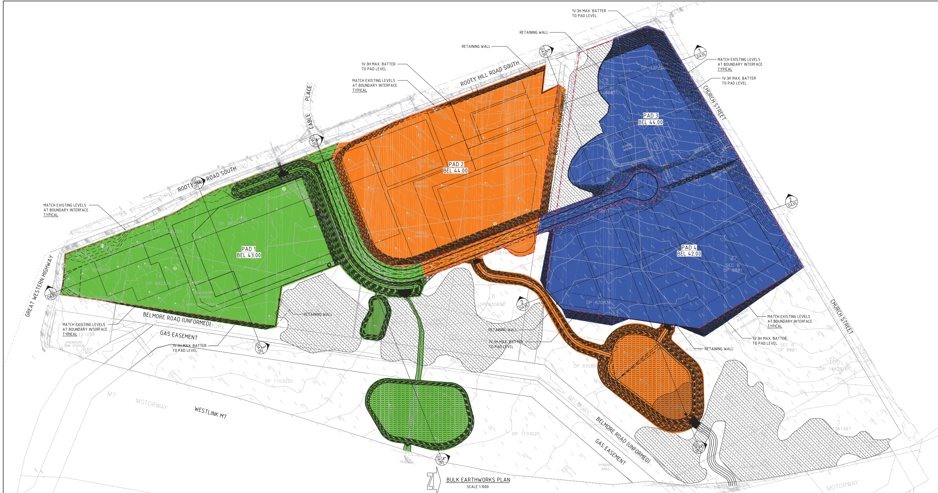
BULK EARTHWORKS PLAN SCALE 1:1000