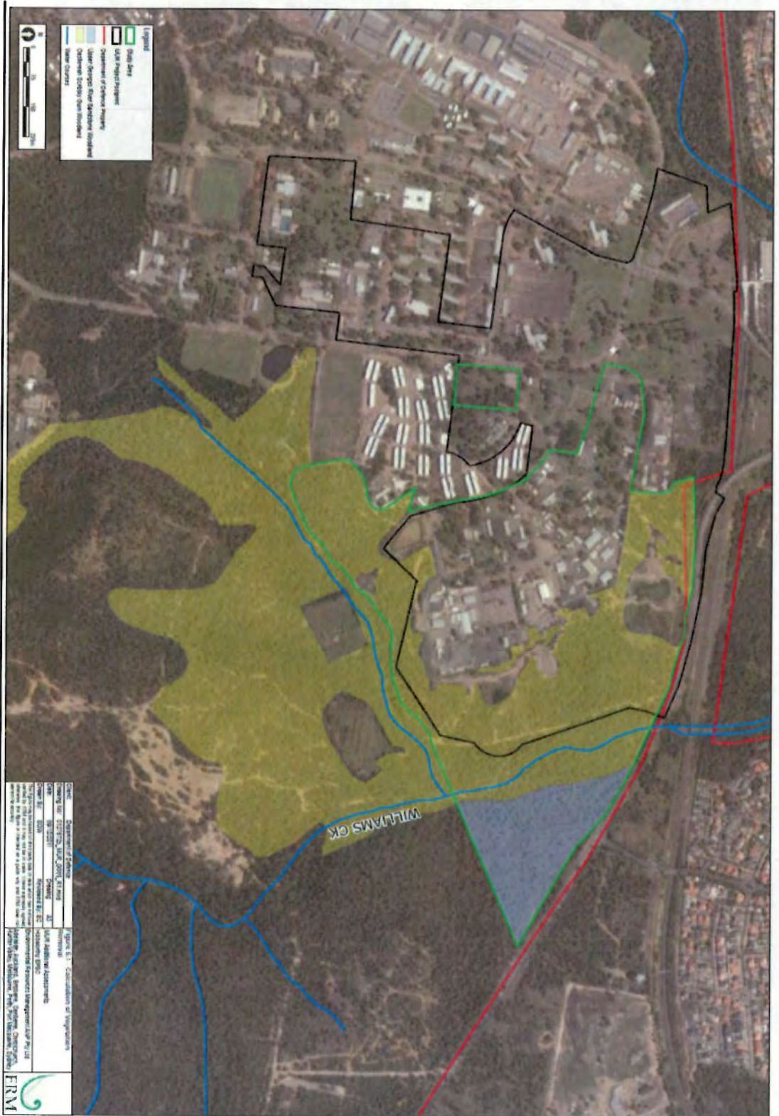
Figure 2: Site location of the Moorebank Unit Relocation proposal (outlined in black).