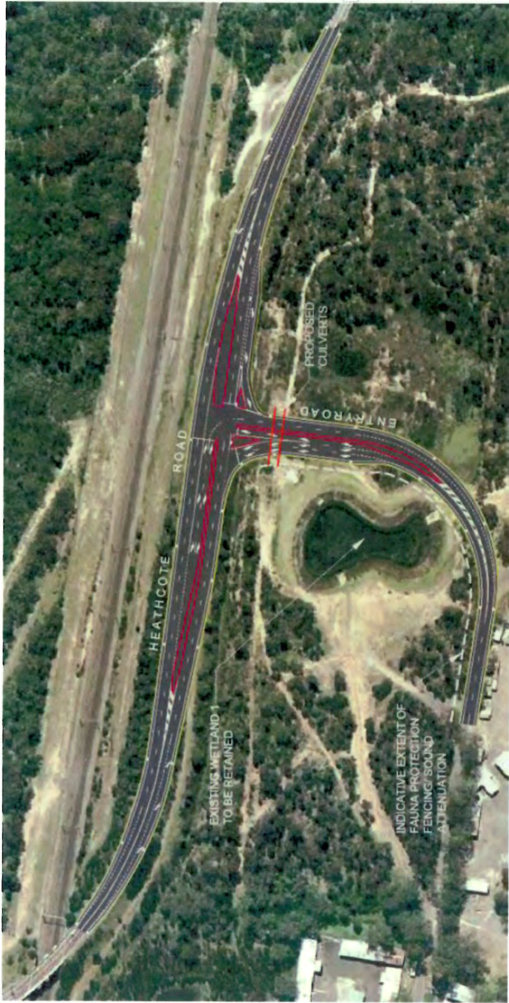
Figure1: Location and layout of the new intersection on Heathcote Road.