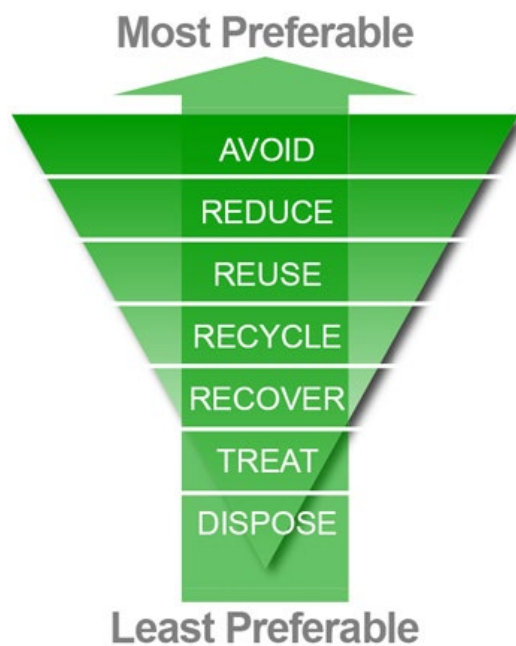
Figure 2: Waste hierarchy

The construction and demolition teams will implement this C&DWMP, incorporating the following best practice management techniques as a minimum: