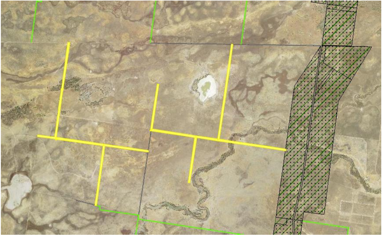
Enclosure Permit 493505