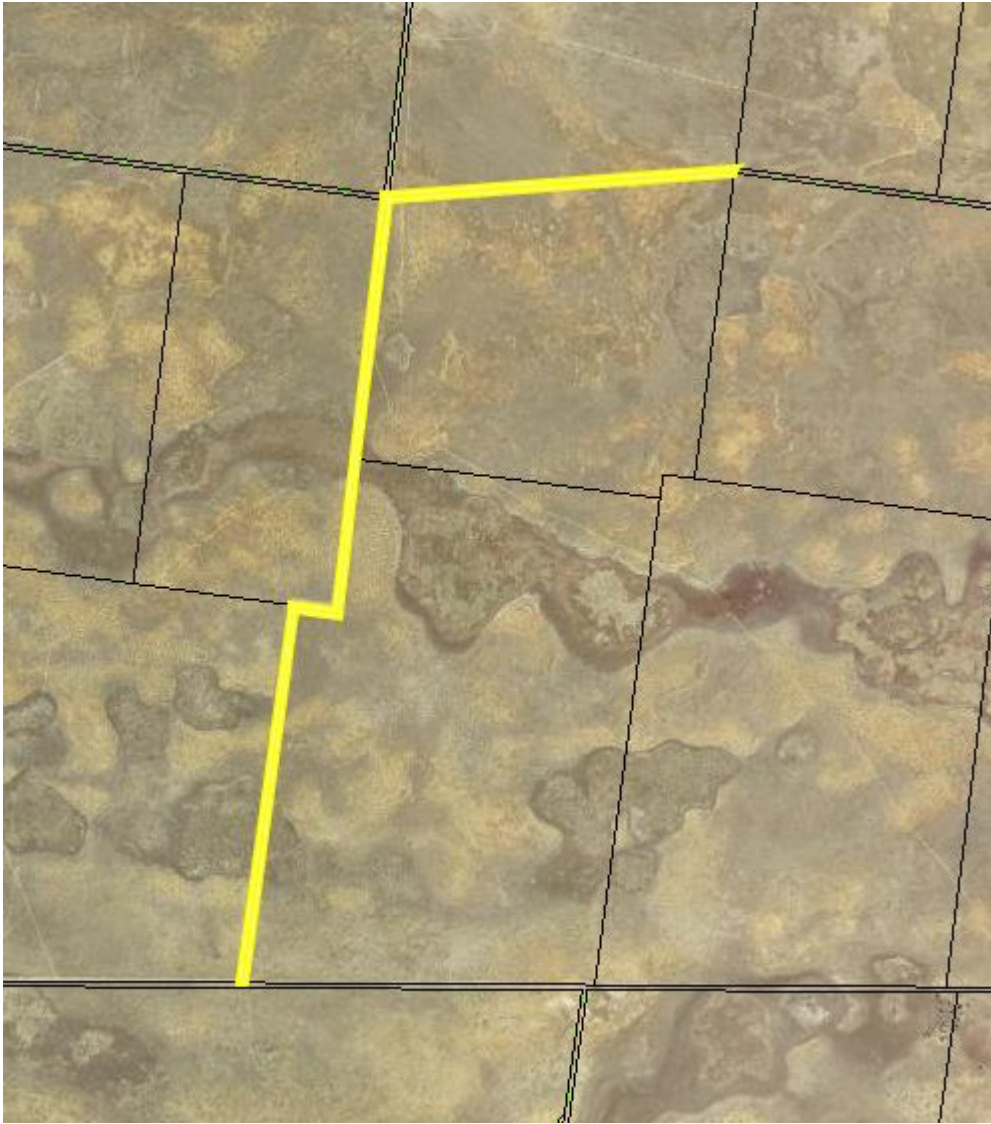
Enclosure Permit 599187