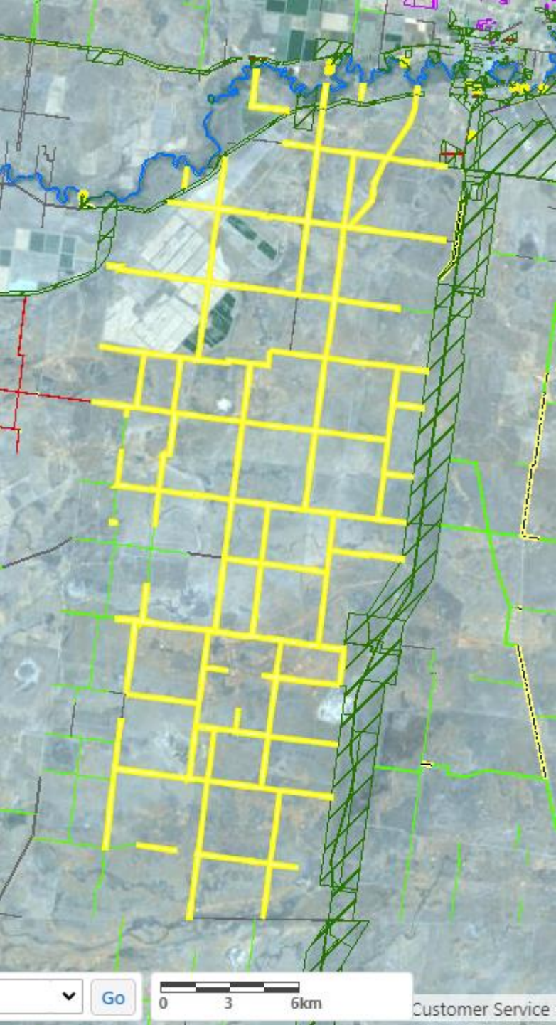
Enclosure Permit 461579