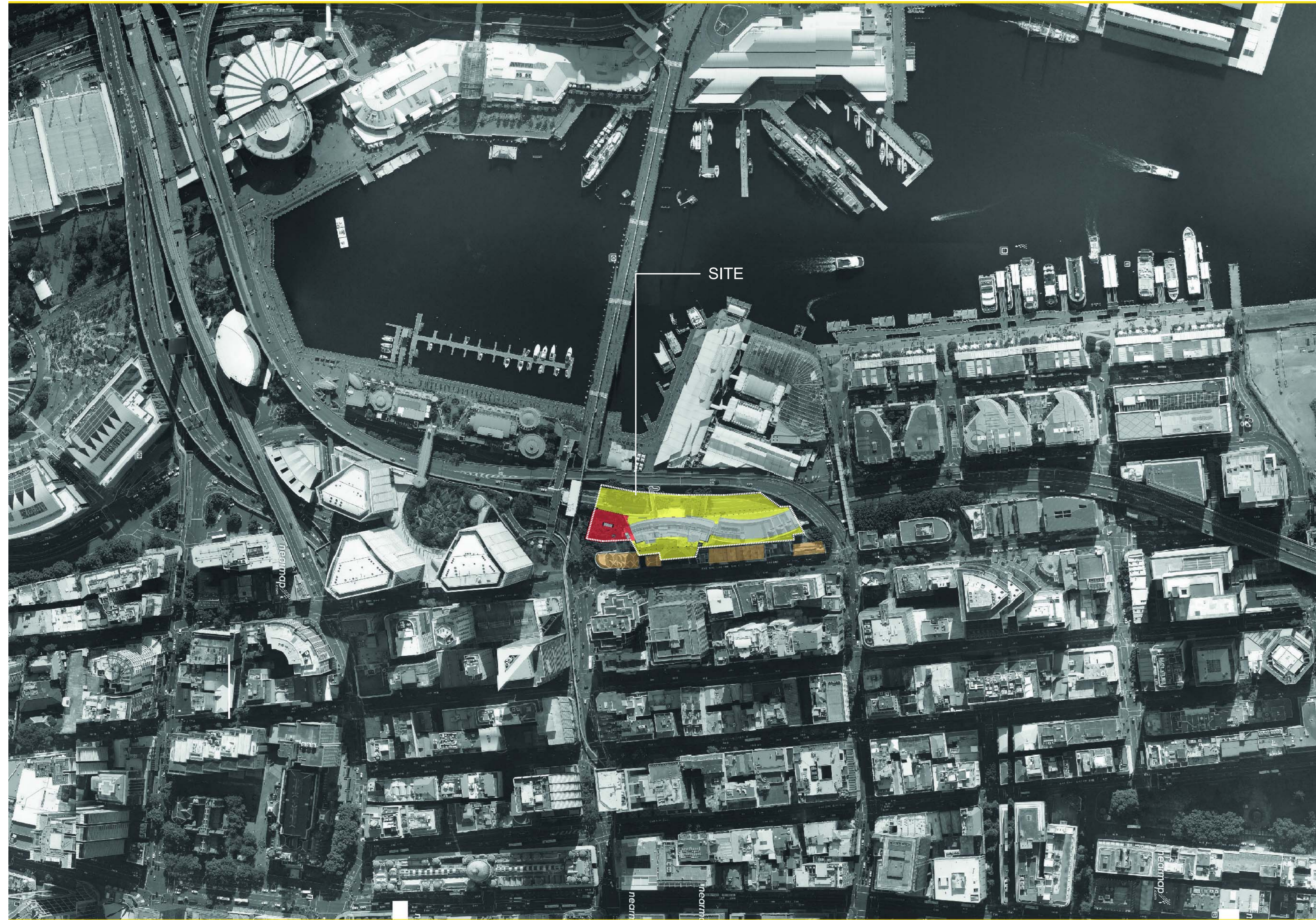
01 LOCATION PLAN NTS