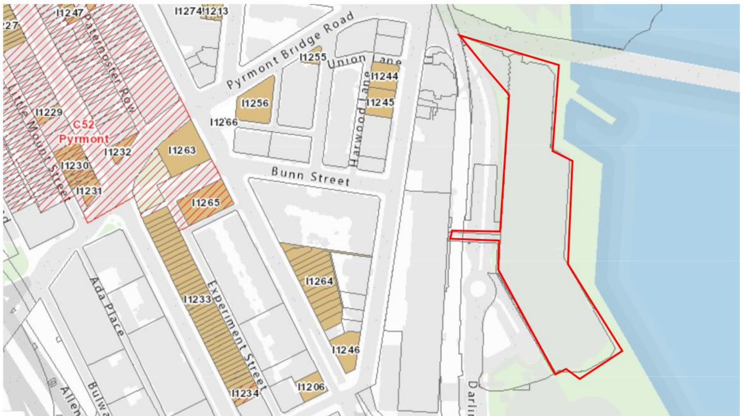
Figure 2.0: Location of LEP listed items in relation to the study area (outlined in red).