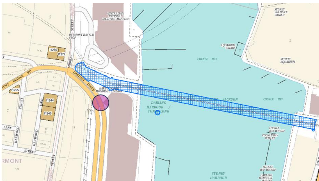
Figure 1.0: Approximate location of the proposed works is circled in pink. The SHR listed Pyrmont Bridge is highlighted in blue. Source: Planning and spatial viewer with Curio overlays (in pink and blue).

This HIS is based on the plans prepared by Snohetta and Hassel and provides a heritage impact assessment to support the removal of the structure known as the “Northern Bridge” (See Figure 1.0 below).