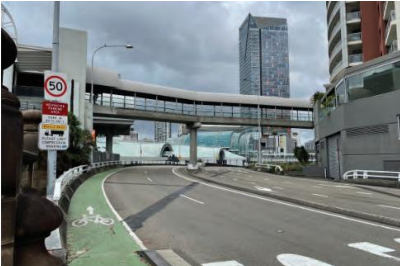
Figure 3.0: Northern Bridge From Darling Drive/Murray Street.

A new glazed lift is proposed to provide accessible vertical transport from the ground level to the lower waterfront garden area.