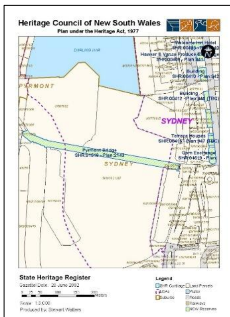
Figure 2.1: SHR curtilage map for Pymont Bridge.