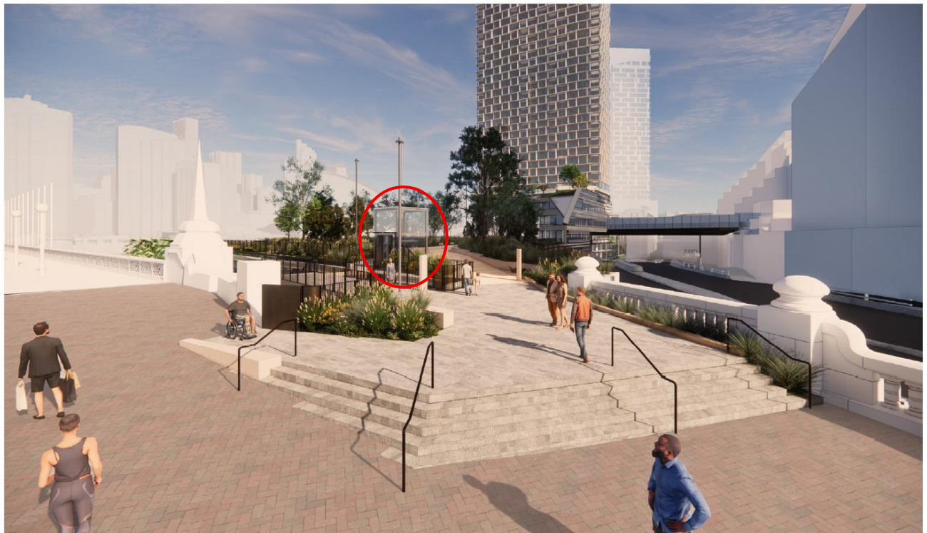
Figure 3.4: Proposed 4.55 modification with the northern Bridge removed to open up the views and added lift shaft.