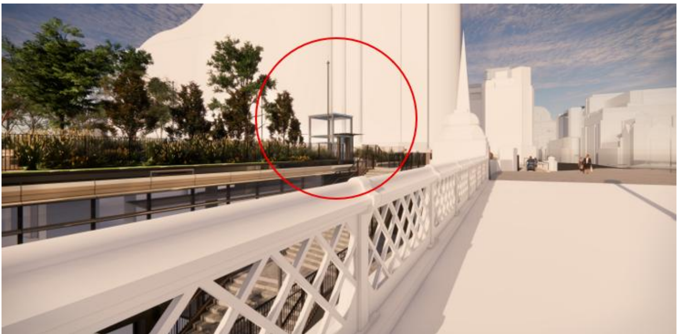
Figure 3.2: This image illustrates the proposed new view with the Northern Bridge removed and the new glazed lift shaft installed, showing the simplified visual composition of the waterfront and improved openness of views across the Harbourside site, should the modification be approved.