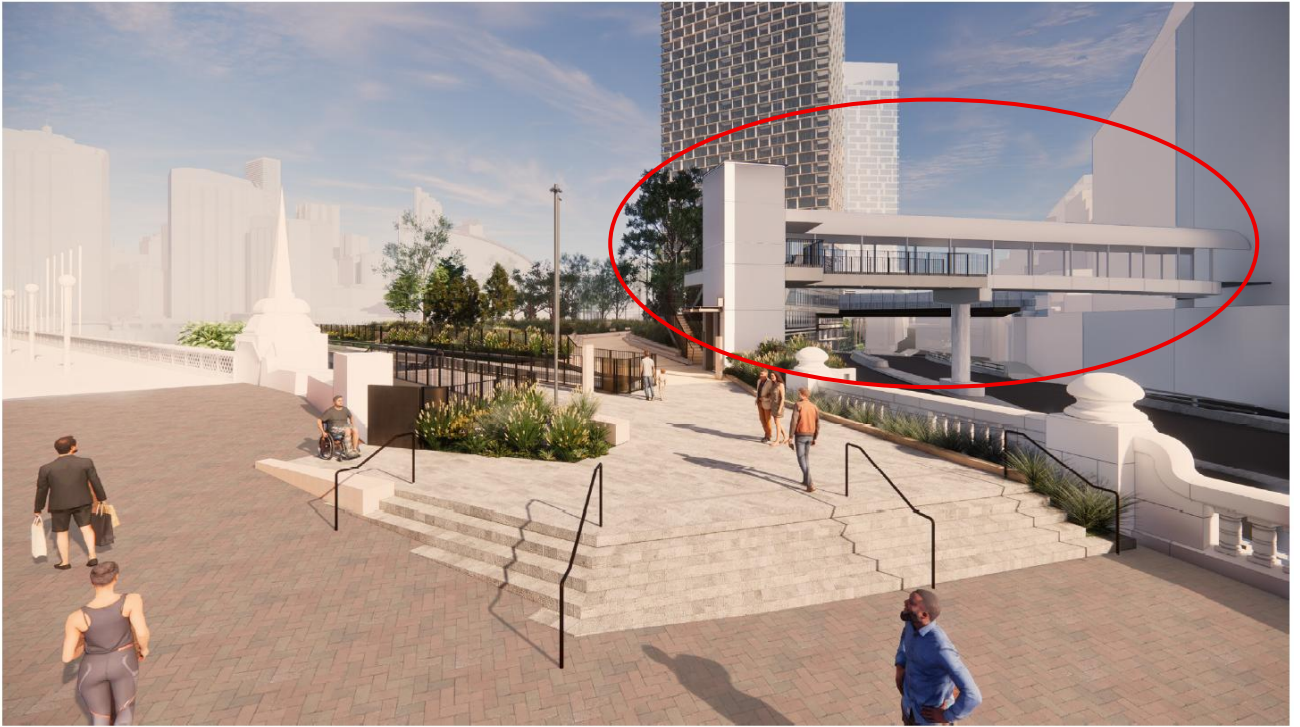
Figure 3.3: Current approved SSDA scheme compared to the proposed removal of the northern Bridge and added lift shaft. (Source: Mirvac with Curio Additions in Red showing bridge remaining insitu).