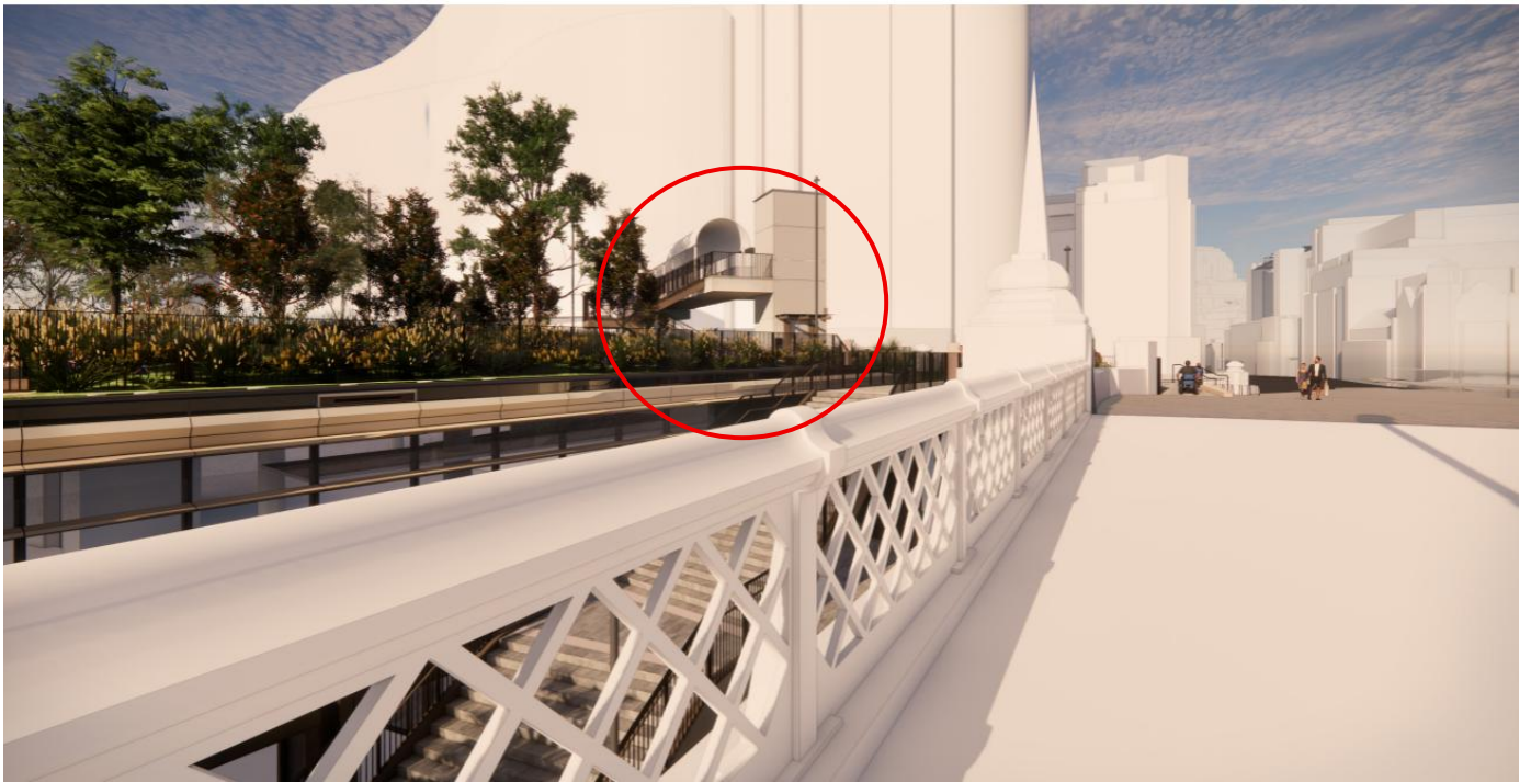
Figure 3.1: View illustrating how the Harbourside site would appear if the Northern Bridge were to be retained and reconstructed as per the existing SSDA Approval