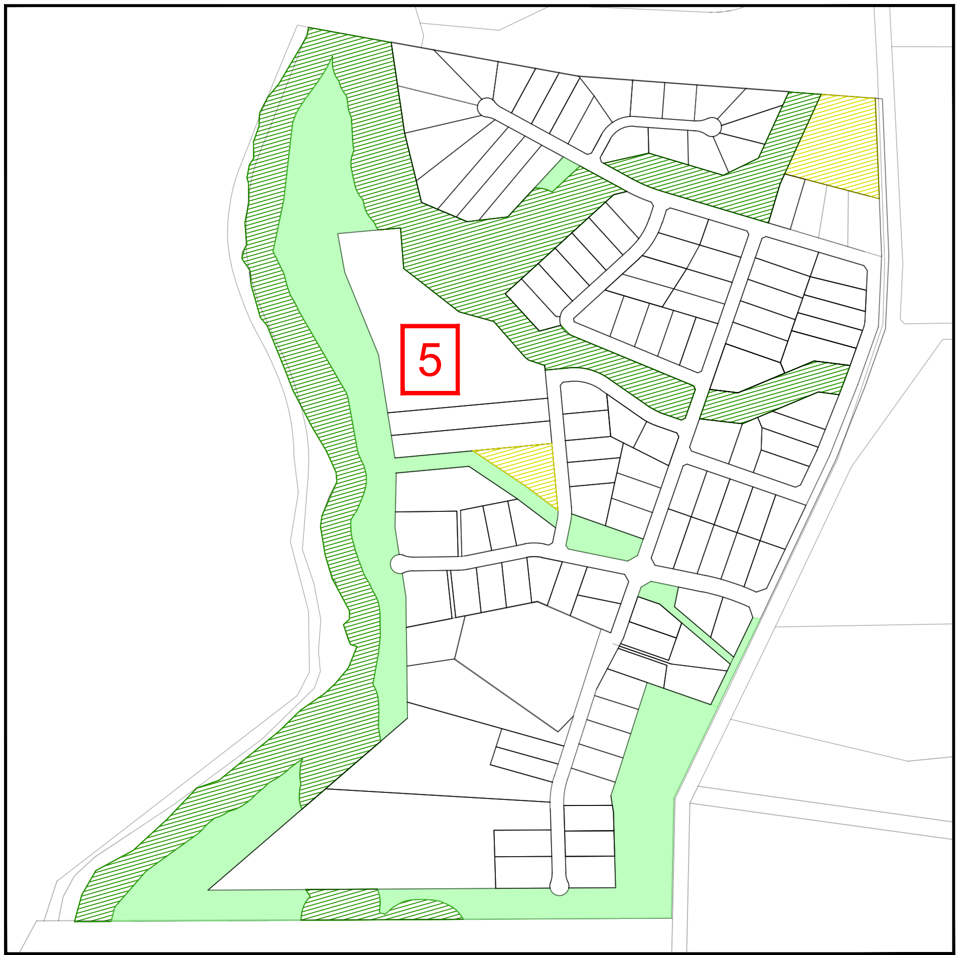
DETAIL - LARGE LOT RESIDENTIAL