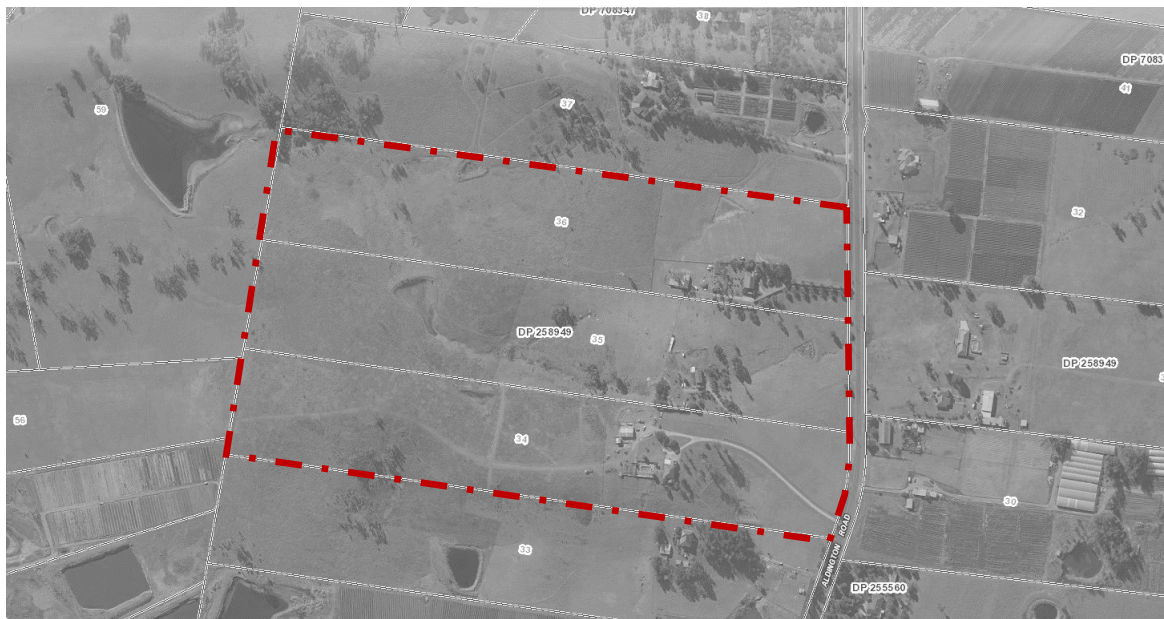
Figure 2: Location – Development Site

Despite the leasing commitment to Warehouse 2, McPhee have yet to decide on the operations of Warehouse 2 as they may potentially utilise it for a sole customer or alternatively operate it similarly to Warehouse 1.