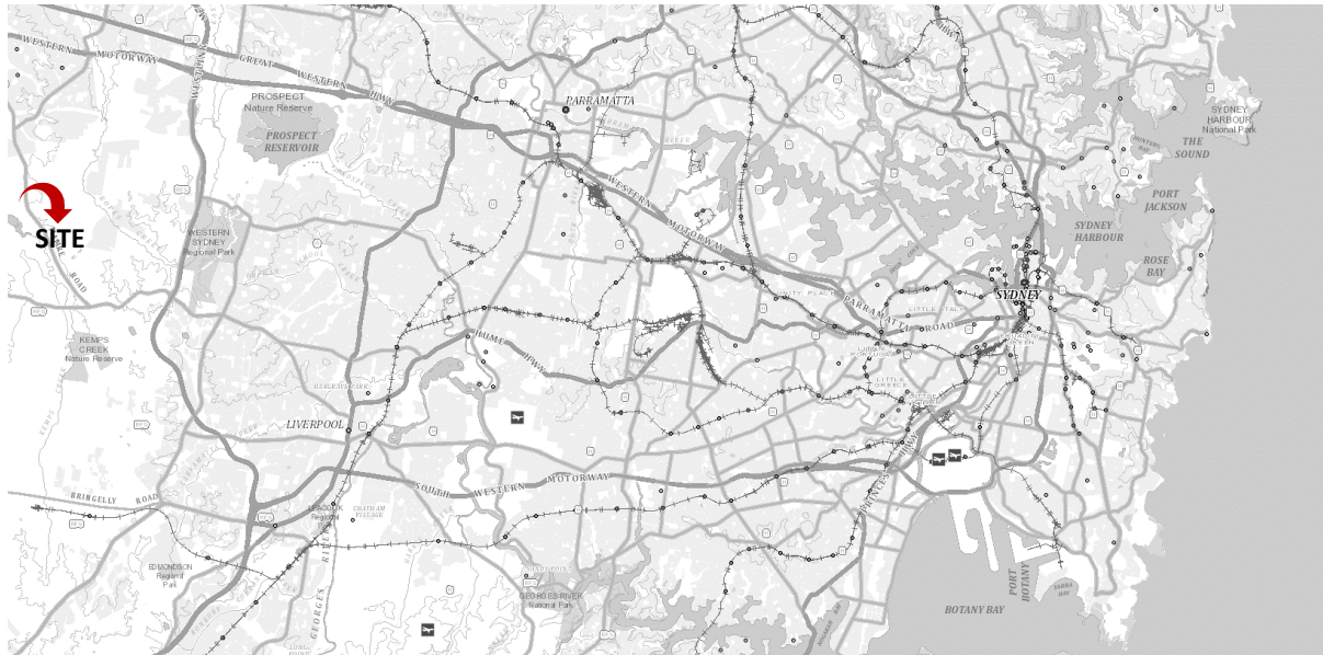
Figure 1: Regional plan