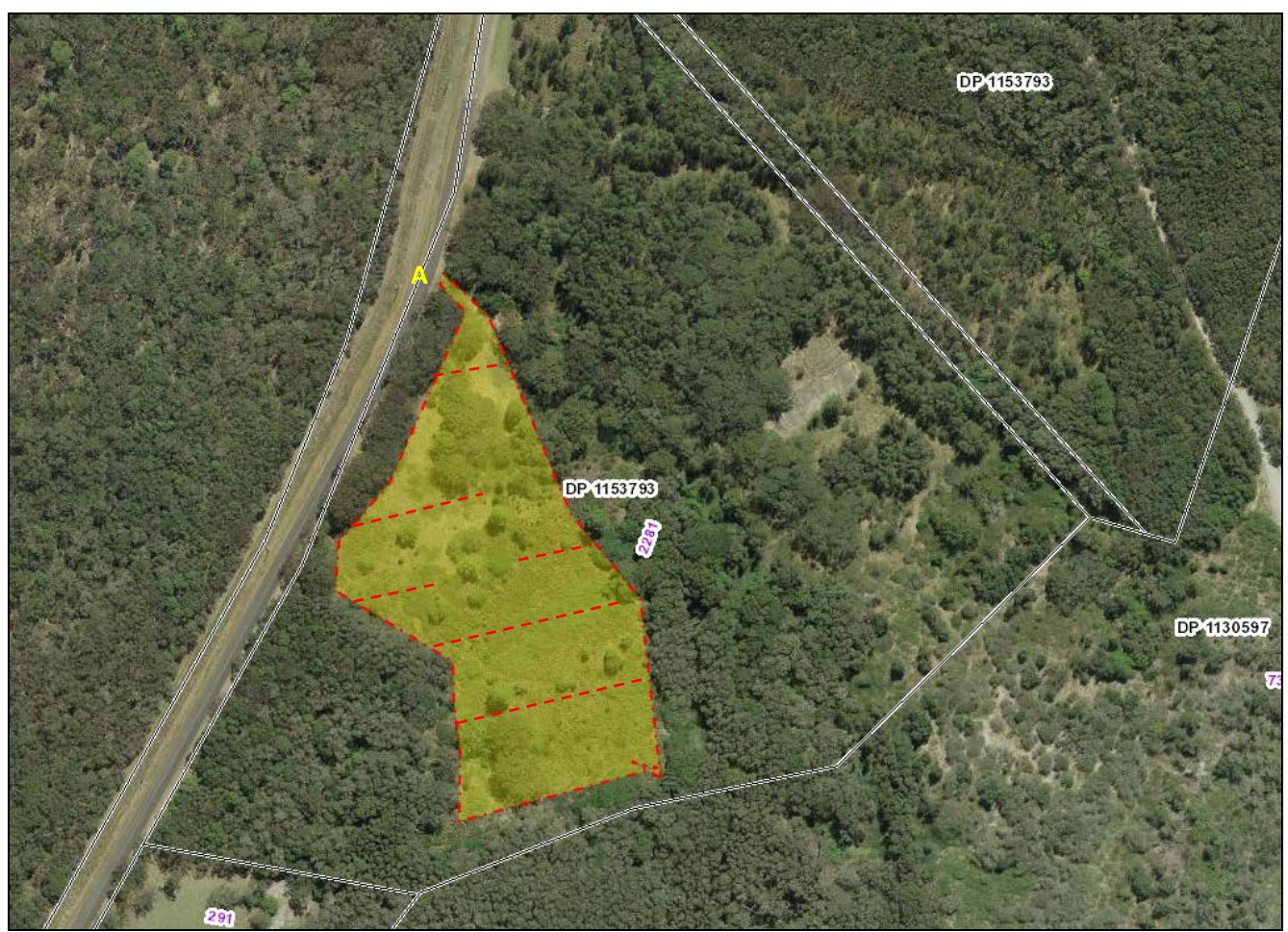
Figure 2 . Area of interest approximately 1.5 Ha area within Lot 2281 DP1153793 shown in yellow. Proposed paths of prospecting (topographic survey and hand auger holes) shown as dashed red lines. Proposed access point from Point Polmer Road marked as 'A'.