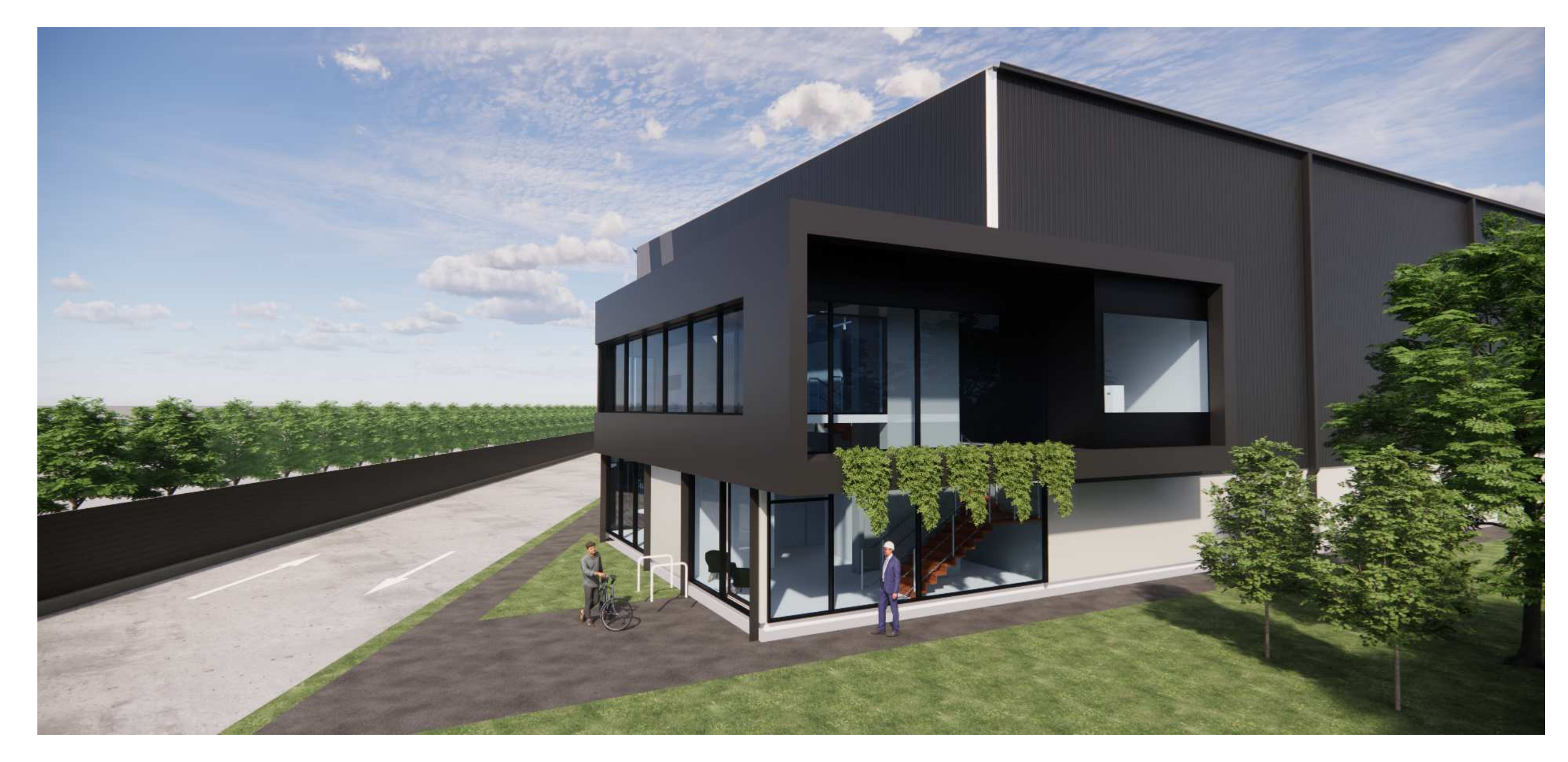
INDICATIVE PERSPECTIVE - OFFICE 2E SOUTH EAST VIEW