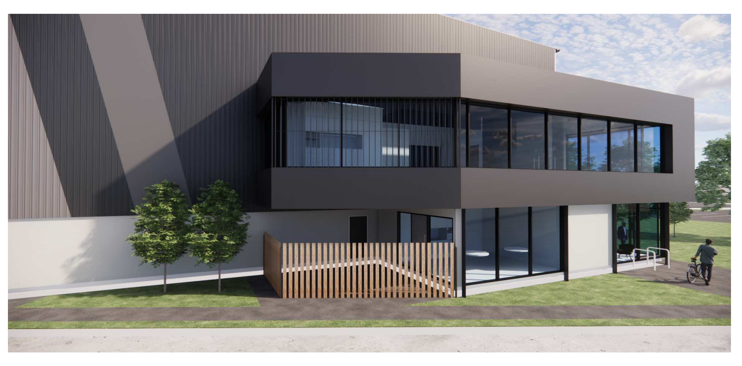
INDICATIVE PERSPECTIVE - OFFICE 2E NORTH WEST VIEW