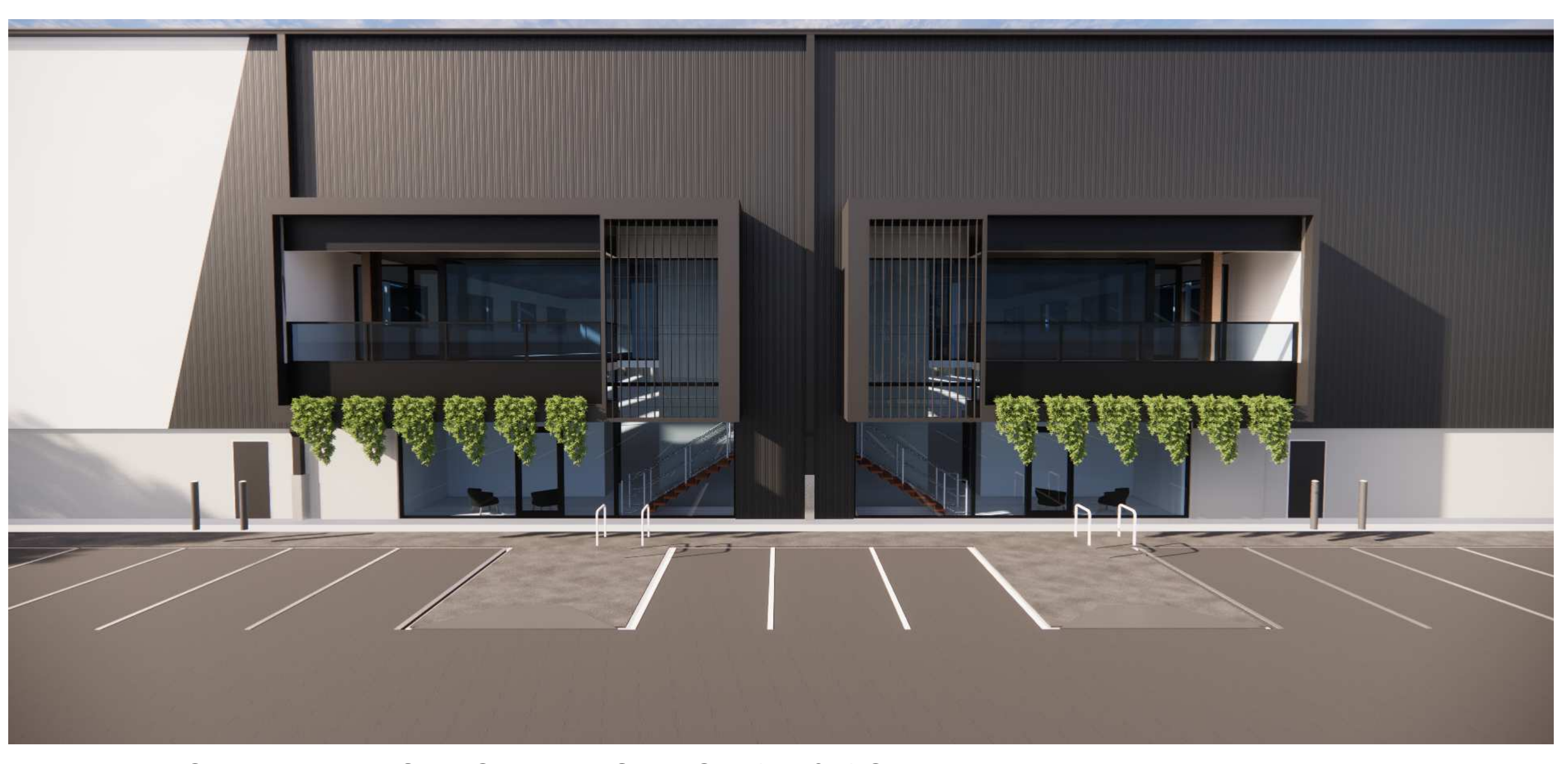
INDICATIVE PERSPECTIVE - OFFICE 2D & 2C