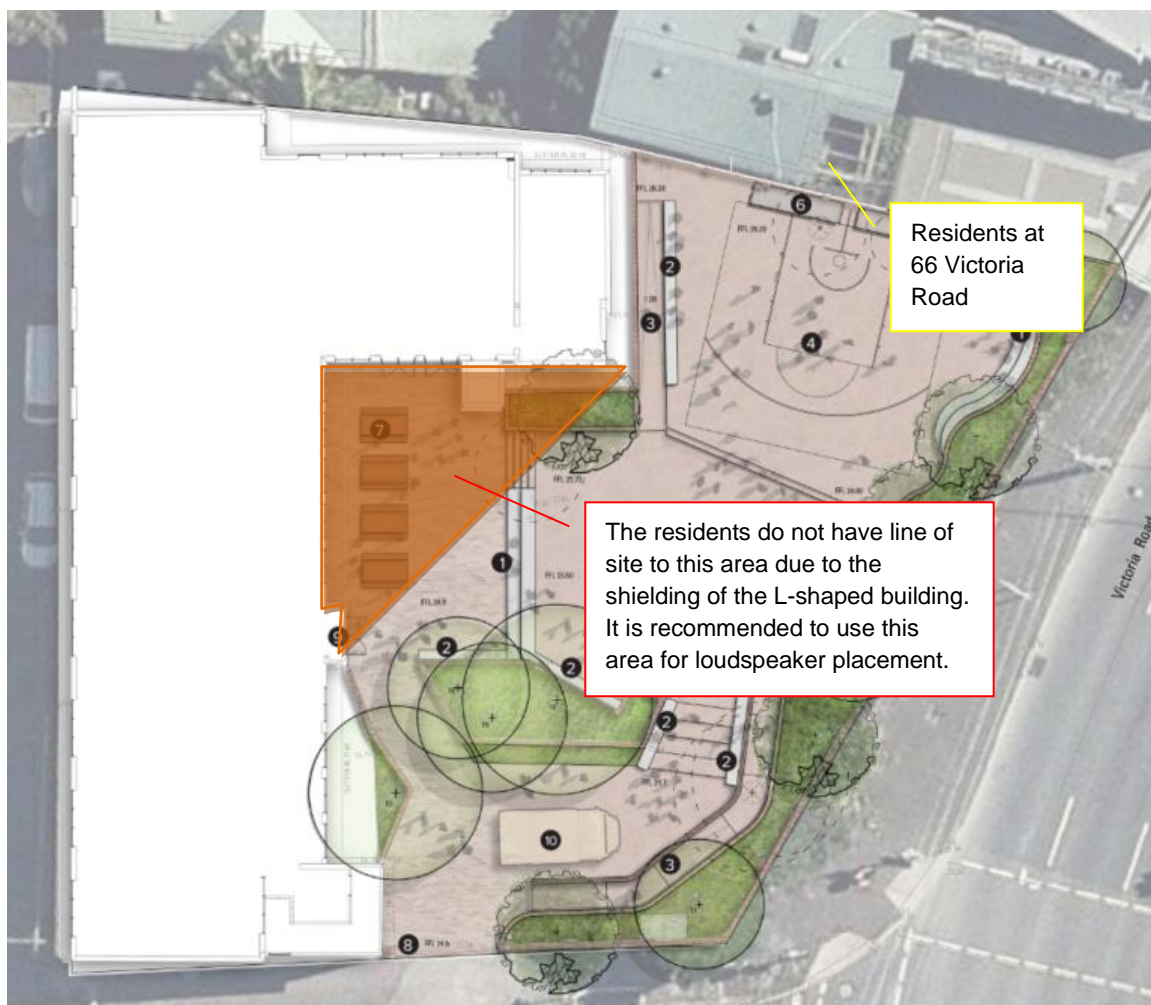
Table 17 Landscape drawing showing potential loudspeaker locations

It is noted that the background noise level from Victoria Road is relatively high and will have a useful masking effect on noise from the PA system beyond the school boundaries.