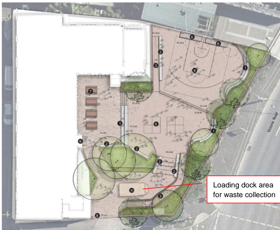
Figure 3 Landscape drawing showing site layout

It is assumed that the loading dock area will be used for waste collection. The following was assumed for the waste collection assessment: