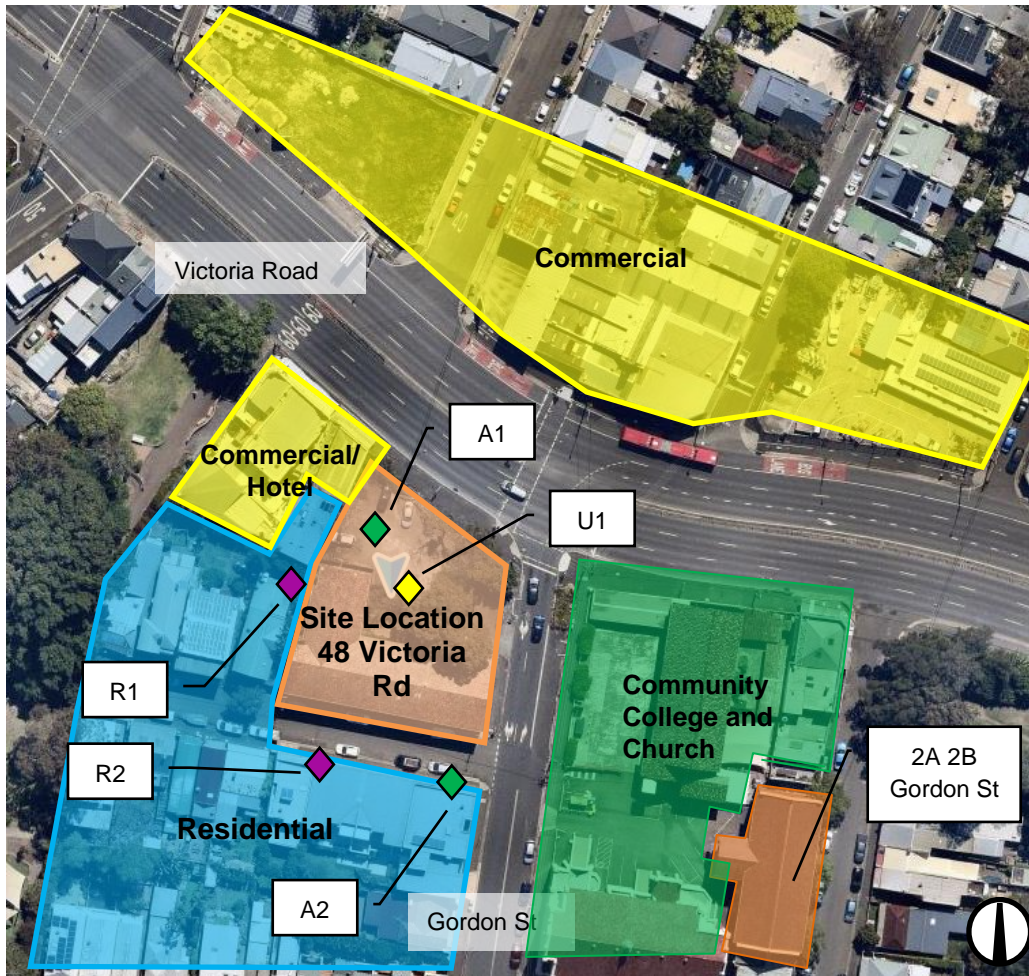
Figure 1 Aerial image of the area showing an overview of the site and measurement locations

The site location at 48 Victoria Road is shown in Figure 1. To the north of the site is Victoria Road with commercial premises opposite. To the west of the site there is a commercial storefront with residents directly behind adjacent to the site at 66 Victoria Road. Residential receivers also surround the site to the south and West and to the east is the Community college and Church. The unattended logging location is labeled U1, the attended measurements are labelled A1, A2 and A3 and closest residents R1 and R2.