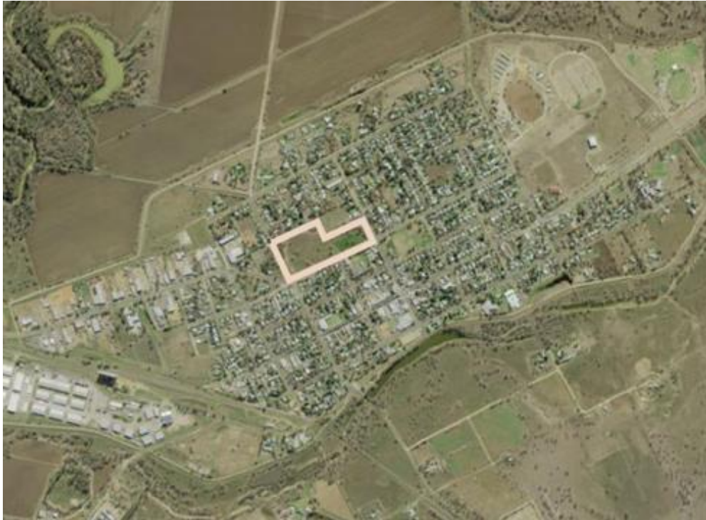
Figure 2: Location for the new High School Site in the Wee Waa Town Centre