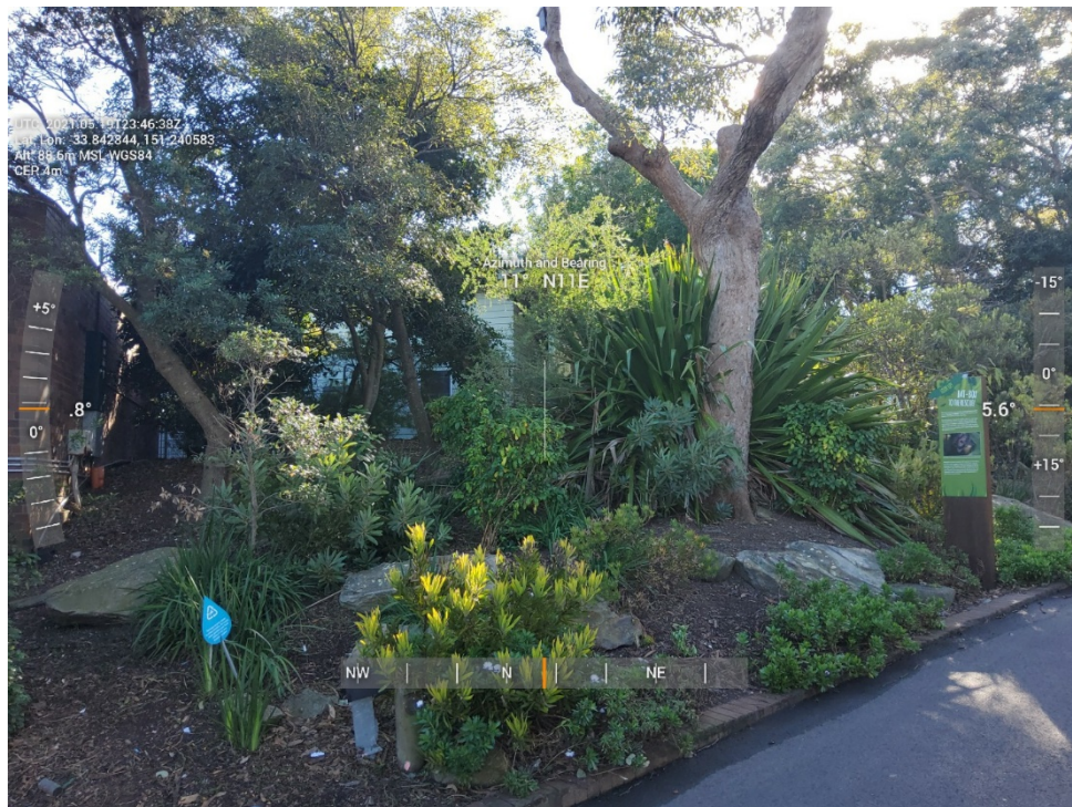
Photo 2.2: View of an area of managed landscaping/gardens within the Zoo grounds near the proposed Nutrition Centre location.