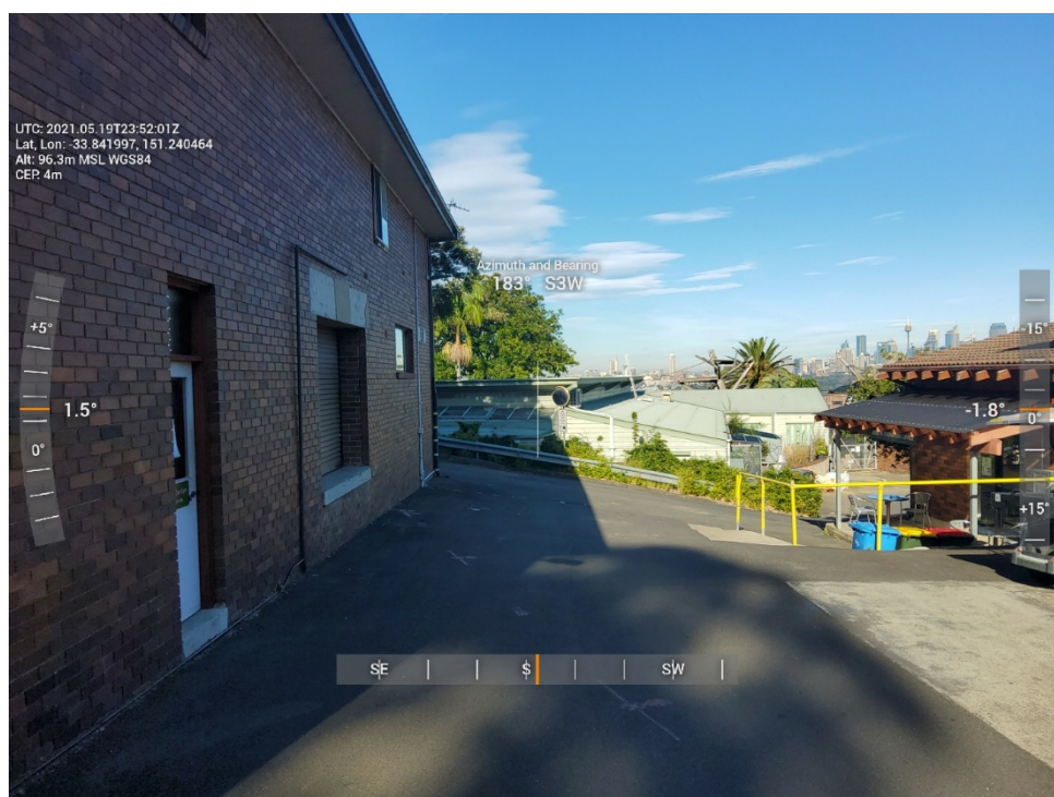
Photo 2.1: View of part of the site of the proposed Nutrition Centre, looking south towards the existing Reptile Exhibit Centre. The brick buildings to the left and right of the photo are to be demolished as part of the project.

The following photographs show the area on and around the proposed Nutrition Centre.