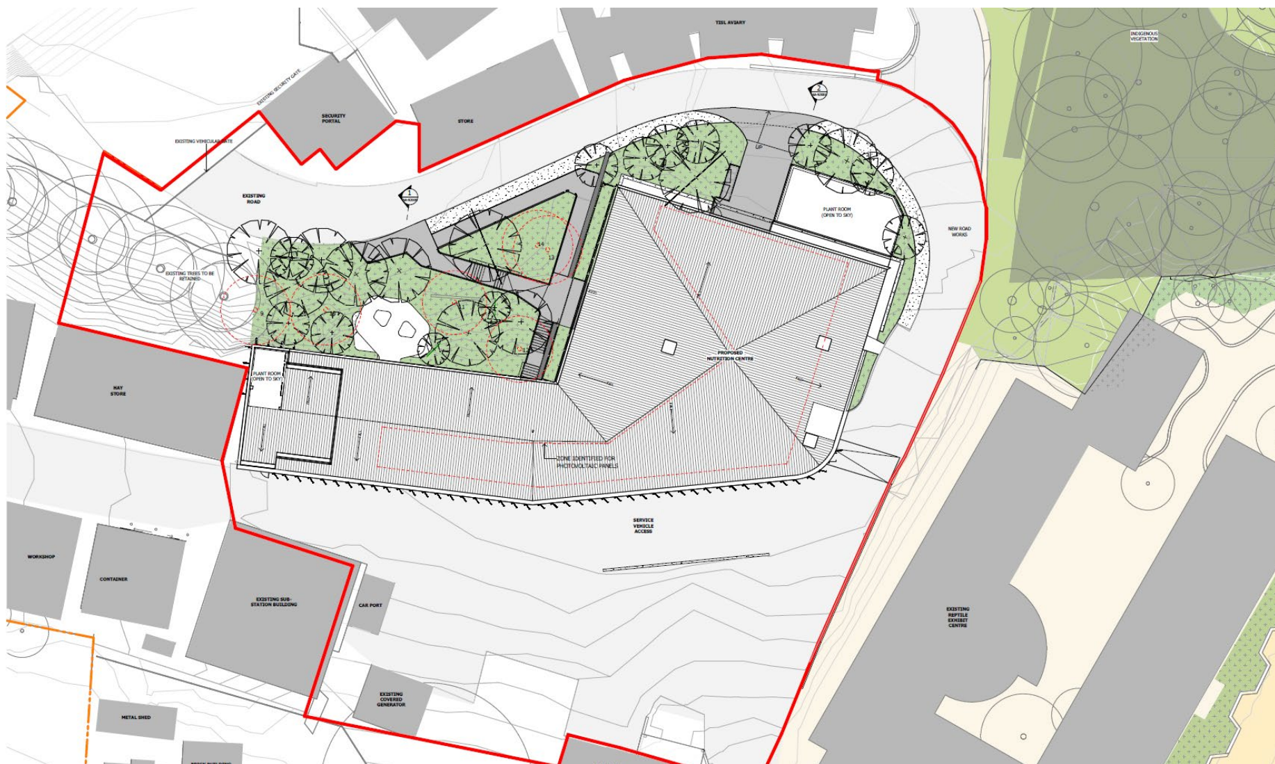
Figure 2.1: Site Plan Extract. North (approx.) to top of page.