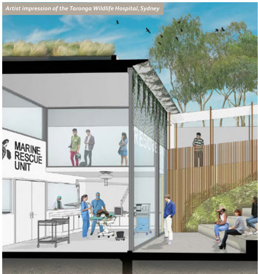
Artist impression of the Taronga Wildlife Hospital, Sydney