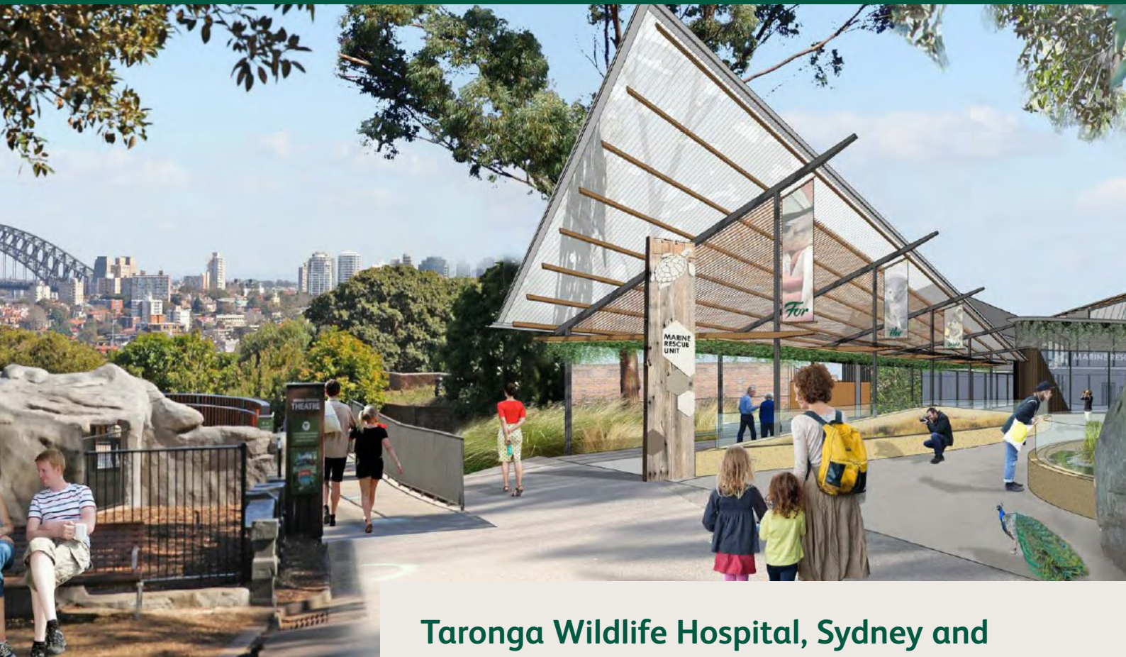
Artist impression of the entry to Taronga Wildlife Hospital, Sydney