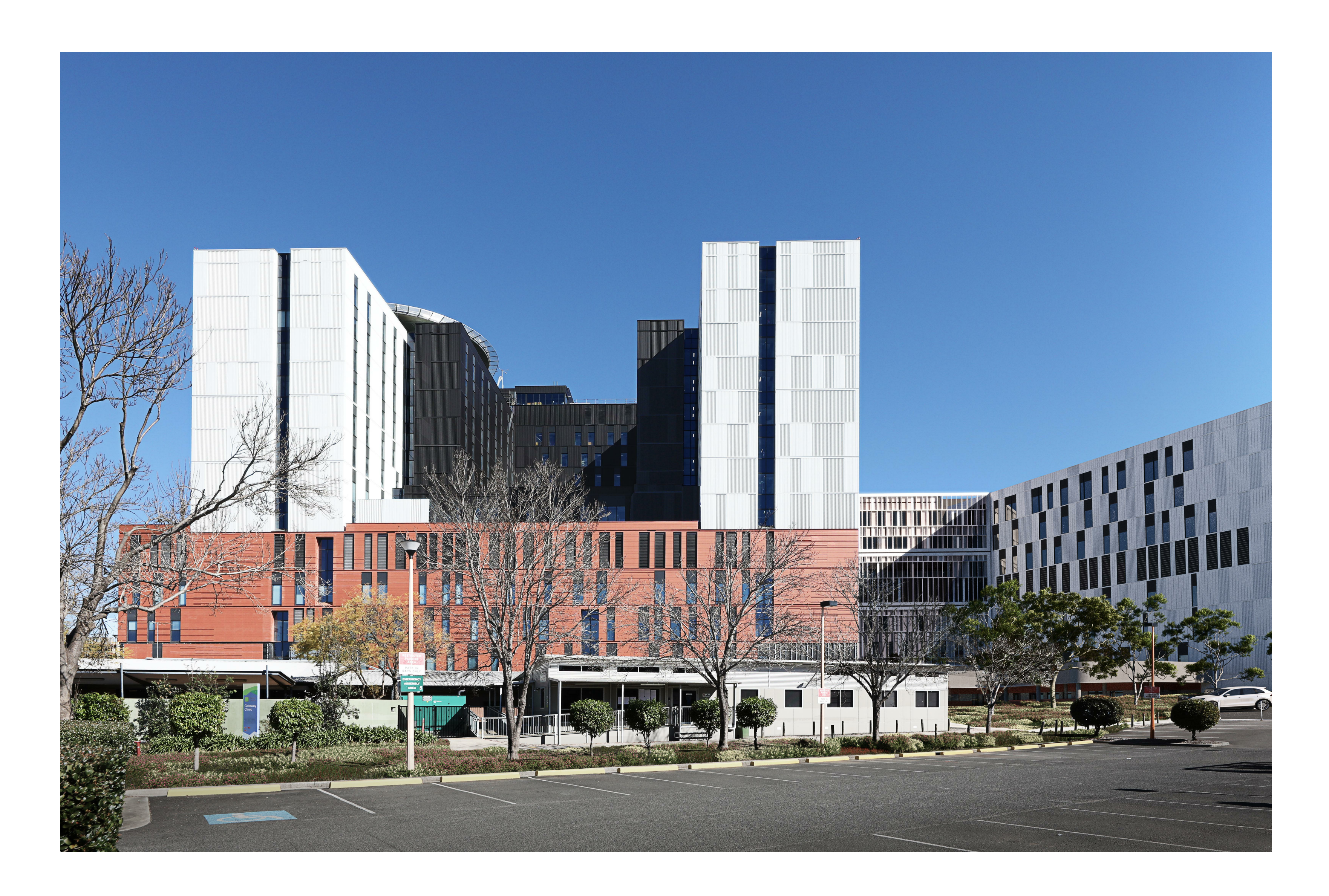
2 VIEW 2 FROM CANCER CENTRE