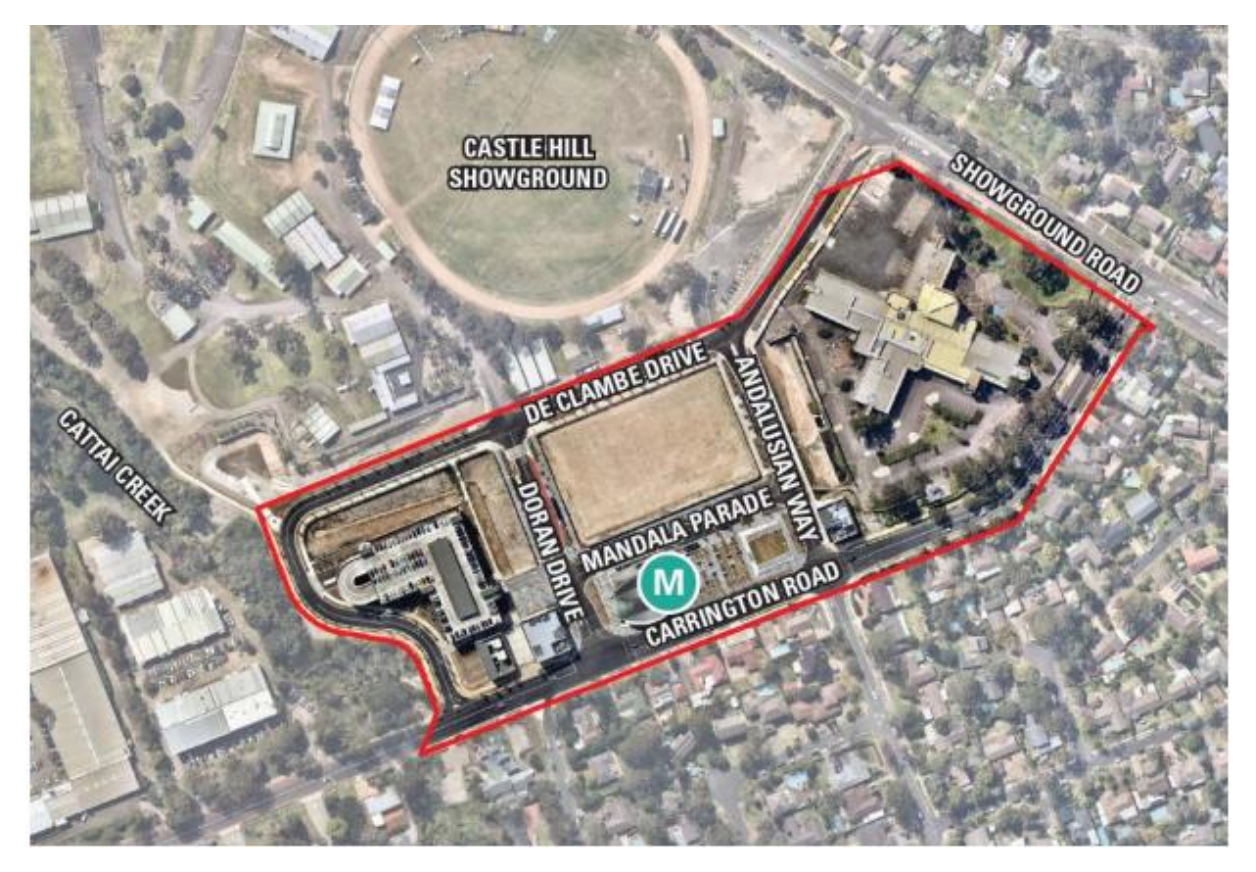
Figure 1 – Site Plan for Doran Drive site within Hills Showground Precinct