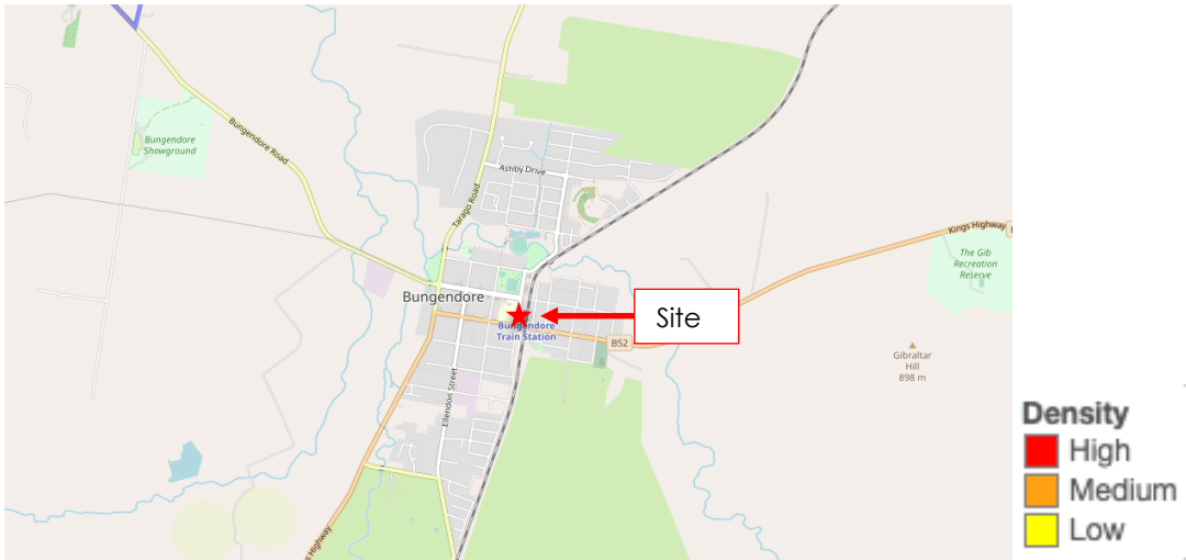
Figure 7: Incidents of theft (break and enter non-dwelling) hot spot map