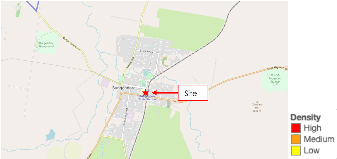
Figure 10: Incidents of theft (steal from dwelling) hot spot map