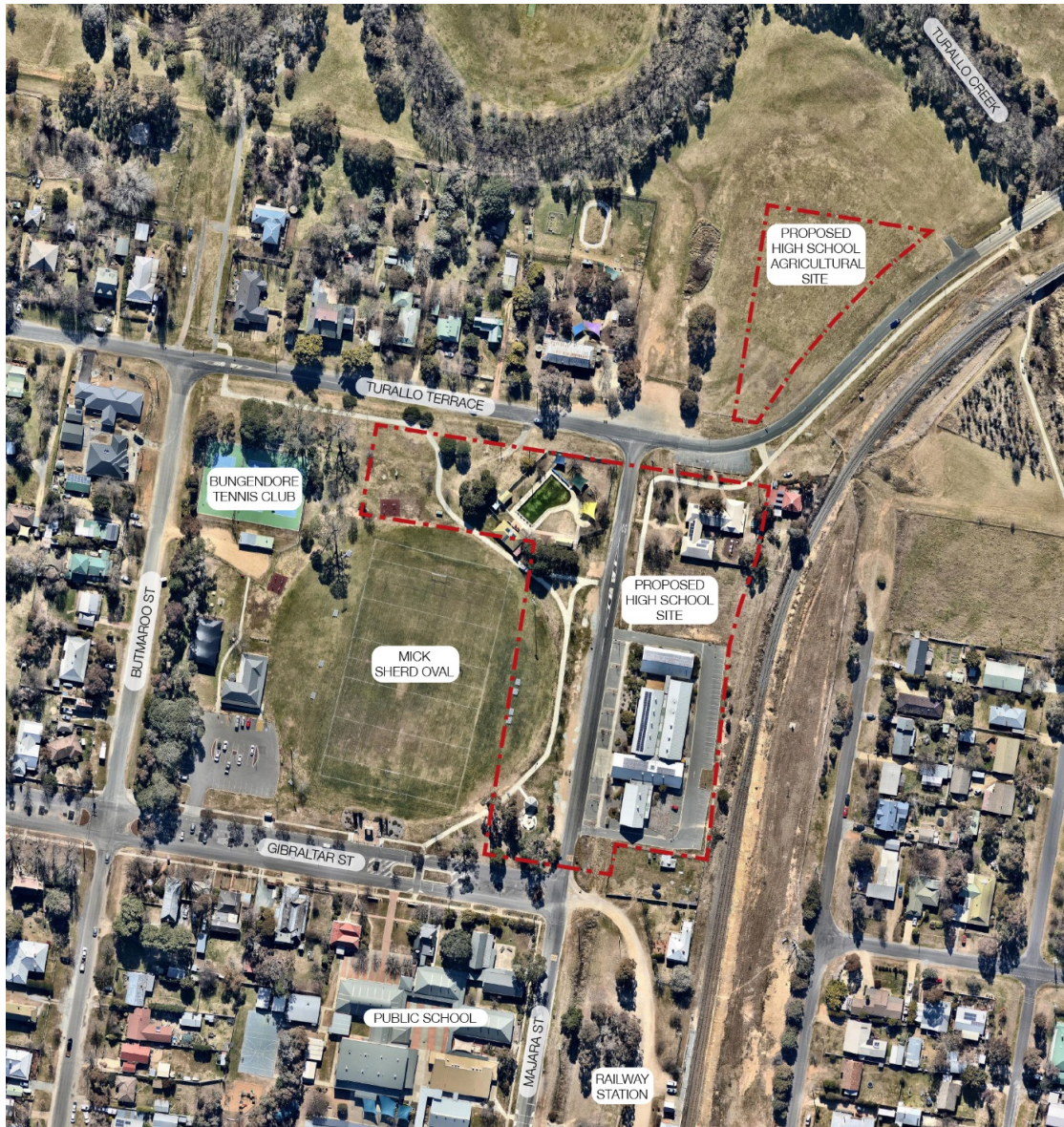
Figure 2: Site aerial depicting the land subject to the proposed High School.