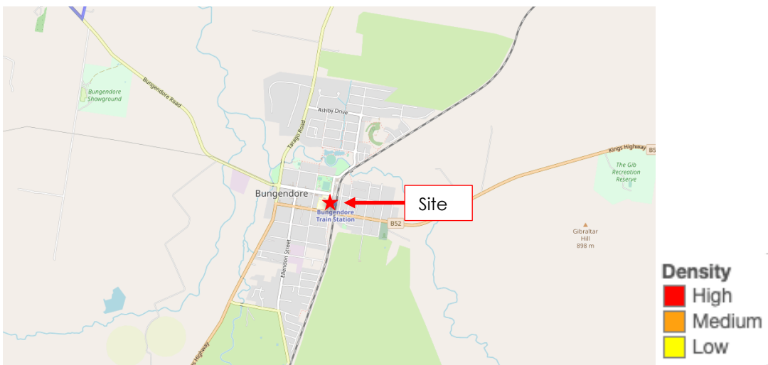
Figure 9: Incidents of theft (steal from motor vehicle) hot spot map