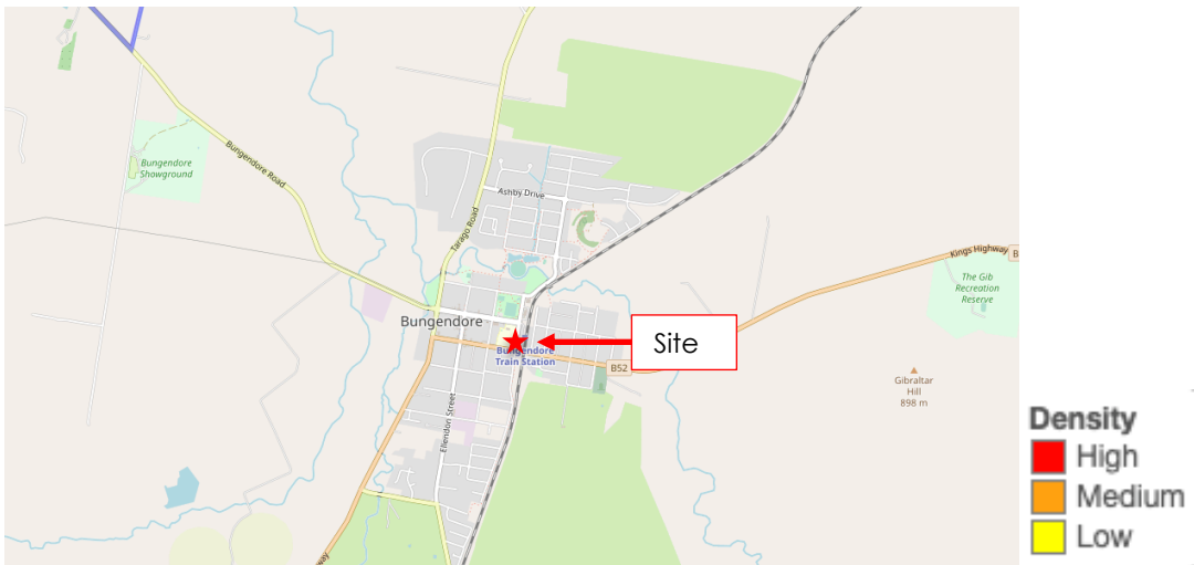
Figure 11: Incidents of theft (steal from person) hot spot map