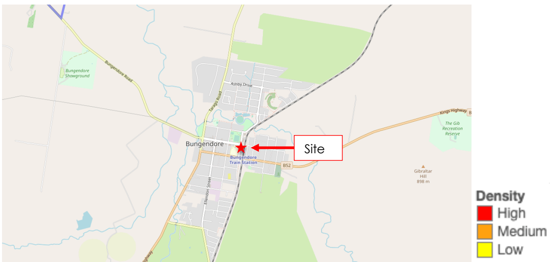
Figure 6: Incidents of theft (break and enter dwelling) hot spot map