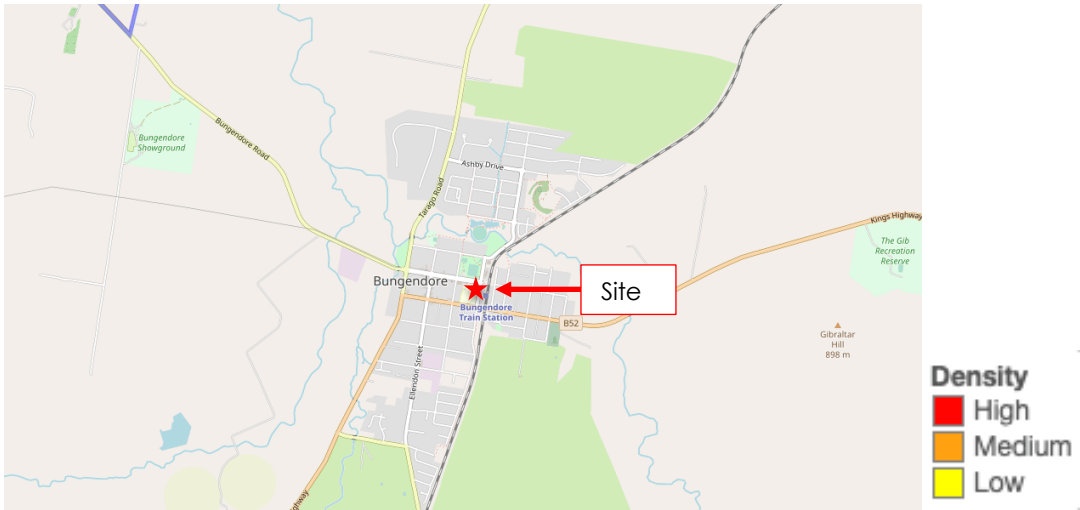
Figure 4: Incidents of non-domestic assault hot spot map