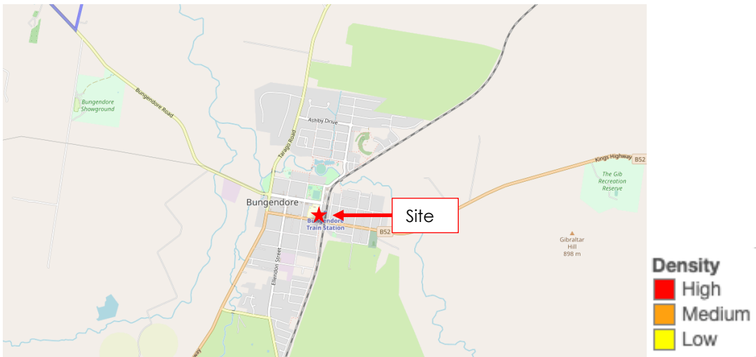
Figure 5: Incidents of robbery hot spot map