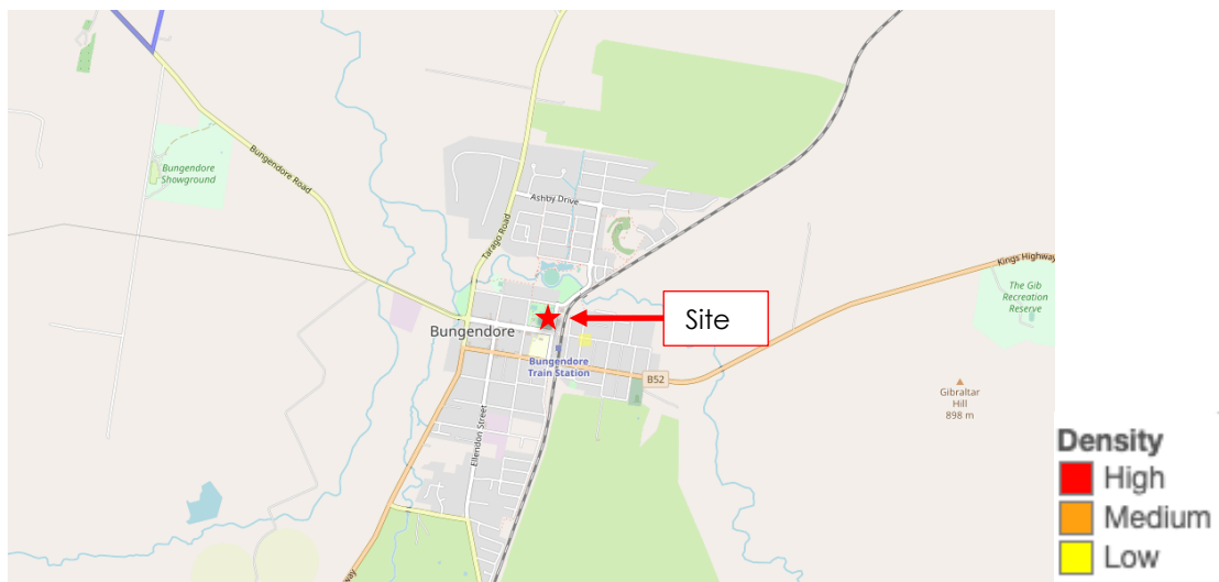
Figure 3: Incidents of domestic assault hot spot map

Hotspots indicate areas of high crime density (number of incidents per 50m x 50m) relative to crime concentrations across NSW.