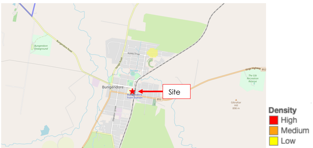
Figure 12: Incidents of malicious damage to property hot spot map

Overall, the crime data for the suburb of Bungendore and Queanbeyan-Palerang Regional LGA point to a low-incident crime environment .