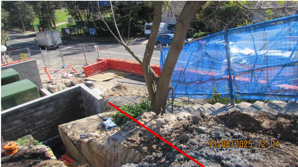
As can be seen, the tree will have a restricted root zone on both sides of the tree.