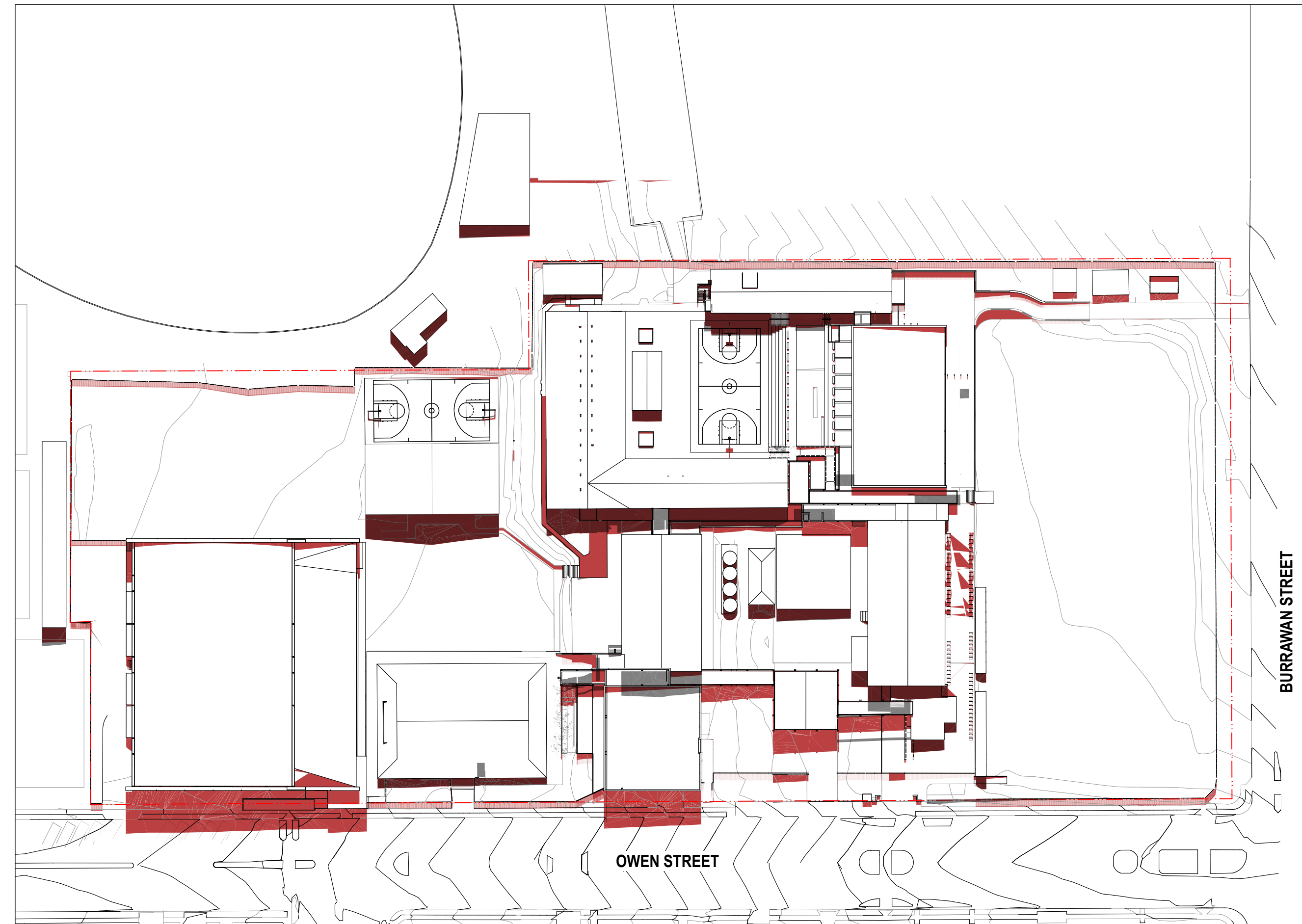
01 3D VIEW Shadow Diagram - December 21 9am NTS