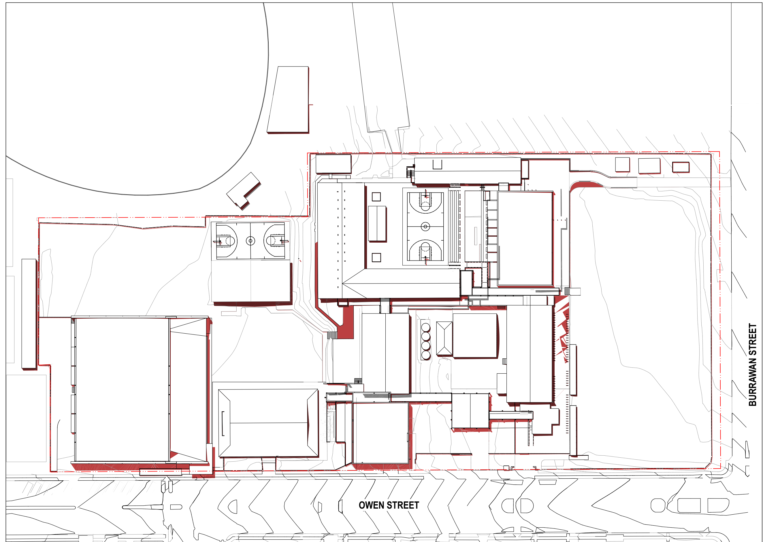
03 3D VIEW Shadow Diagram - December 21 11am NTS