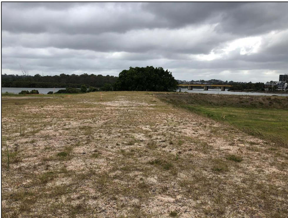
View north west towards Meadowbank Rail Bridge over Parramatta River. Memorial Park (obelisk) is obscured by vegetation.

There is no line of site between the study area and the heritage listed items located to the west.