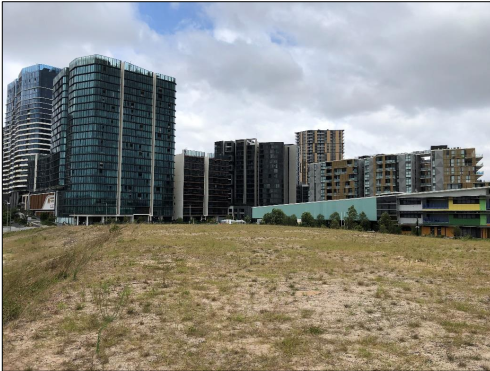
View south west across study area towards Millennium Parklands and Newington Armament Depot and Nature Reserve.

There is no line of site between the study area and the heritage listed items located to the west.