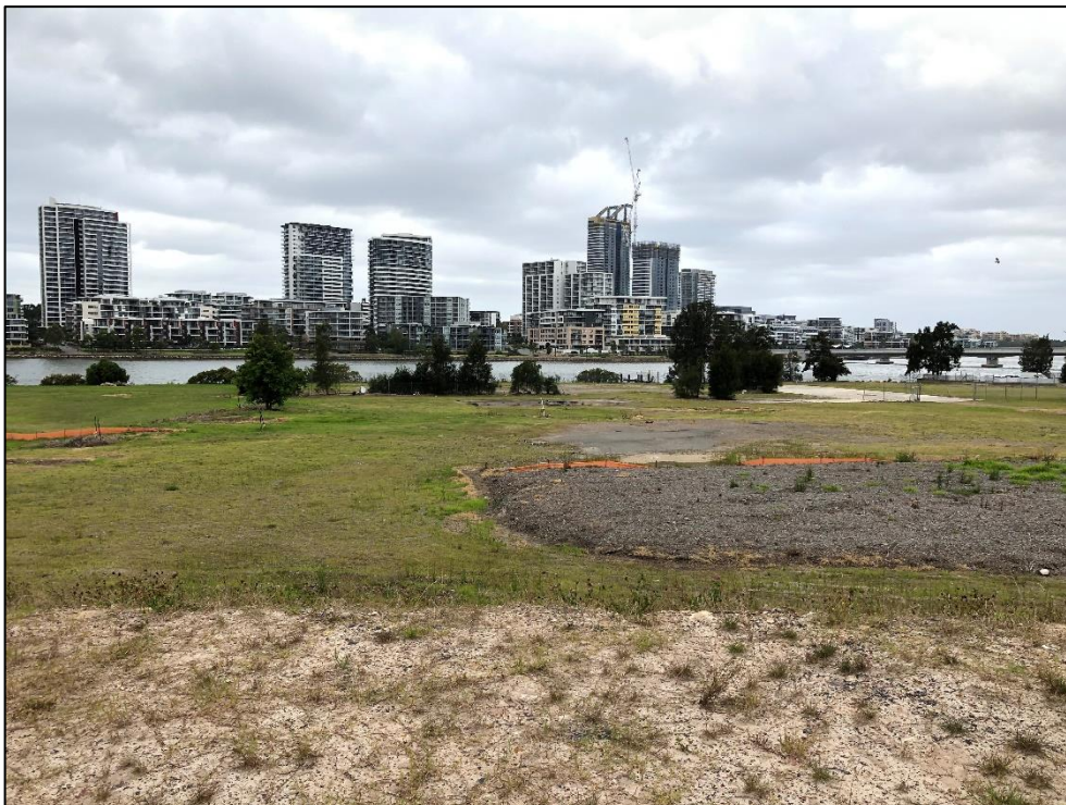
View south east from study area towards Rhodes and the Rhodes Railway Station group.

There is no line of site between the study area and the Wetlands.