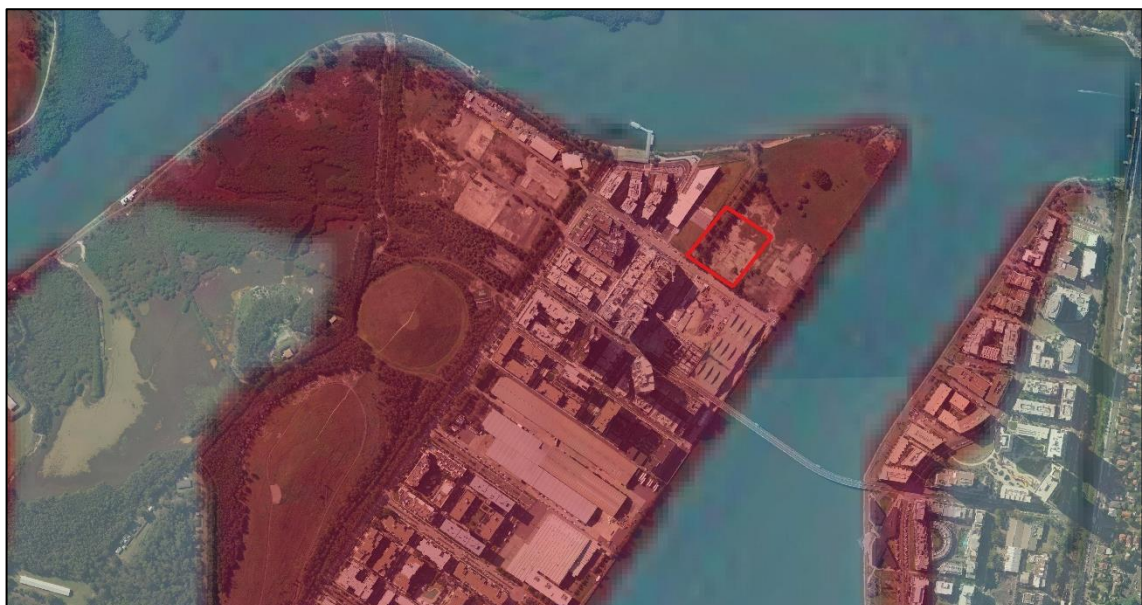
Figure 3: Reclamation of the study area and surrounds highlighted in brown. Study area edged in red (Nutley & Norman 2021a:12)