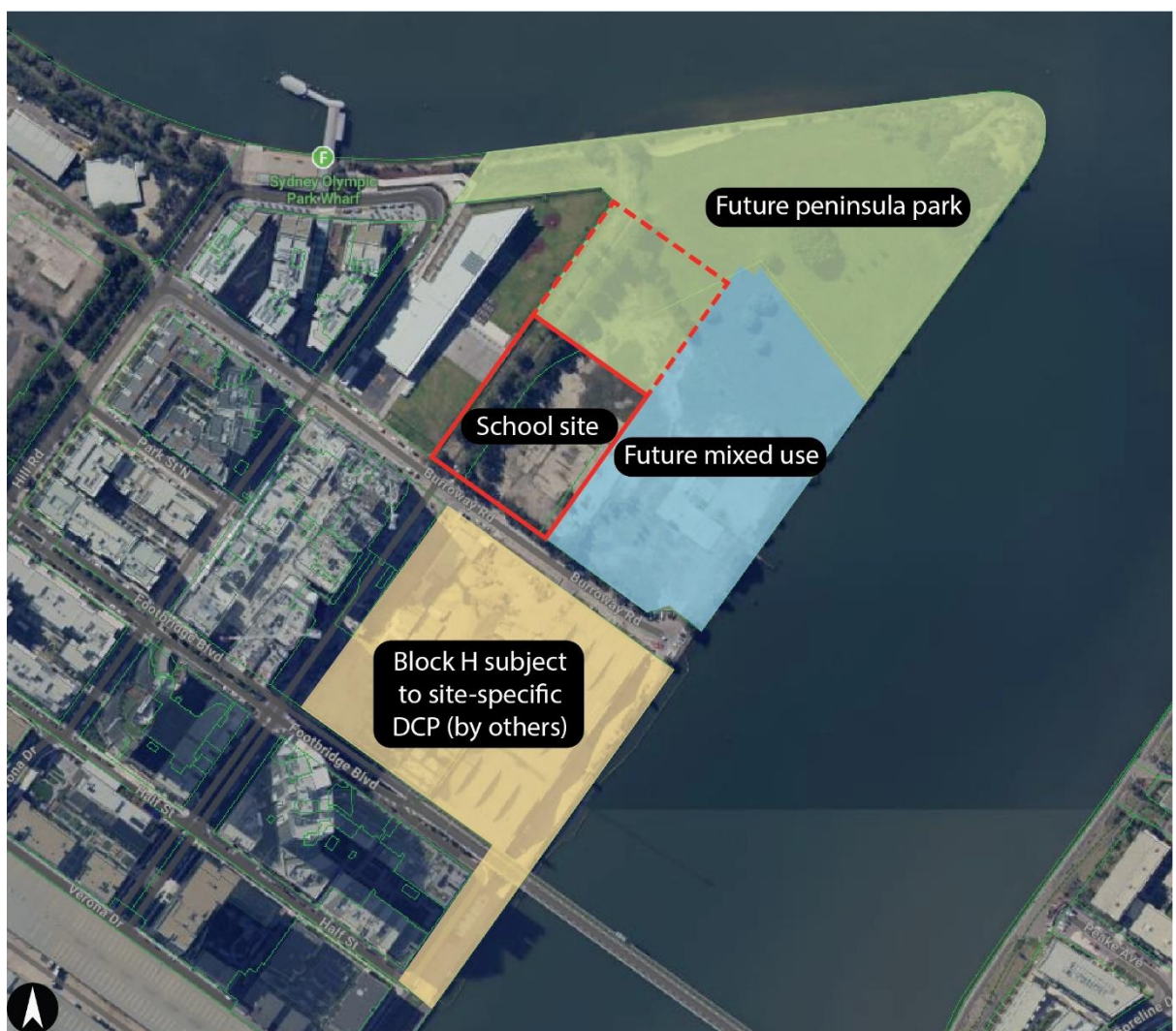
Figure 1: Site aerial map

The surrounding area is generally characterised by high rise residential and mixed-use developments. The site is directly adjacent to the Wentworth Point Peninsula Park and immediately east of Wentworth Point Public School.