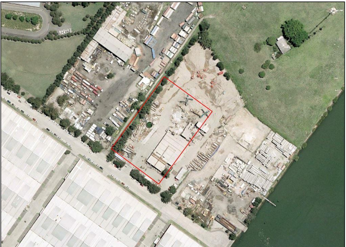
Figure 5: 2009 aerial image of study area shows concrete covering majority of study area, and land being used for industrial purposes (Nutley & Norman 2021a:13)