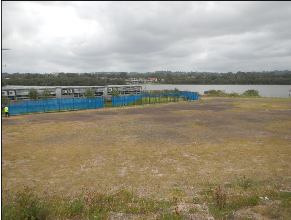
View north west from approximate study area towards Wetlands.

There is no line of site between the study area and the Wetlands.