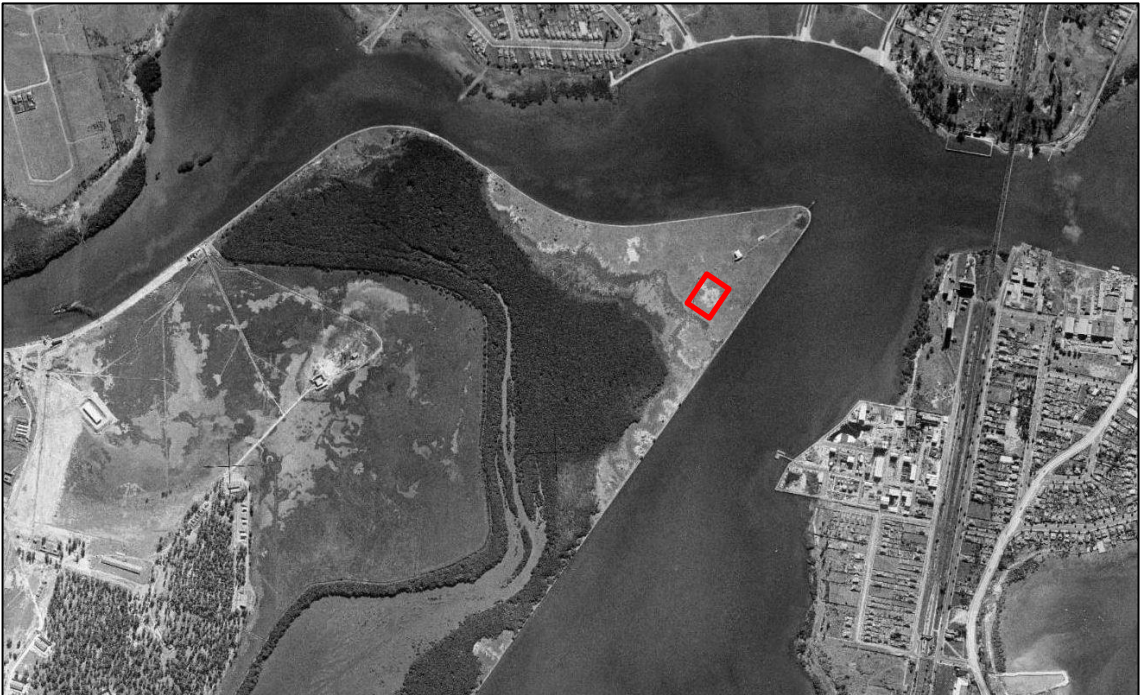
Figure 4: 1943 aerial image of Wentworth point showing the study area as existing landfill, approximate study area location shown edged in red (Nutley & Norman 2021a:12)