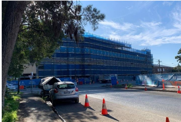
Edinburgh Road and Sydney Steel Road