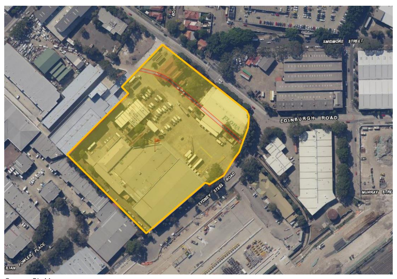
Figure 1 Aerial view of Site

The Site is bisected by a Sydney Water easement which runs through the northern part of the Site from Sydney Steel Road to the east to the western adjoining Site, 76B Edinburgh Road.