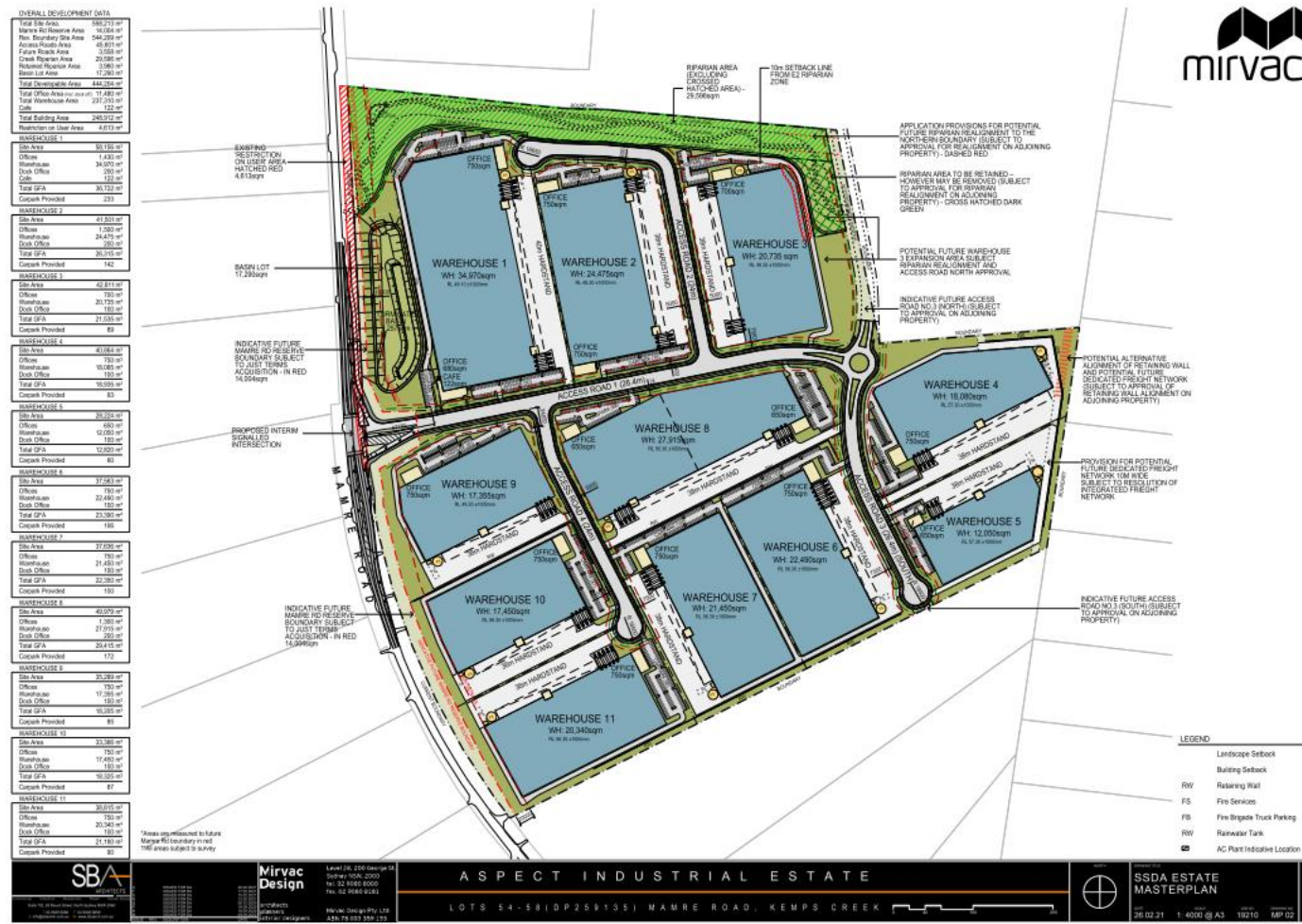
Figure 1 Site Masterplan