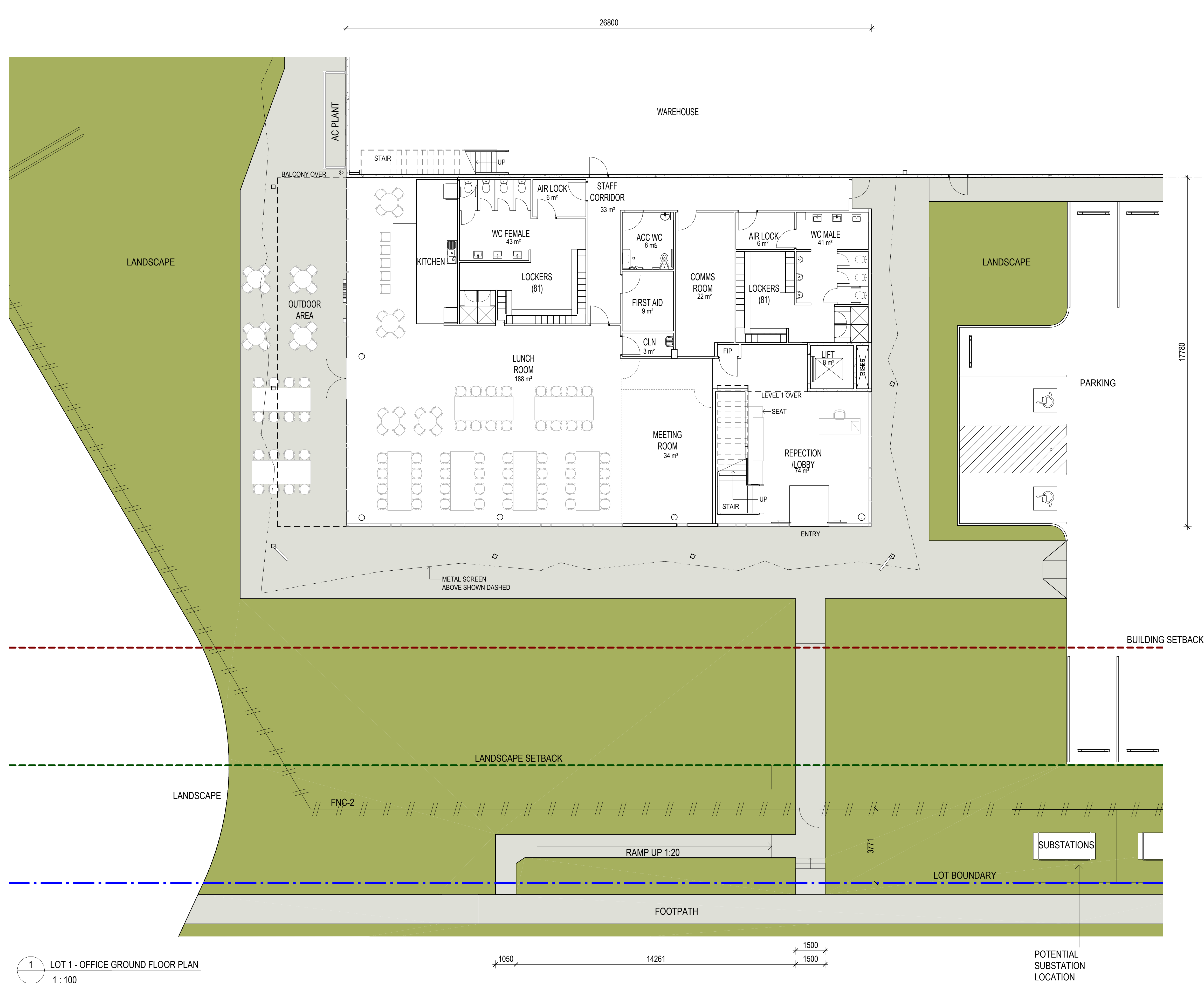
1 LOT 1 - OFFICE GROUND FLOOR PLAN 1 : 100