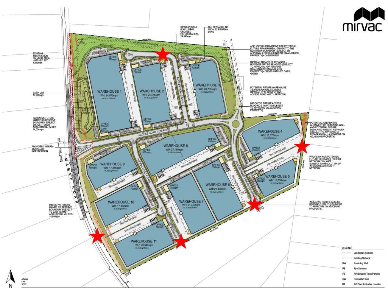
Figure 6: Noise Monitoring Locations Plan