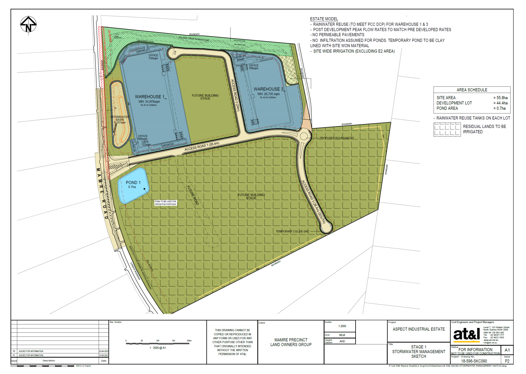
Figure 5: Stage 1 Stormwater Management Plan