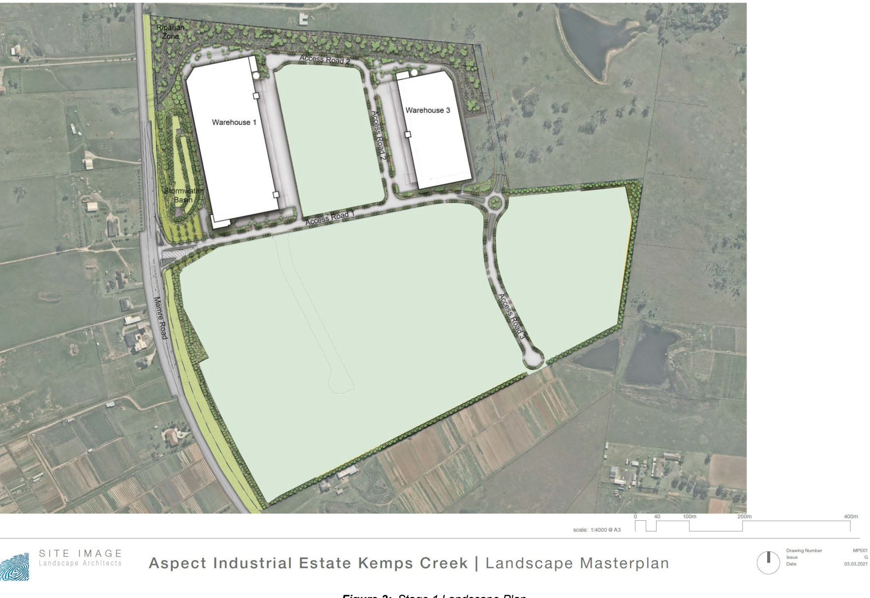
Figure 3: Stage 1 Landscape Plan