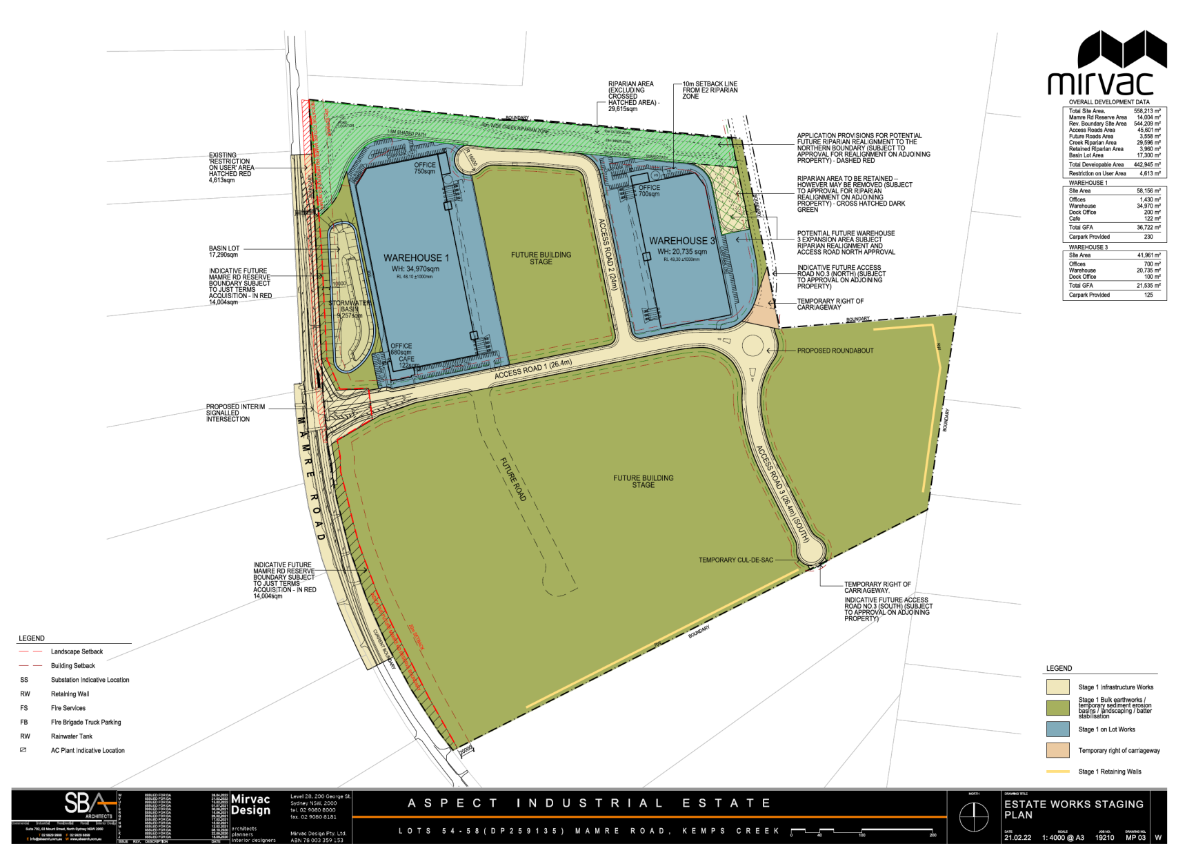
Figure 2: Stage 1 Plan