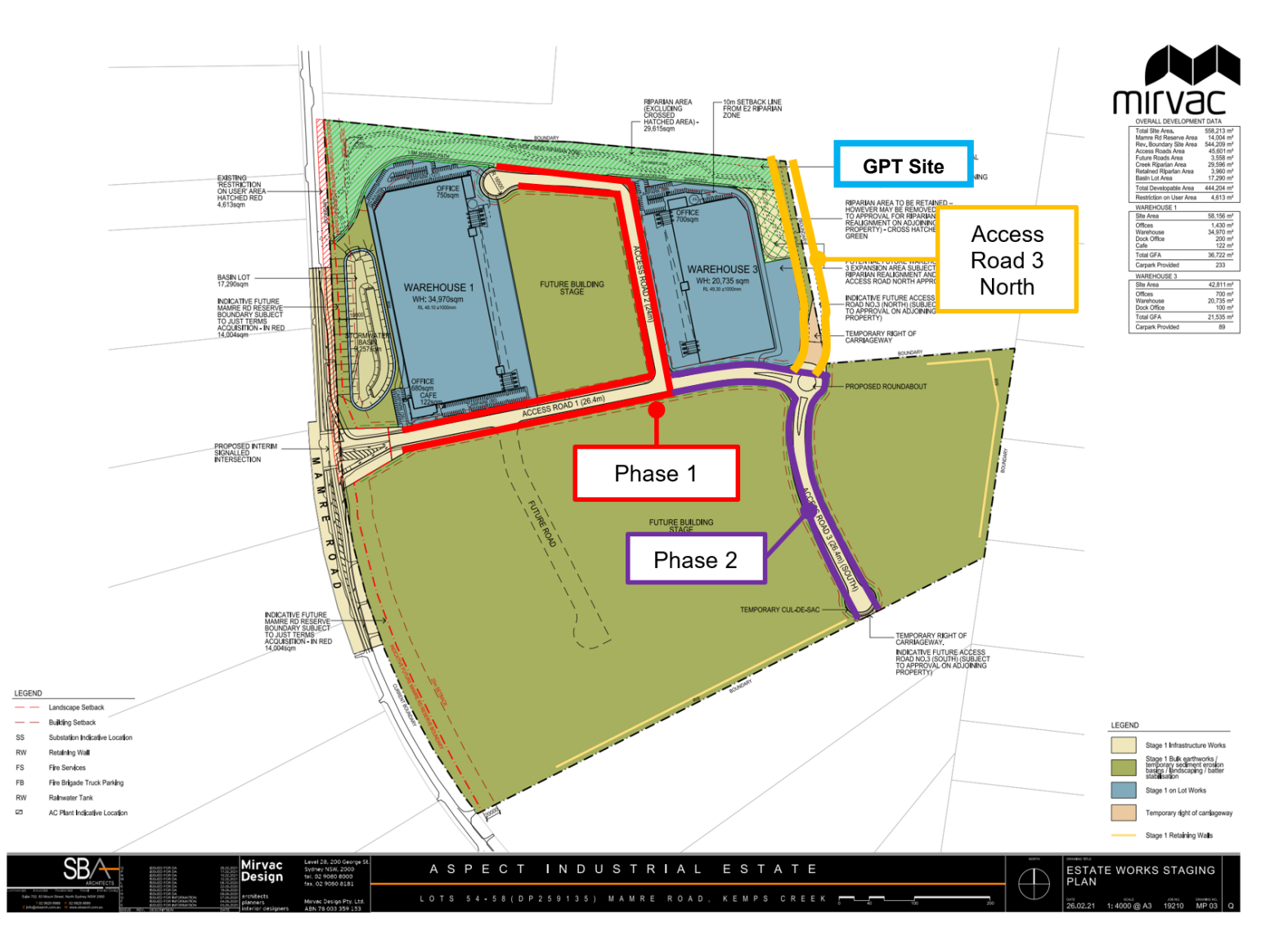
Figure 4: Stage 1 Development Road Works Phasing Plan