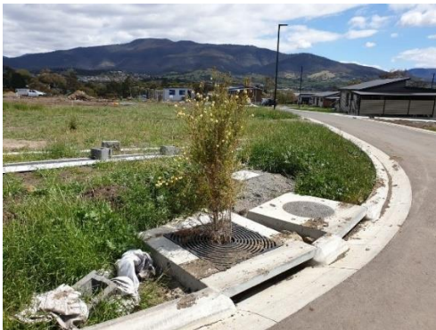
Figure 3: Filterra tree pit – kerb inlet

In some cases, the Filterra tree-pit may need to be located with a grated drain entry or away from the kerb as shown in Figure 4. In this instance, a transition box is used to convey water from the kerb to the Filterra tree-pit.