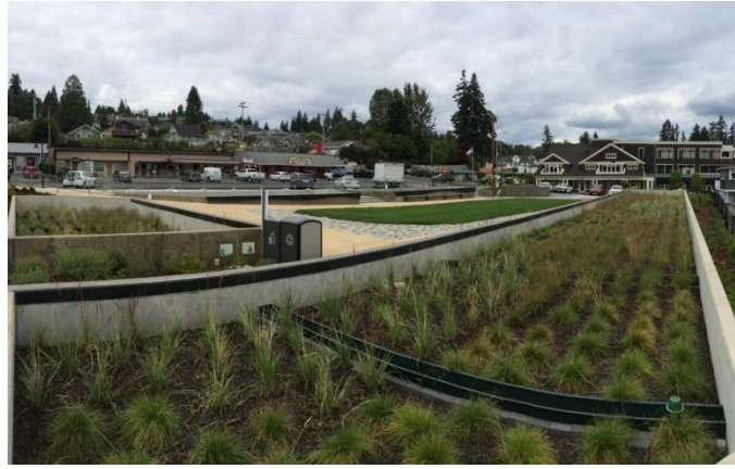
Figure 8: Filterra bioscape – hard edging