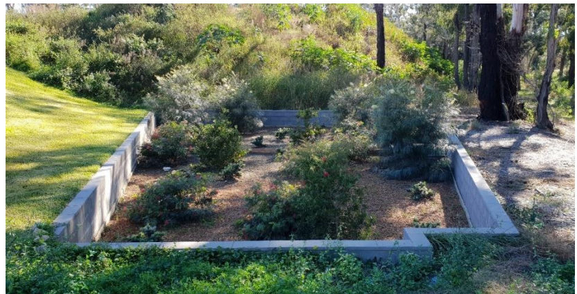
Figure 7: Filterra bioscape – hard edging