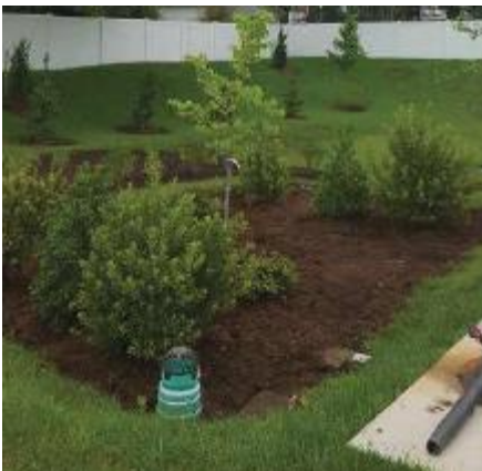
Figure 6: Filterra bioscape – soft edging

Within larger Filterra bioscape systems the total filtration area is divided into “cells”. Each individual cell is design to have a maximum area of 90m 2 . Typically timber sleepers form the dividing walls between each cell, see figure 7 below.