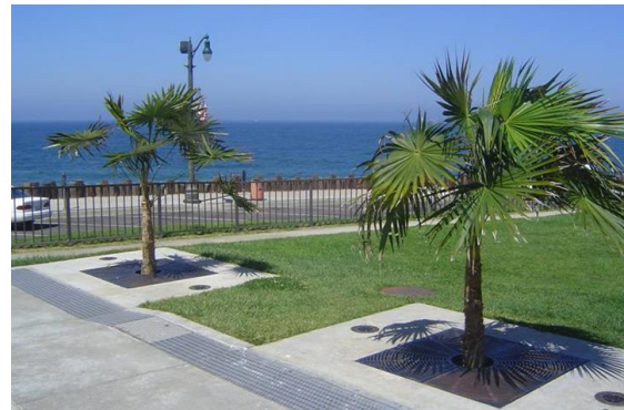
Figure 4: Filterra tree pit – grated drain inlet

Typically, larger storms are bypassed around the Filterra system, however in some cases the bypass may be conveyed via a small pipe through Filterra tree-pit system, for example small downpipe applications, see Figure 5 below.