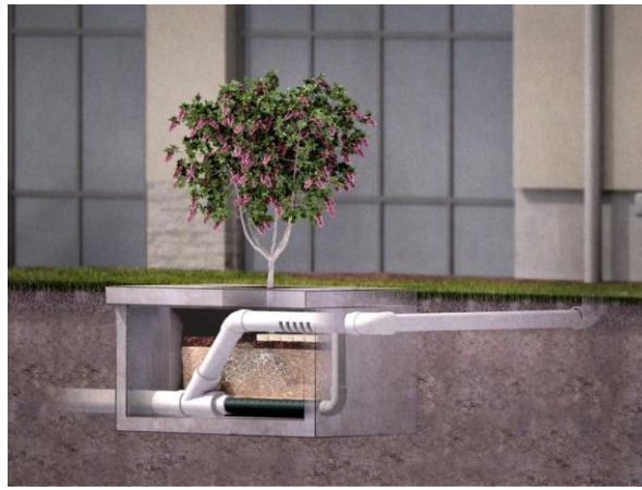
Figure 5: Filterra tree pit – with internal bypass

The Filterra bioscape system utilises impermeable liners placed within an excavation to create the media holding structure. The Filterra media, underdrain and associated distribution and collection systems are installed within this structure by Ocean Protect.