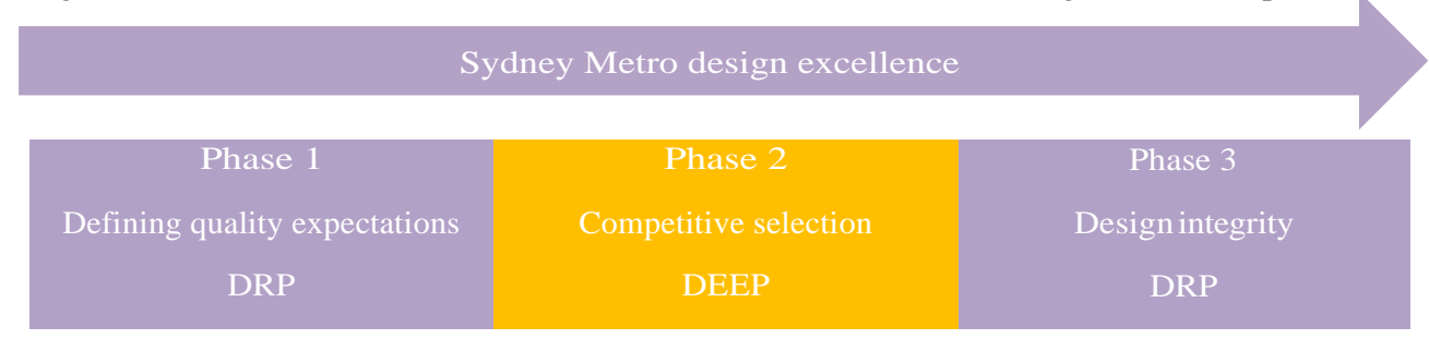
Figure 2: The Design Excellence process

The DEEP report, prepared at the completion of the competitive selection phase, is made available for the Sydney Metro Design Review Panel for the purposes of the design integrity measures.