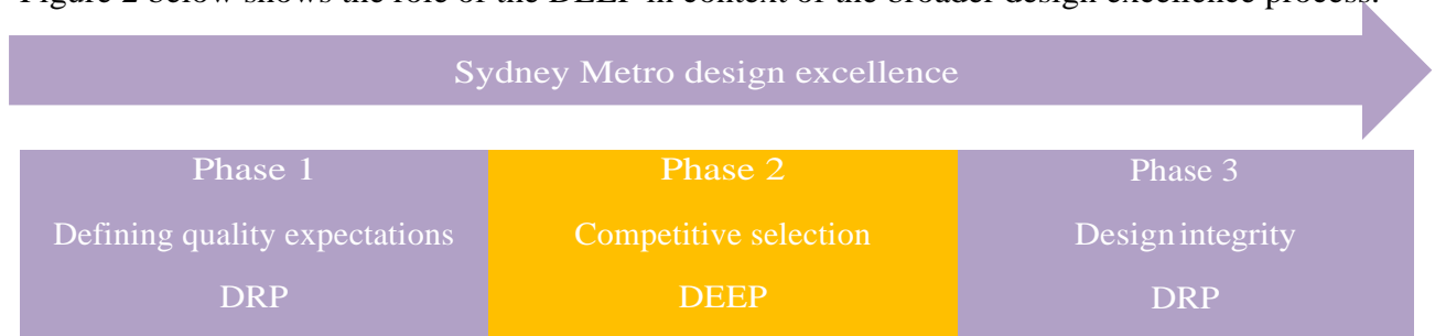
Figure 2: The Design Excellence process

Figure 2 below shows the role of the DEEP in context of the broader design excellence process.