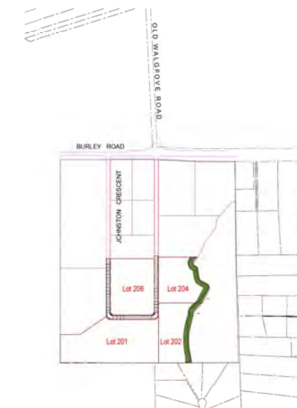
2 Location Plan