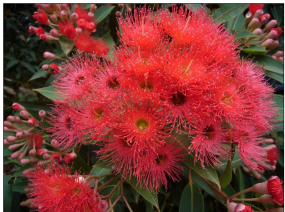
Eucalyptus ficifolia 'Baby Scarlet'