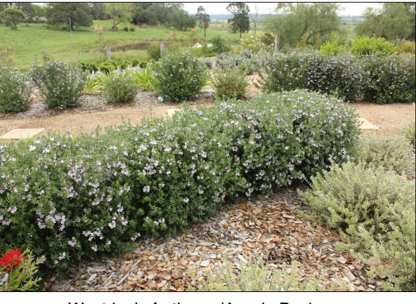
Westringia fruticosa 'Aussie Box'