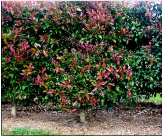
Acmena smithii 'BWNRED' 'Red Head'