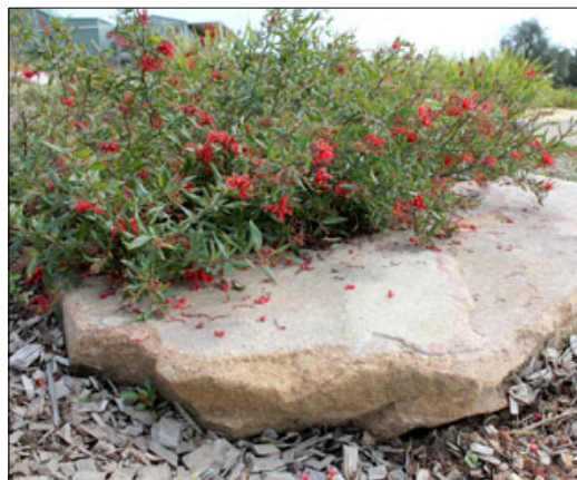
Grevillea rhyolitica x juniperina 'TWD01' 'Cherry Cluster'