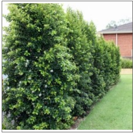
Syzygium paniculatum 'Backyard Bliss'