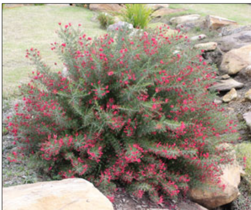
Grevillea rosmarinifolia 'H16' 'Crimson Villea'