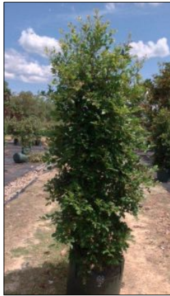
Syzygium australe 'Resilience'