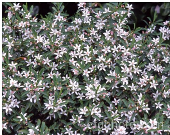
Eriostemon (syn. Philotheca) myoporoides