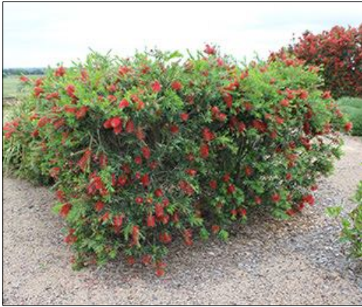
Callistemon viminalis 'LC01' 'Macarthur'