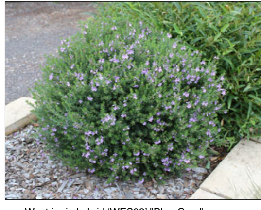
Westringia hybrid 'WES03' 'Blue Gem'