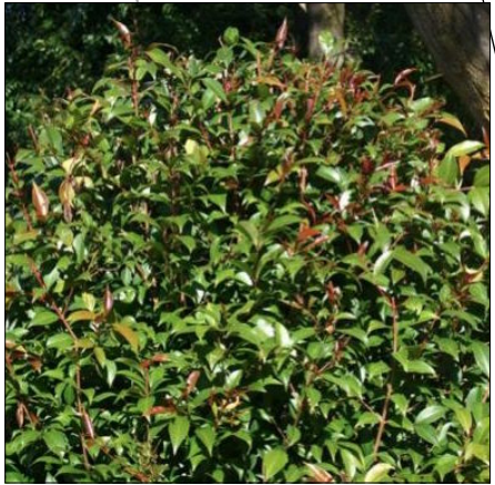
Acmena smithii var. minor 'Baby Lily'