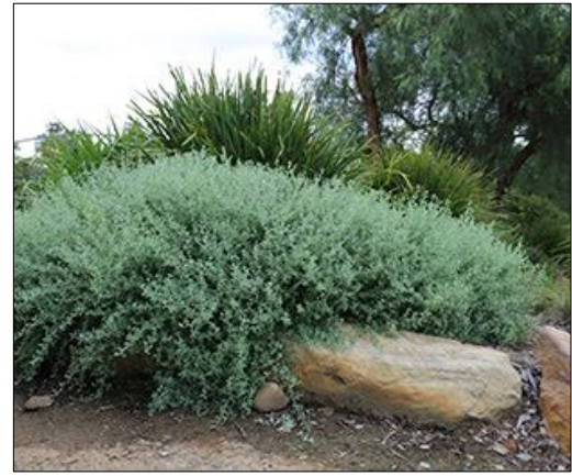
Rhagodia spinescens 'SAB01' 'Aussie Flat Bush'