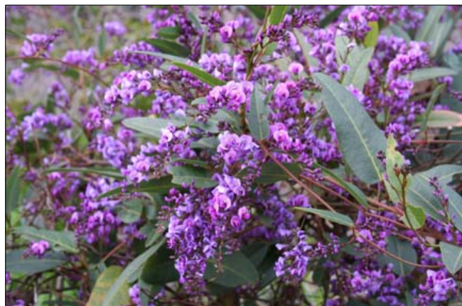
Hardenbergia violacea 'HB1' 'Meema'