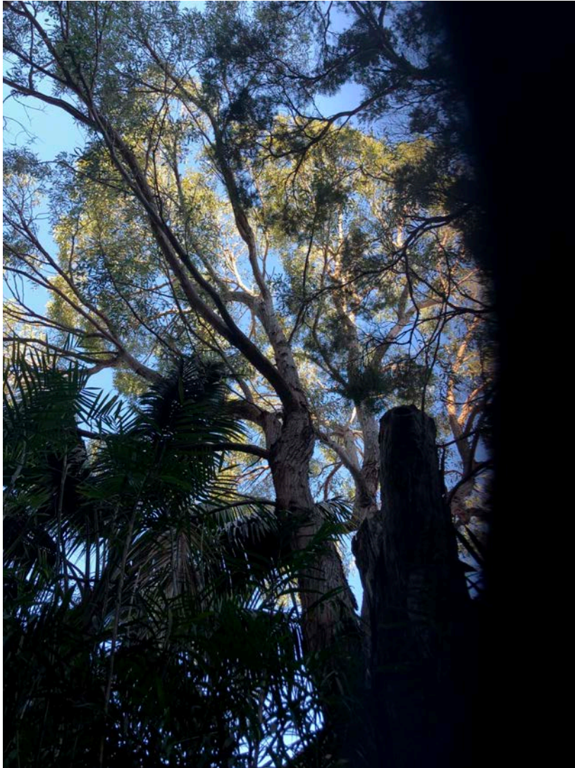
PHOTO 33- Tree 34. Photo shows the crown.