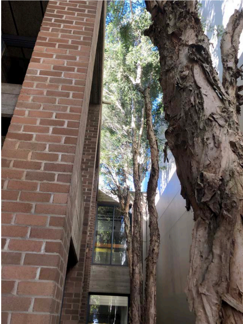
PHOTO 37- Trees 37-42 with tall slender trunks and small crowns formed above the buildings