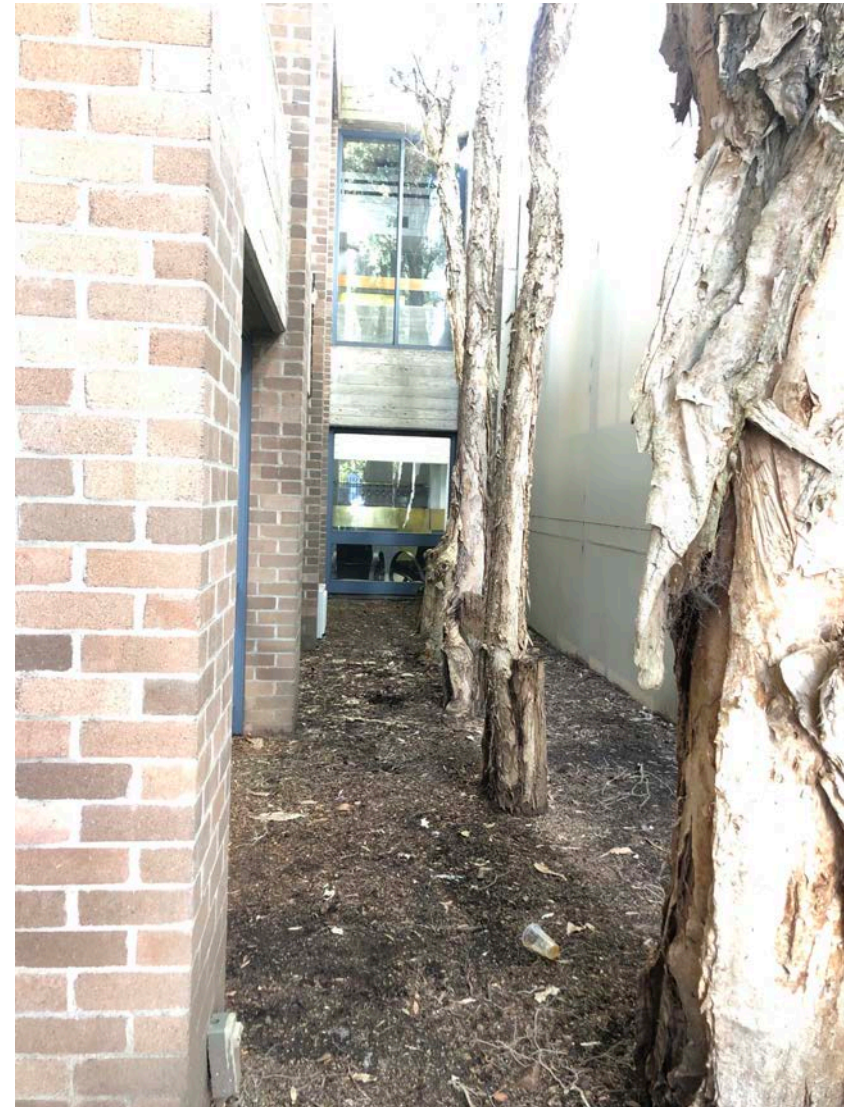
PHOTO 36- Row of Trees 37-42 planted in a narrow garden between buildings.