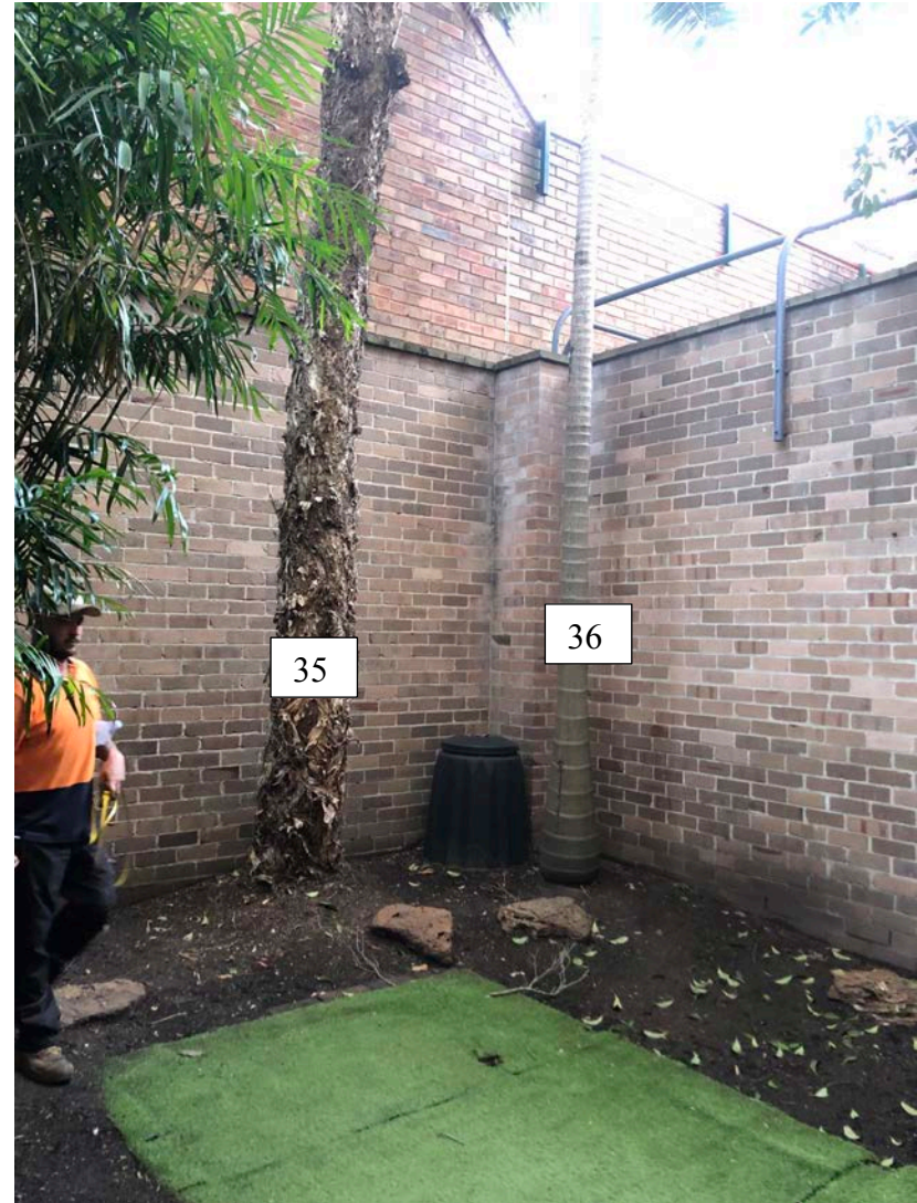
PHOTO 34- Shows the trunks of Trees 35 and 36 planted close to wall