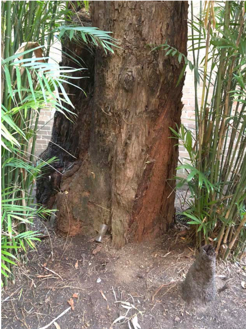
PHOTO 31- Tree 34. Photo shows the wound on the trunk.