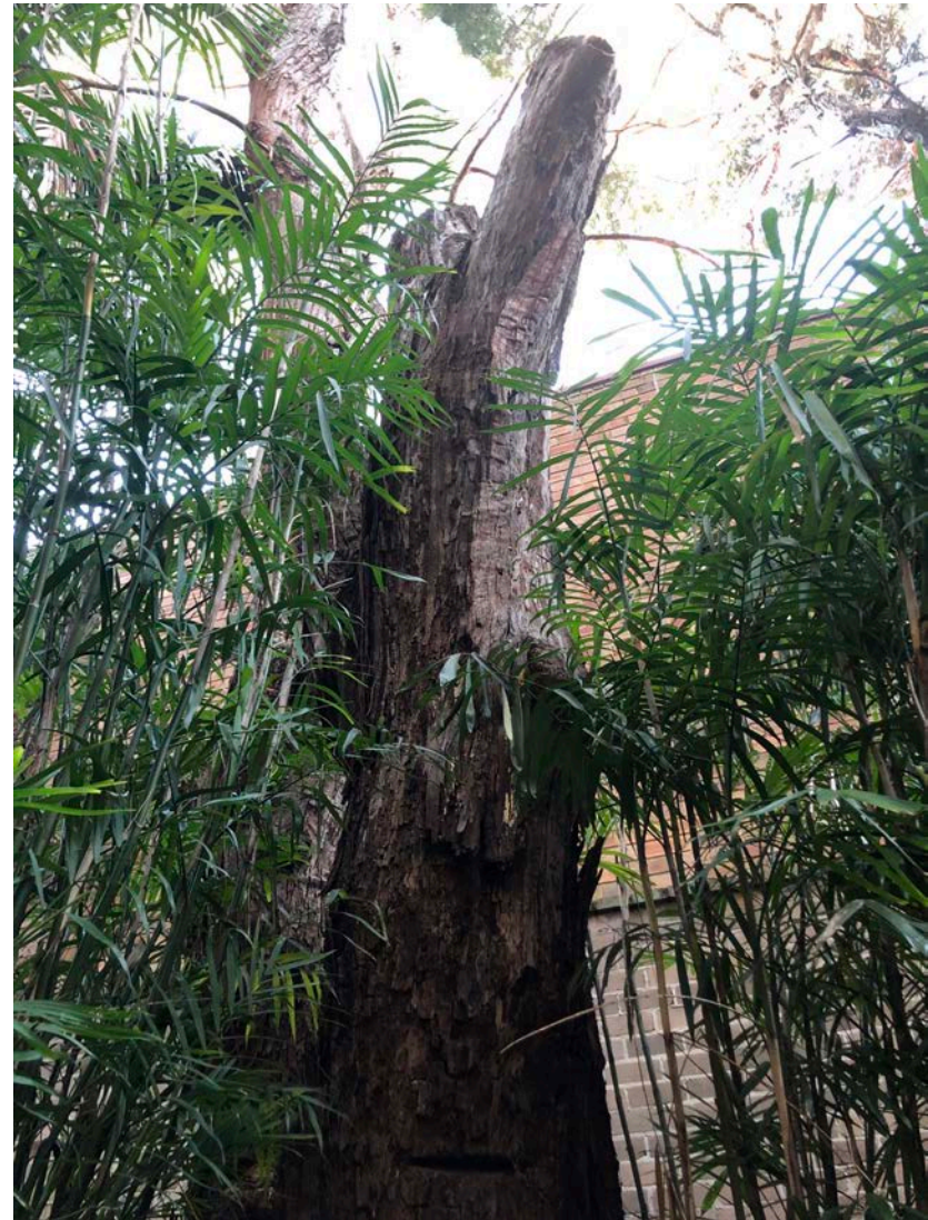
PHOTO 32- Tree 34. Photo shows the lopped and decaying leader.