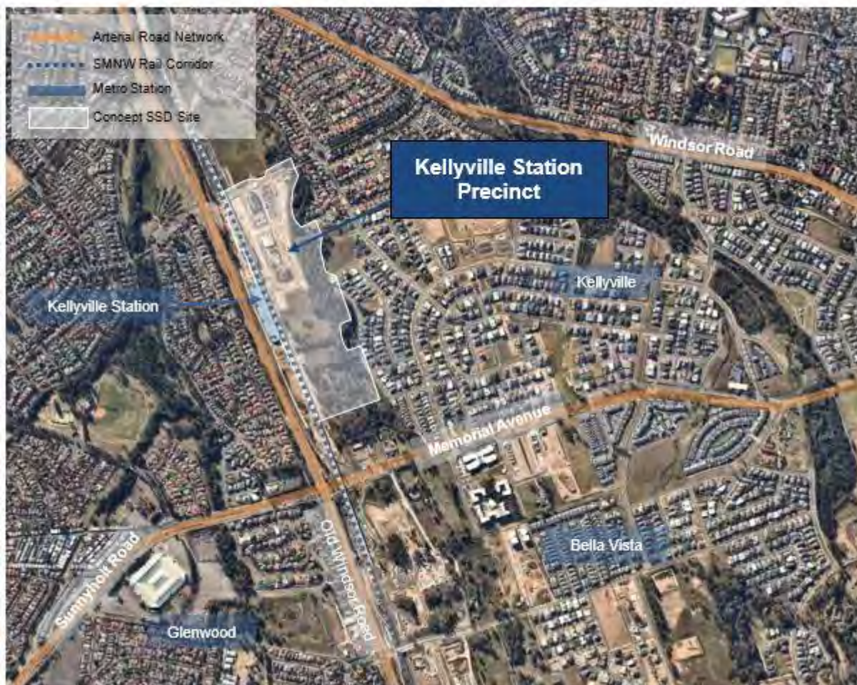
Figure 1 – The Kellyville Station Precinct SSD Site

The Kellyville Station Precinct is located in North West Sydney in the Hills Shire LGA. The SSD site (depicted below) spans an approximate 900m stretch of government owned land stretching from Samantha Riley Drive to approximately 200m north of Memorial Avenue and is bound by Elizabeth Macarthur Creek to the east and Old Windsor Road and the Metro North West Line (MNWL) to the west.