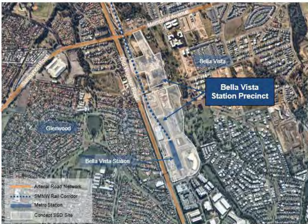
Figure 2 – The Bella Vista Station Precinct SSD Site