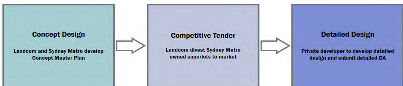
Figure 4 – Three Phase Design Process

The three phase process including the concept design stage is depicted in Figure 4 and detailed in Figure 5.