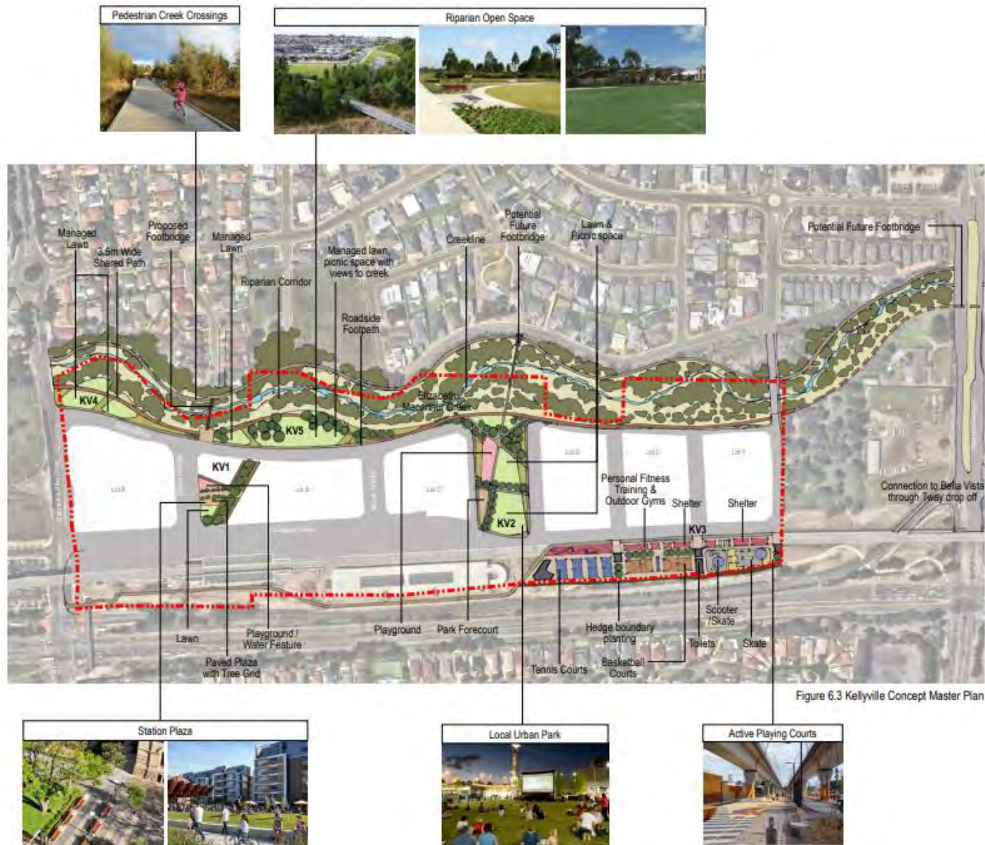
Figure 6.3 Kellyville Concept Master Plan