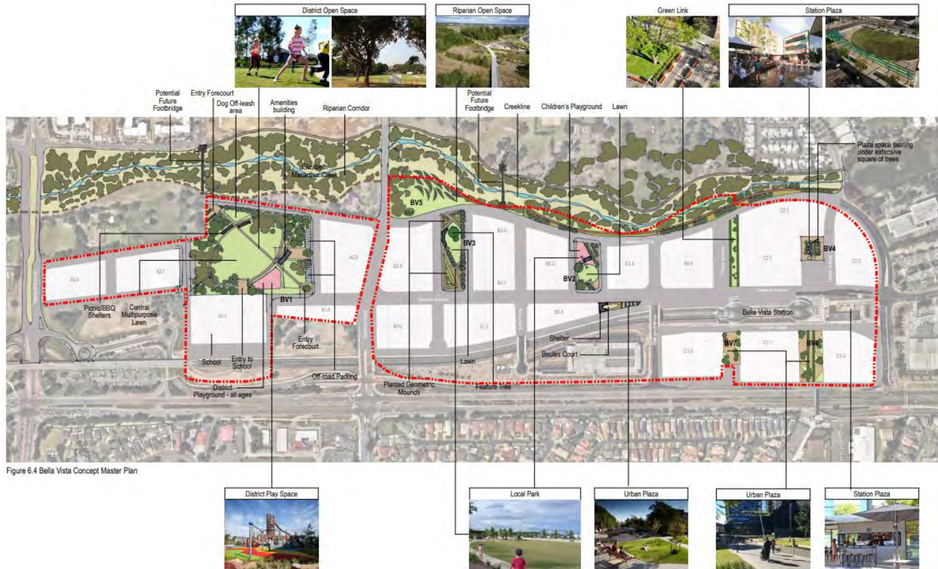
Figure 7 – Bella Vista Open Space Plan