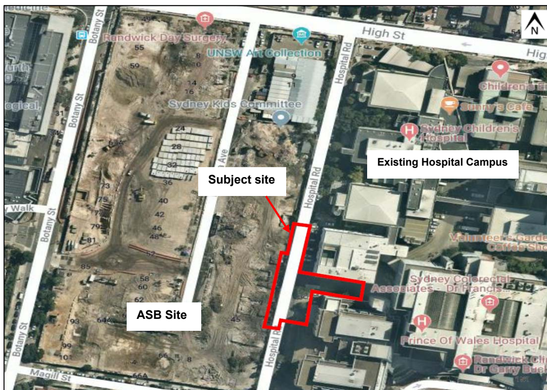
Figure 2 | Aerial view of the site