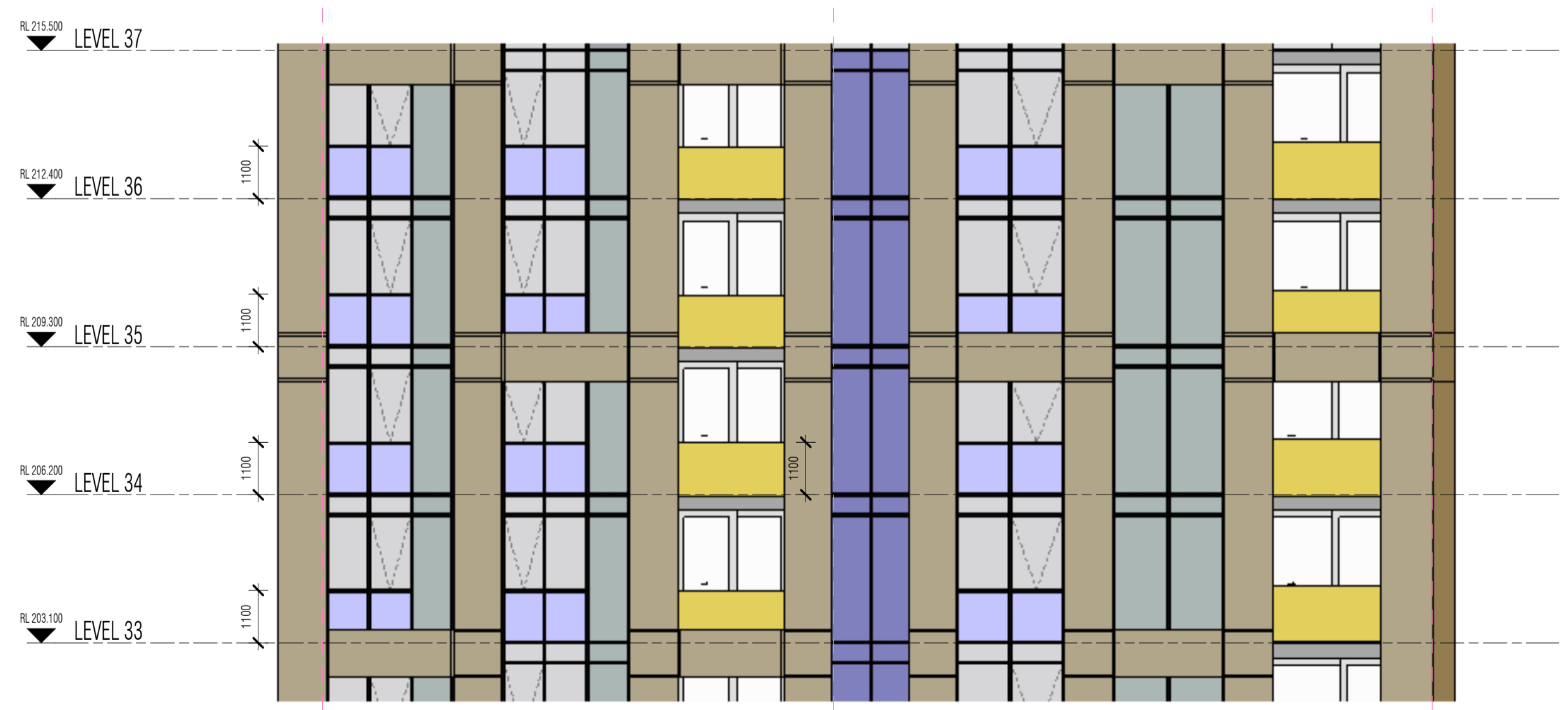
1 A1 LEVEL 35 - PRIVACY SCREENING