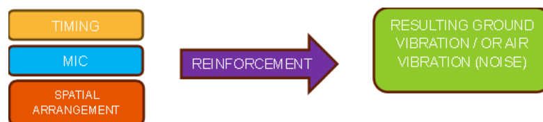
Figure 2 Blast input/output relations

Historically, the use of a Maximum Instantaneous Charge (MIC) limit of 1681kg has been implemented as a blast design control within the Blast Control Area. However, developments in technology and improved software modelling have enabled consideration of the interactions between MIC, individual hole timing/location and resulting reinforcement to produce a more realistic outcome of actual vibration and/or overpressure. A high-level visual of this relationship is shown in Figure 2 below.