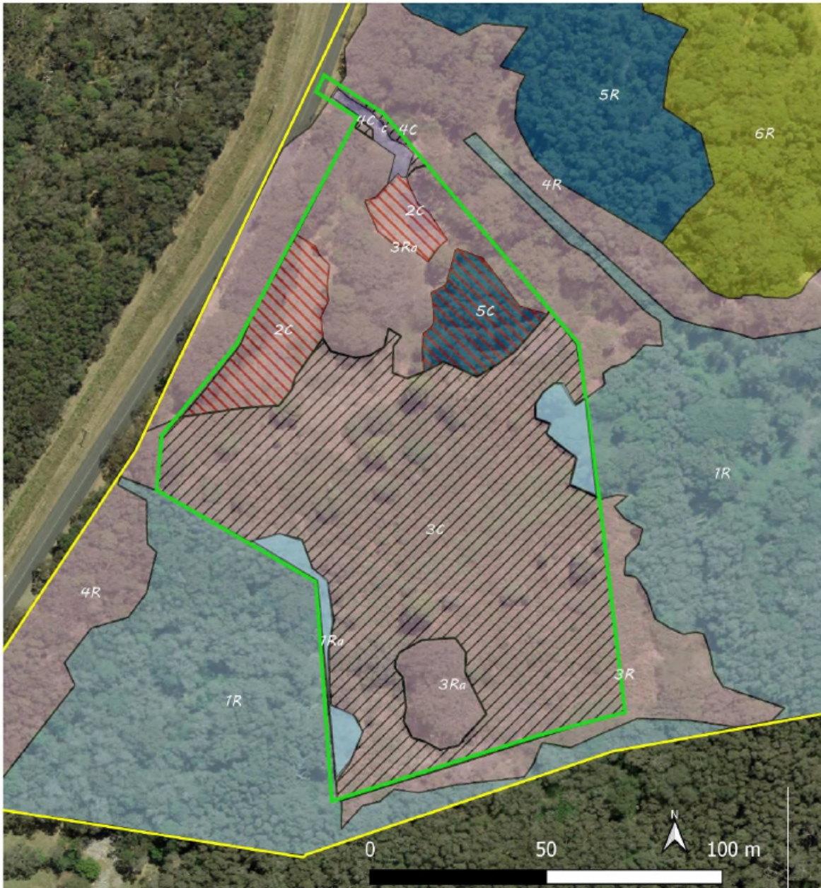
Figure 15 from the BDAR (PCTs and vegetation zones) shown as hatched)