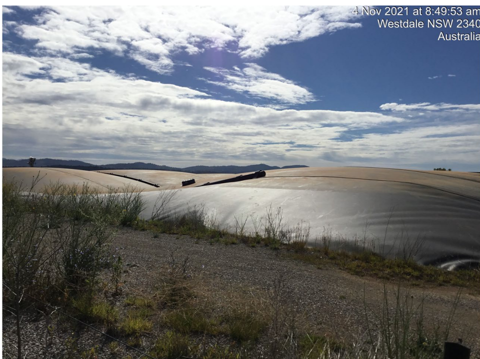
Photo 6: View looking east across some of the covered anaerobic lagoons (CAL)