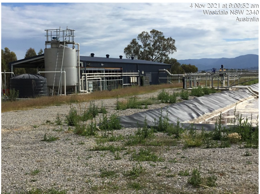
Photo 2: View looking northwest towards the wastewater treatment plant