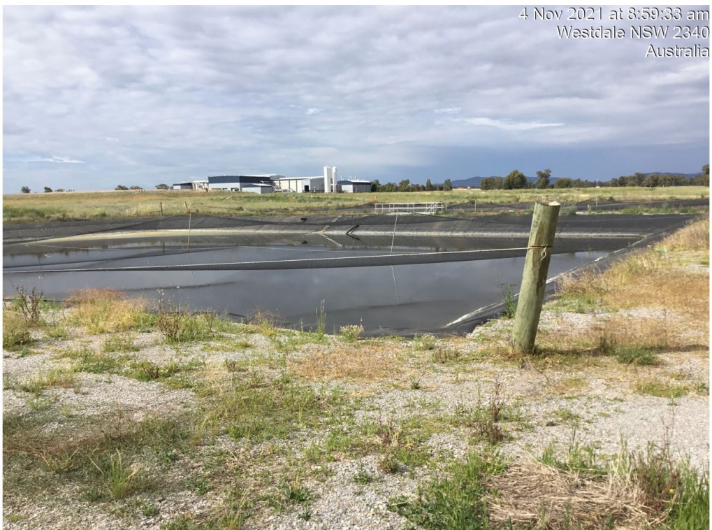
Photo 4: View across one of the wastewater ponds with bird netting