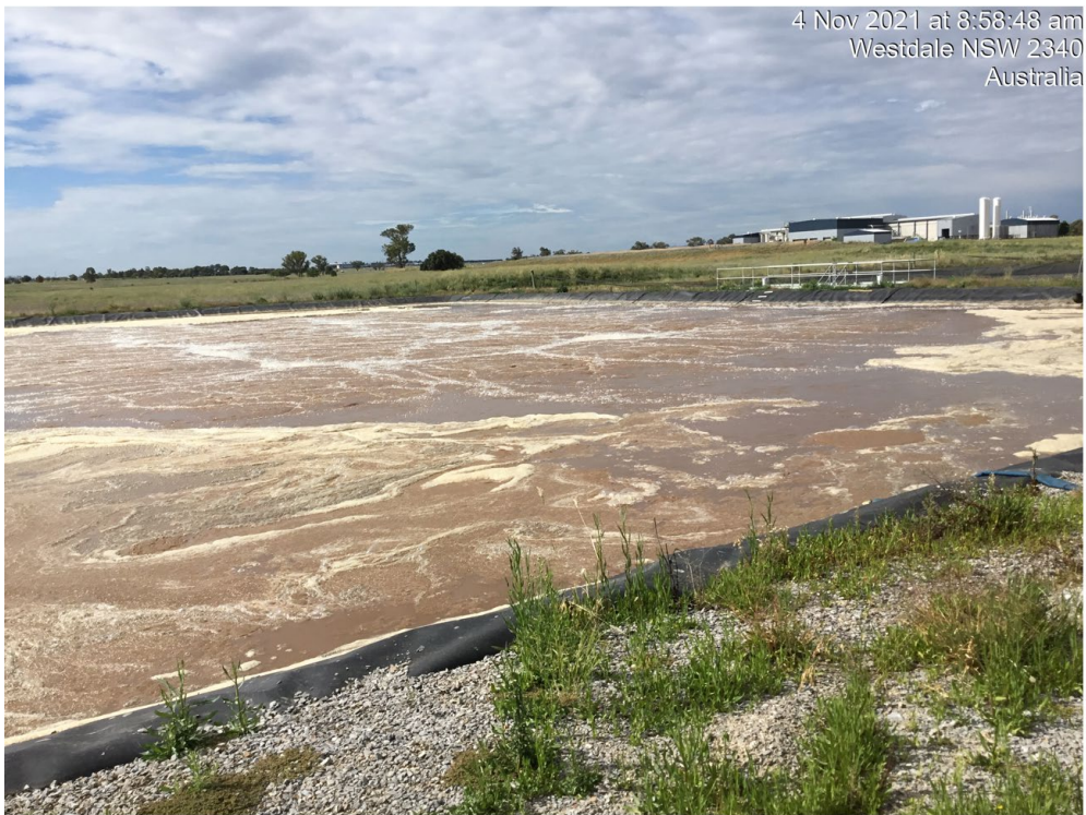
Photo 3: View looking southeast over wastewater pond towards the main plant