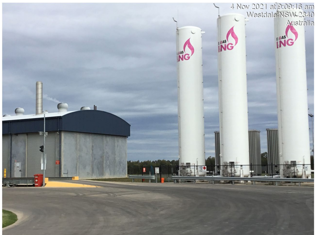
Photo 1: Northwest corner of the main plant showing the LNG storage tanks