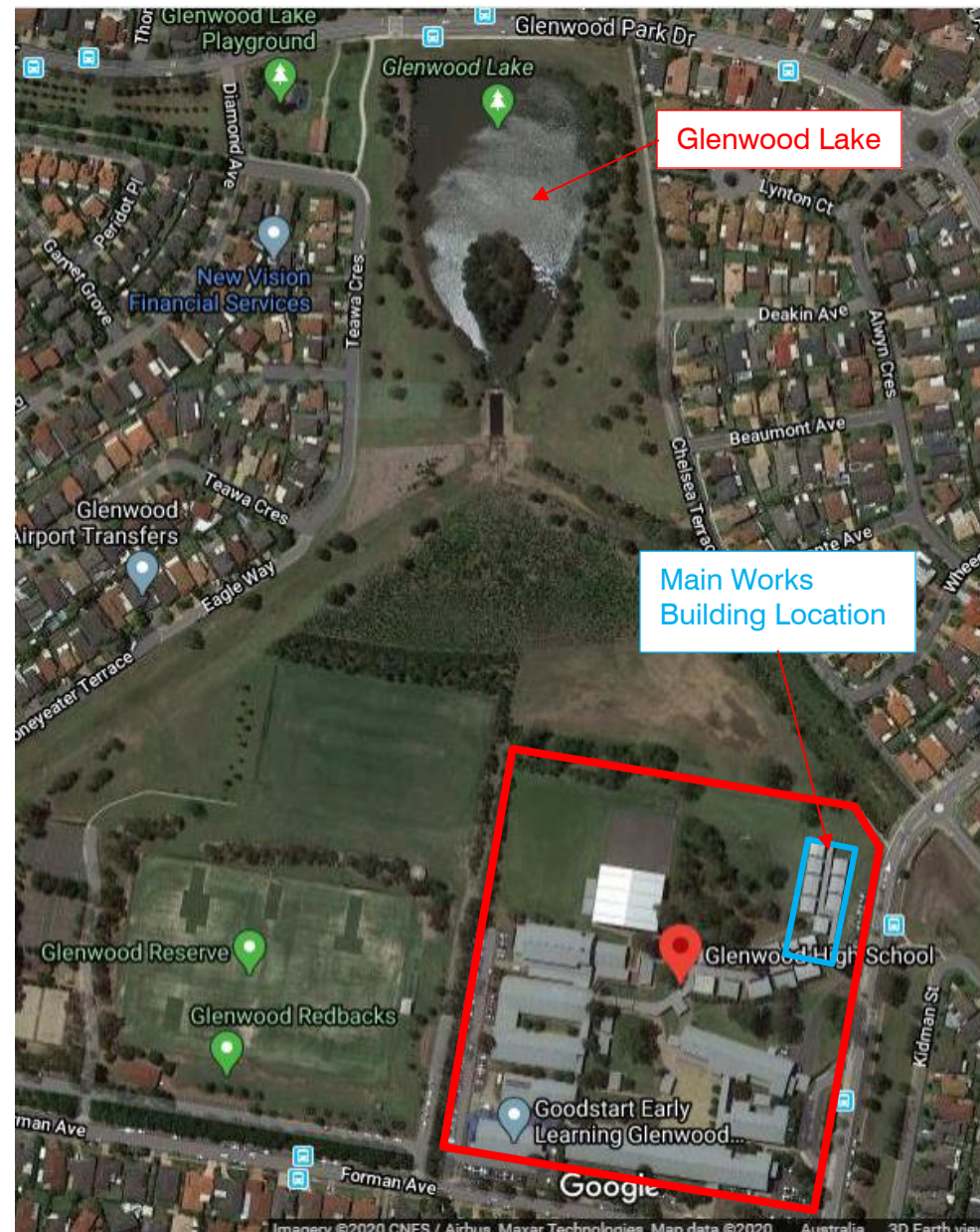
Figure 3: Glenwood Lake and School Site

A few hundred metres north of the school site is Glenwood Lake. Glenwood Lake acts as a detention basin that holds water and discharges flows to Caddies Creek. Caddies Creek is a tributary of Cattai Creek. The watercourse adjacent the school site is a tributary of Caddies Creek and is a Class 1 stream order as classified by the NSW Department of Planning, Industry and Environment publication: Determining stream order Fact sheet. Refer to Figure 3 for the location of Glenwood Lake with respect to the school campus.