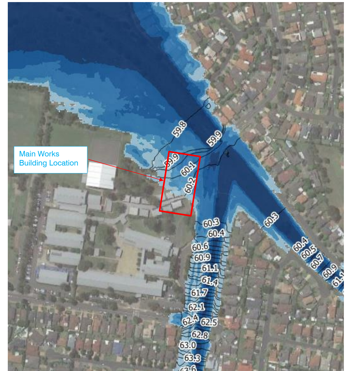
Figure 4: PMF Flood Extent

Flood modelling indicates that the school site is generally free from the 1% AEP overland flows which are contained within the roadways. The flood extents are generally contained within the roadways for all storms with some overflow occurring for the rare event of the 0.2% AEP event within the lower part of the site, where the proposed building is located, is inundated by the PMF event. The extent of the PMF overland water can be seen in Figure 4 .