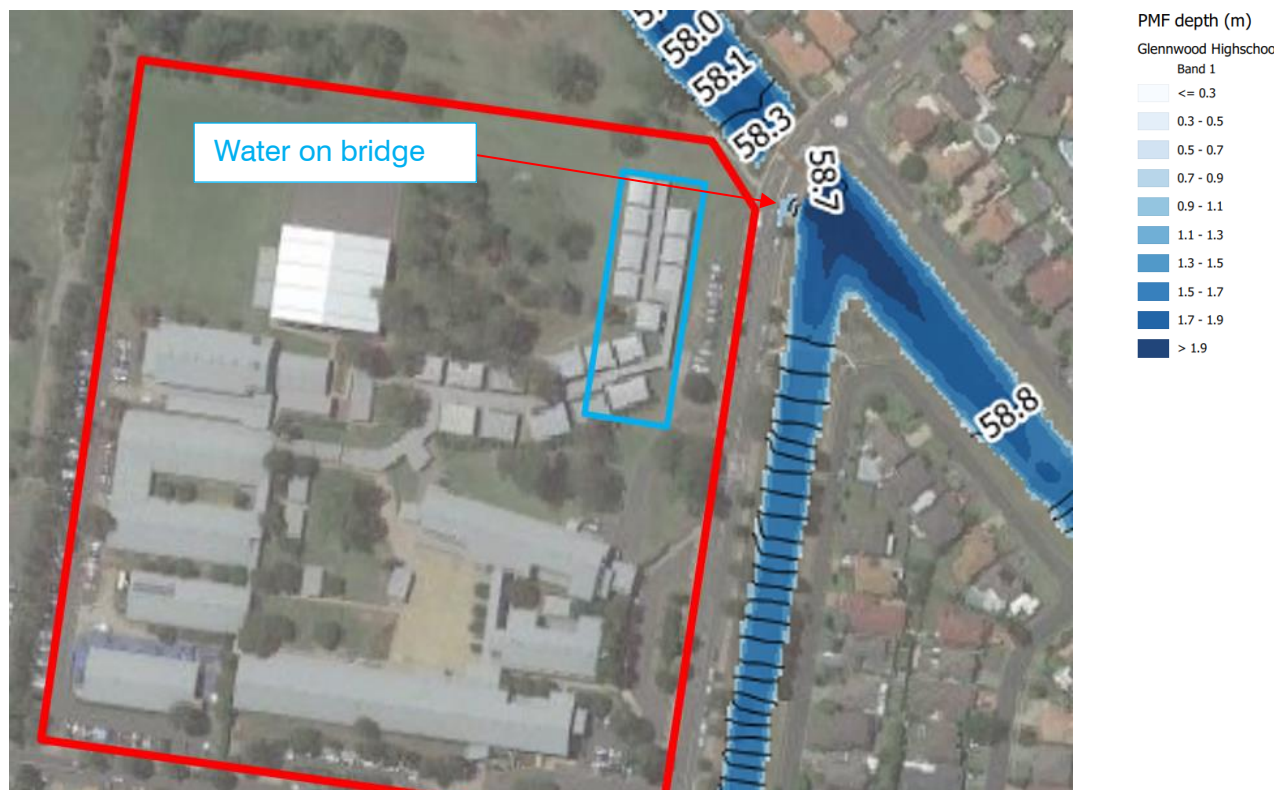
Figure 6: 1% AEP event water accumulating on the Glenwood Park Drive bridge