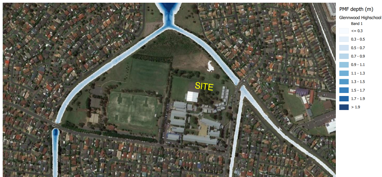
Figure 5: Overland flooding conditions for 20% AEP event

Results from the revised TUFLOW model indicate the following flood characteristics in various storm events. Overland flow flooding is contained within the extents of the drainage channel during the 20% AEP storm event as seen in Figure 5 . Overland flow water from the 1% AEP stormwater event starts to accumulate on the bridge over the drainage channel making it dangerous for vehicle and pedestrians to cross along Glenwood Park Drive. Figure 6 below shows the extent of the 1% AEP flood water and where overland flow and ponding are occurring on the Glenwood Park Drive bridge over the drainage channel