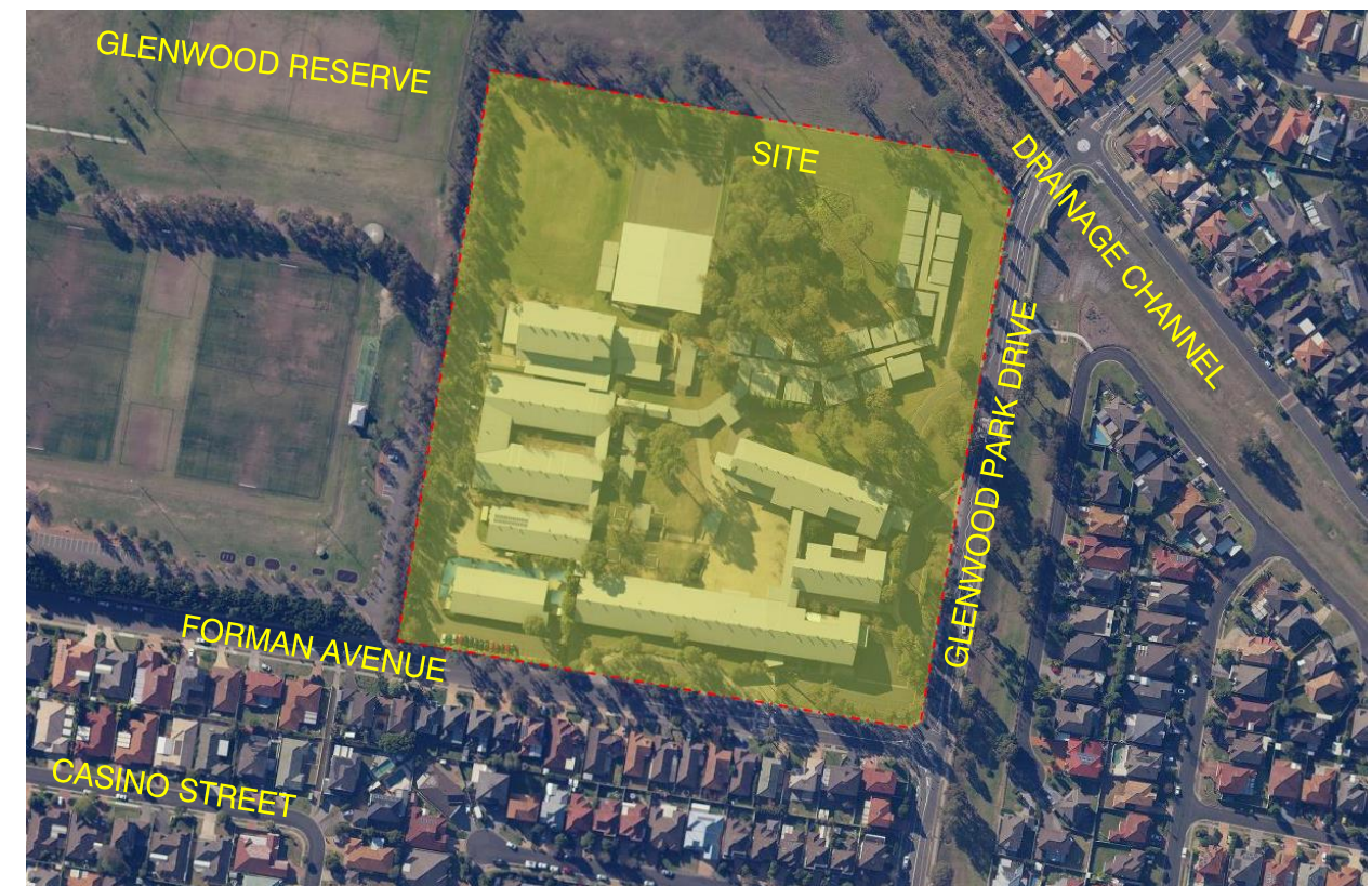
Figure 1: Entire Site

The built form and land use character surrounding the site is predominantly low scale, 1-2 storey dwelling houses. The site has a total area of 60,790m 2 . The site is legally described as Lot 5227 in Deposited Plan 868693.