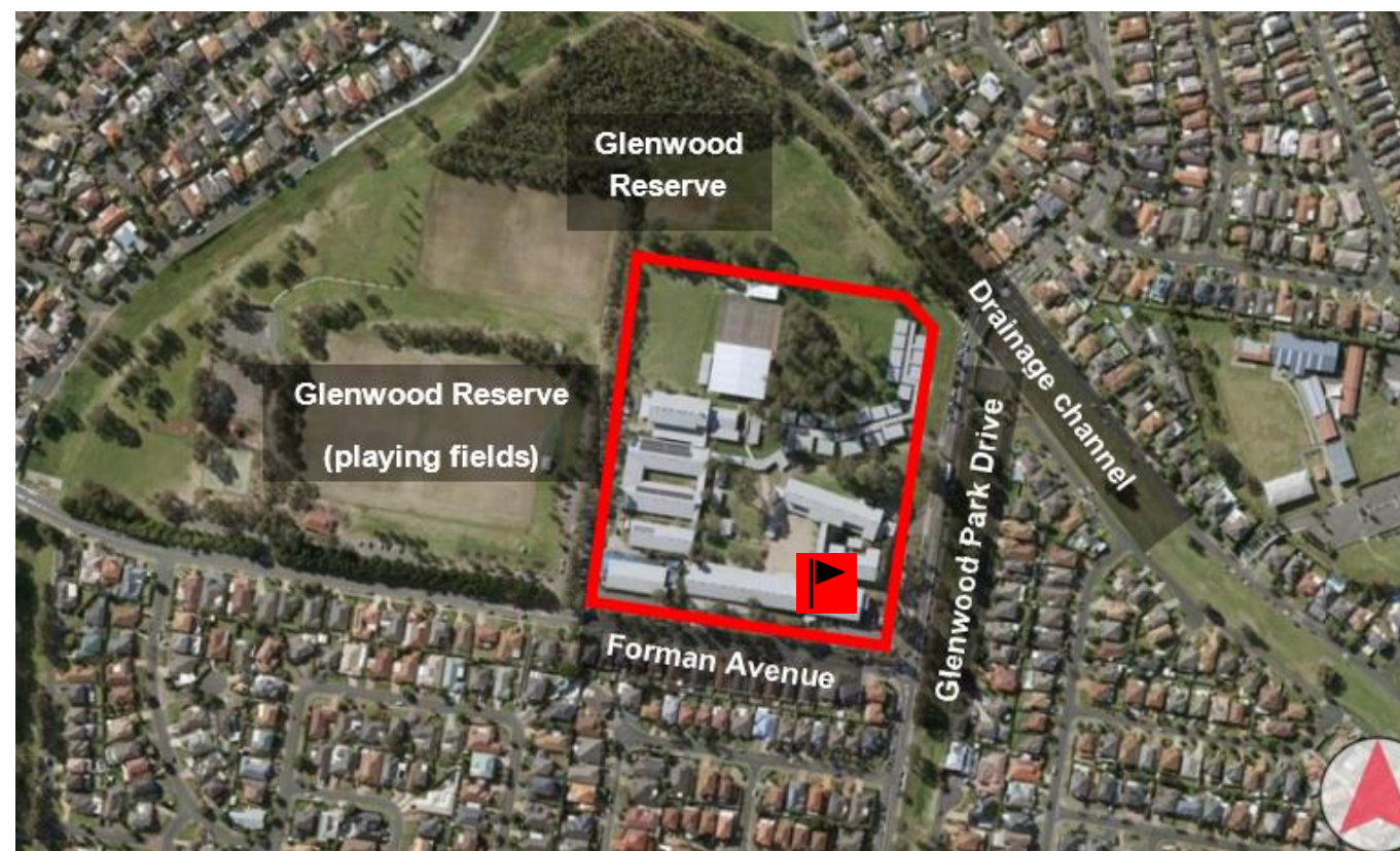
Figure 7: Evacuation Route and Site Entry/Exit