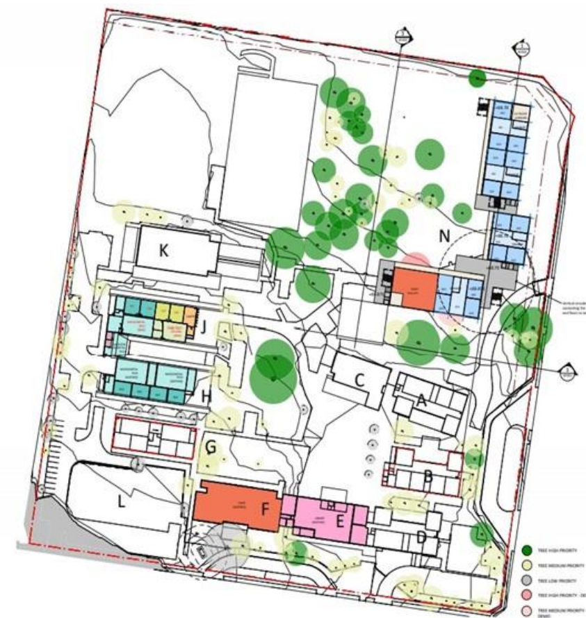
Figure 2: Design Plan L3