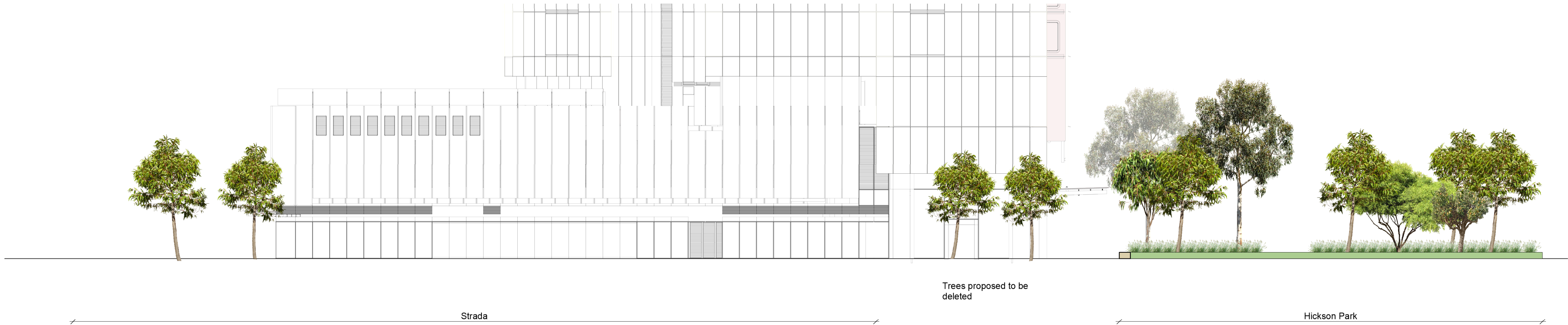
ELEVATION SHOWING PROPOSED TREES TO BE DELETED