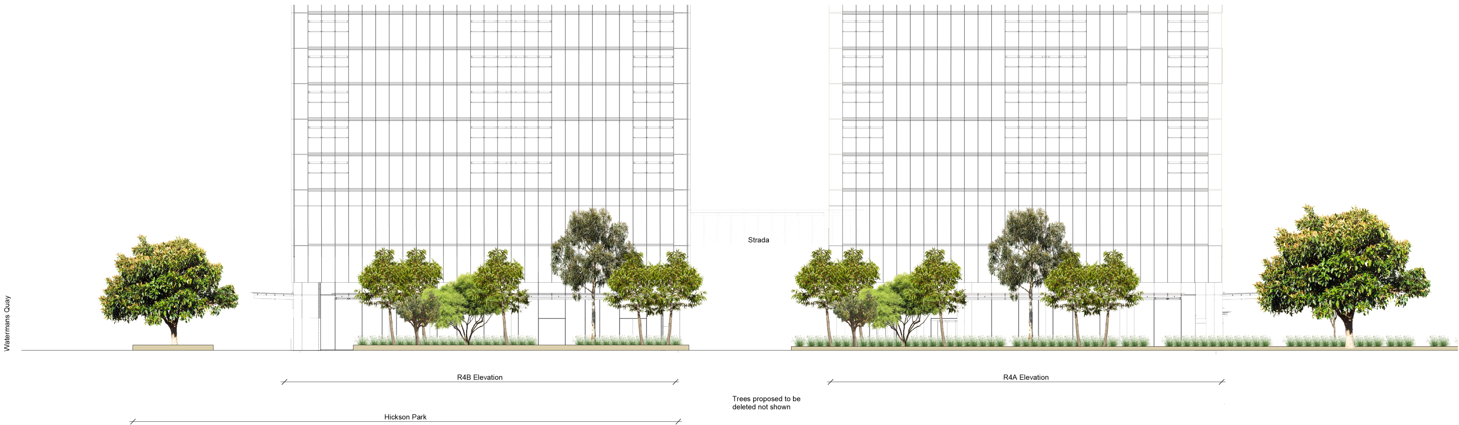
ELEVATION SHOWING REMOVAL OF TREES