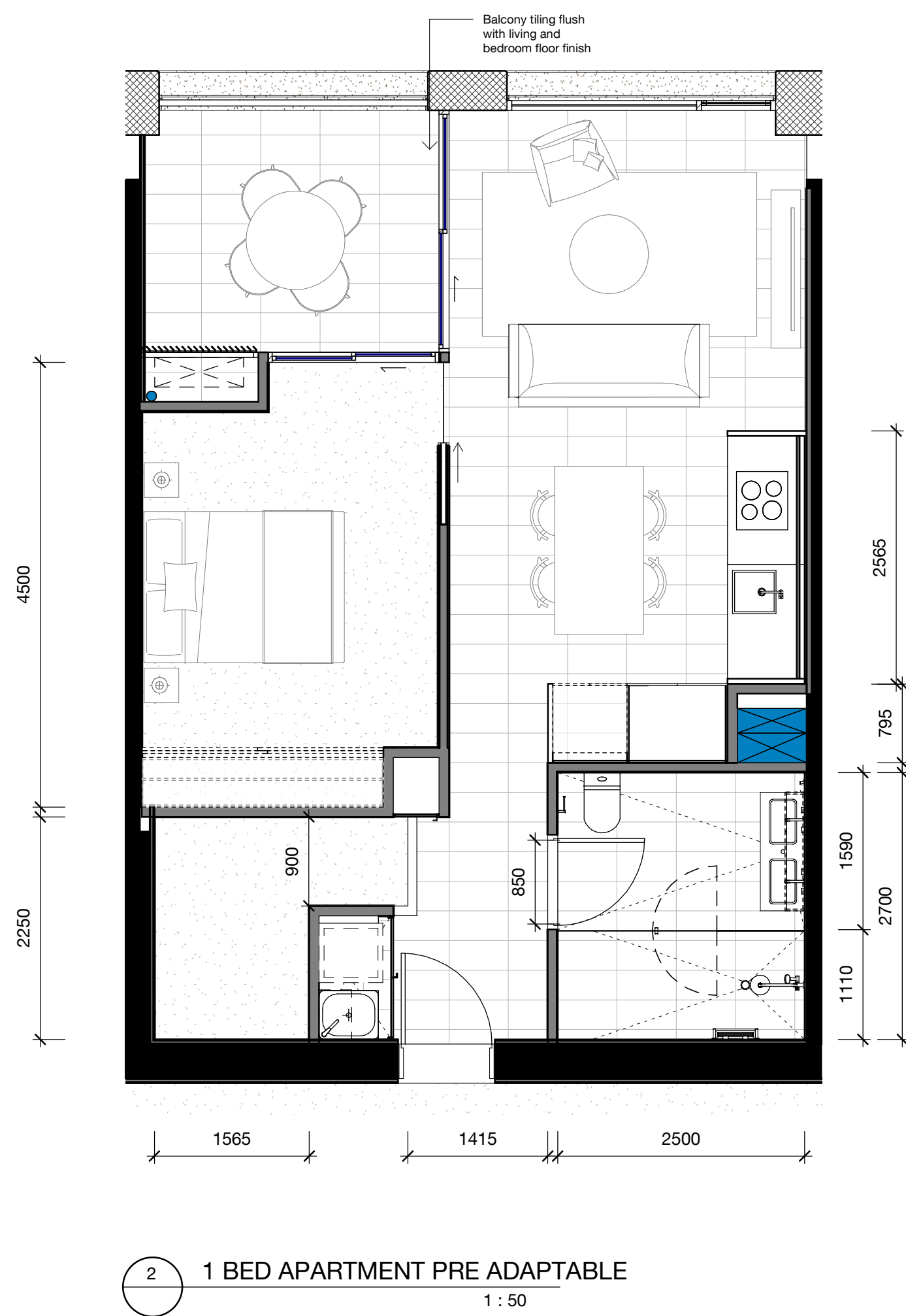
2 1 BED APARTMENT PRE ADAPTABLE 1 : 50