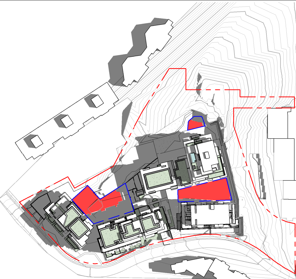
SHADOW DIAGRAM - 11AM 21 JUNE - 68 % SOLAR ACCESS