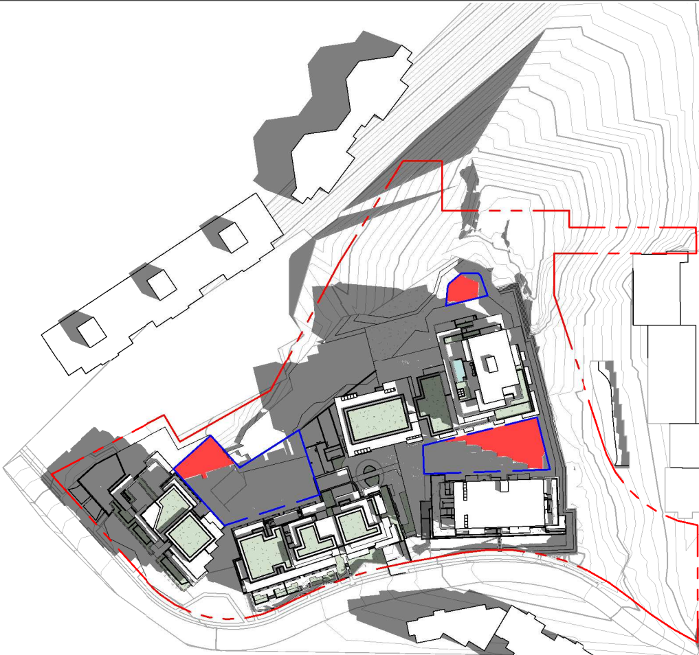
SHADOW DIAGRAM - 10AM 21 JUNE - 32 % SOLAR ACCESS