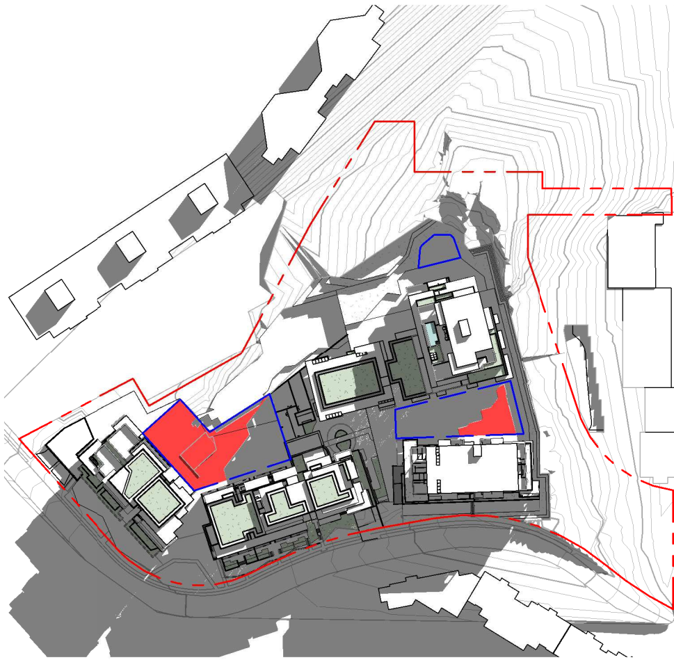
SHADOW DIAGRAM - 3PM 21 JUNE - 45 % SOLAR ACCESS