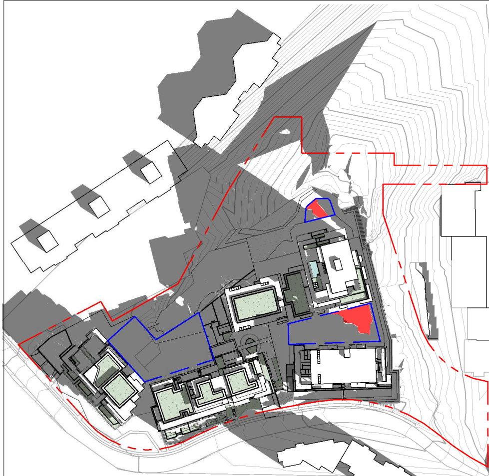
SHADOW DIAGRAM - 9AM 21 JUNE - 11 % SOLAR ACCESS