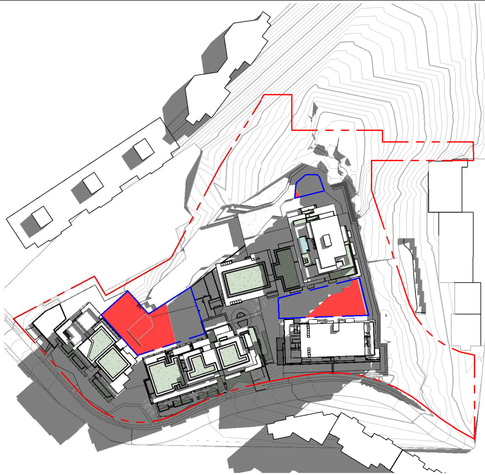
SHADOW DIAGRAM - 2PM 21 JUNE - 55 % SOLAR ACCESS