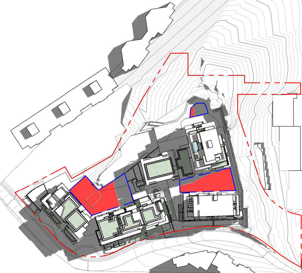
SHADOW DIAGRAM - 1PM 21 JUNE - 74 % SOLAR ACCESS