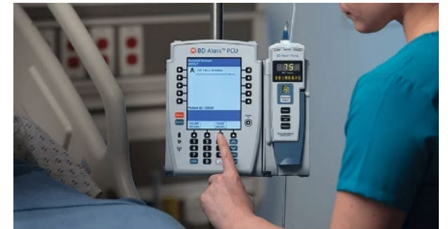
Pic 3 – Pumps

Pic 3 – Pump looks like this or in similar variations to this model.