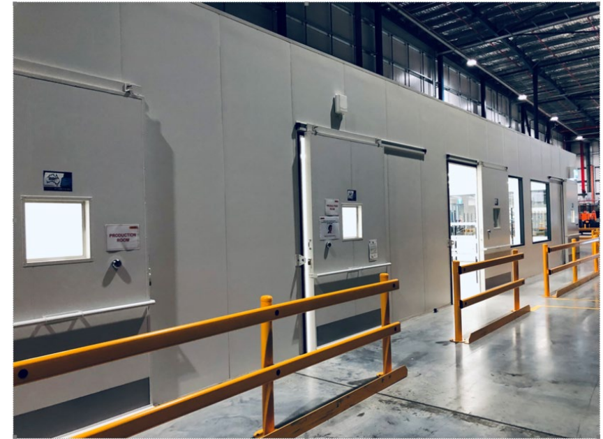
Pic 3 - Outside view of Rework rooms