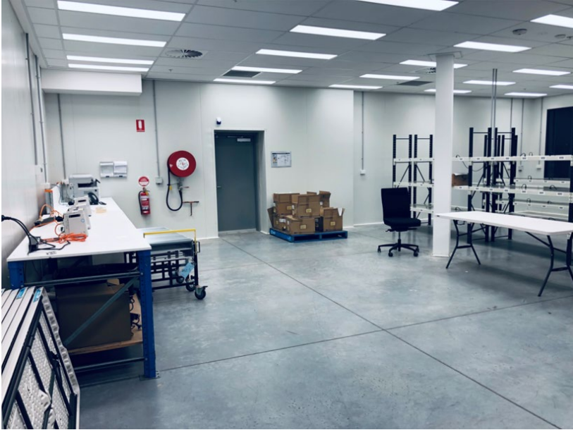
Pic 1 – Service area