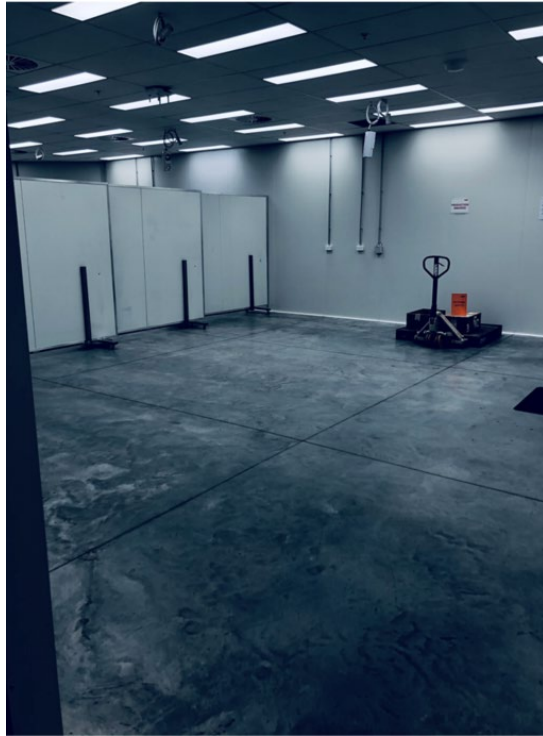
Pic 1 - Inside Rework room (left)