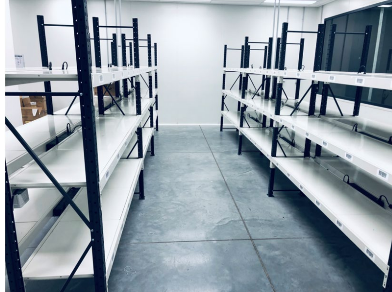
Pic 2 – Charging stations