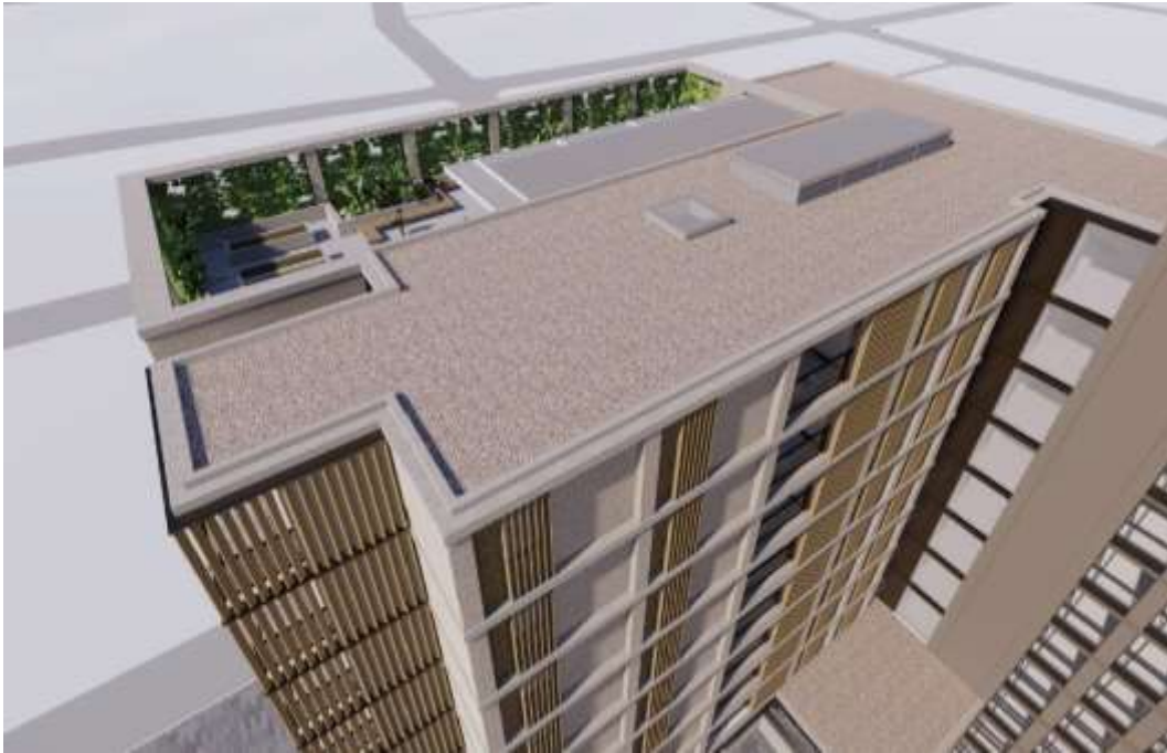
Figure 1 Aerial view of proposed roof (Building 4)