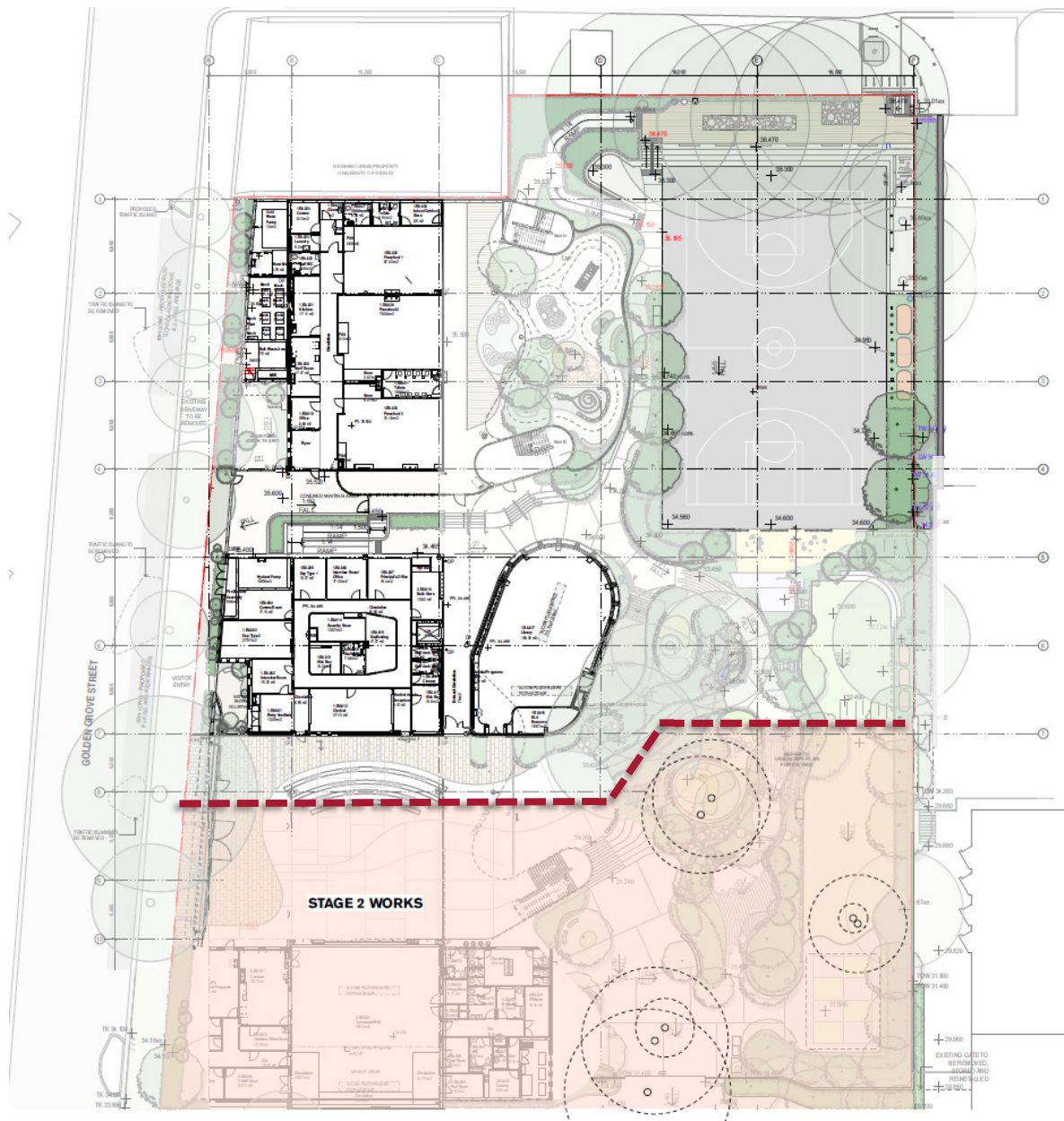
Stage 2 layout following handover of the central landscape area