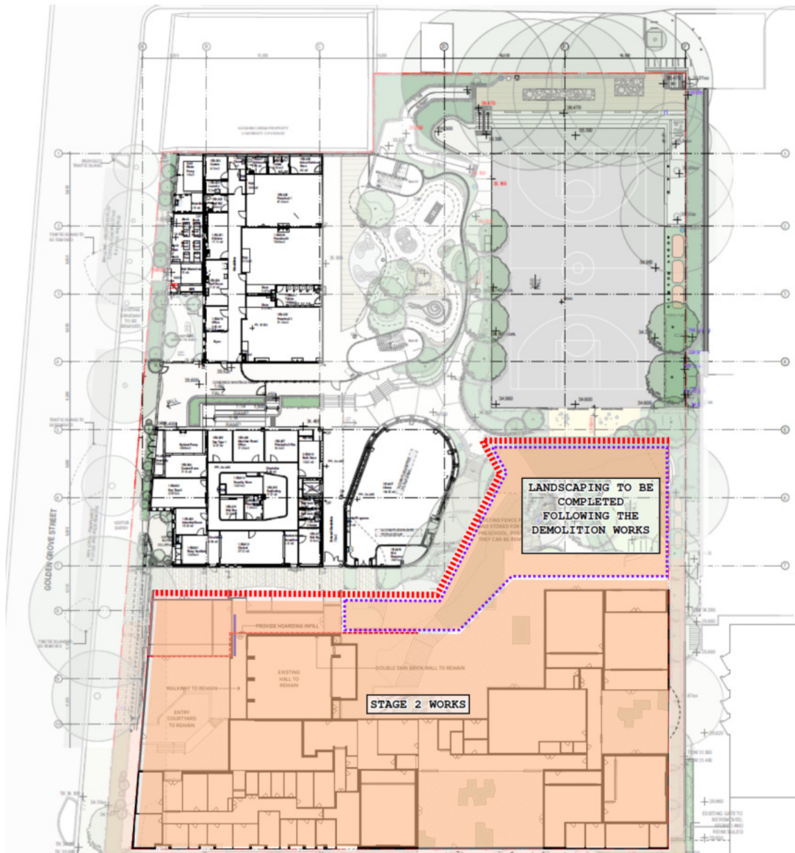
Site layout at commencement of Stage 2

During Stage 2, the school will move to the North half of the site that was completed during Stage 1. The capacity at this time will remain unchanged at approximately 190 students. The main entrance will change to the office entrance on Golden Grove Street. A Kiss & Ride area (installed during Stage 1) will service drop-offs along Golden Grove Street.