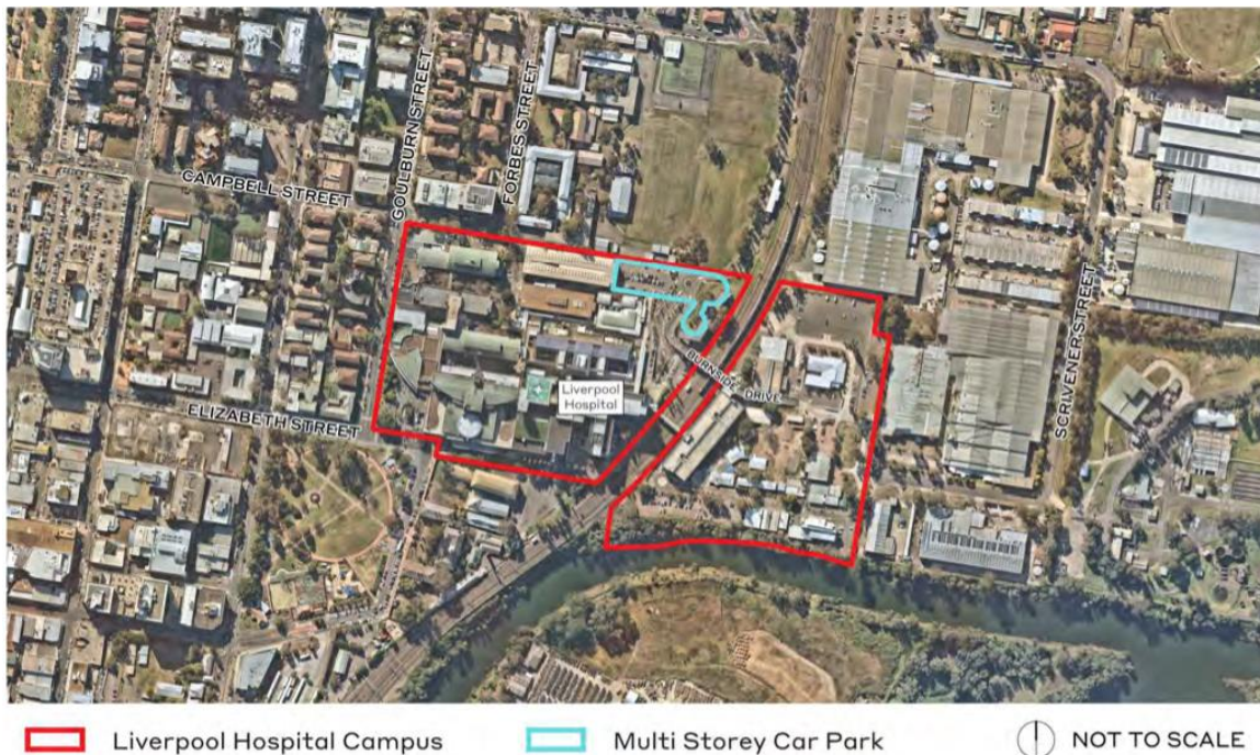
Figure 1 Project Footprint (EIS, Ethos Urban)