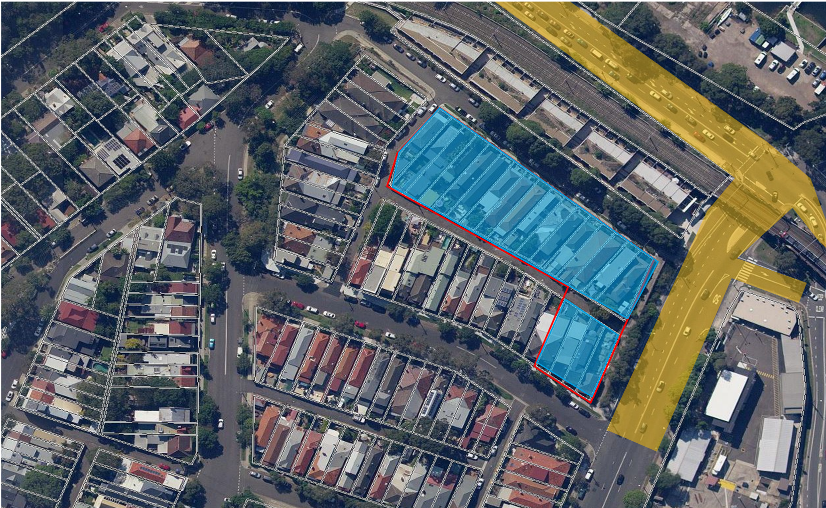
Figure 5 Map 4 of properties within the mitigation zone (red boundary) identified in Appendix D of the COA. The green boundary identifies properties scheduled for demolition. The blue shaded areas are properties identified as high priority. The orange shaded areas show the locations(indicative) of outgo hours works scheduled to occur within the first 6 months of construction commencing.