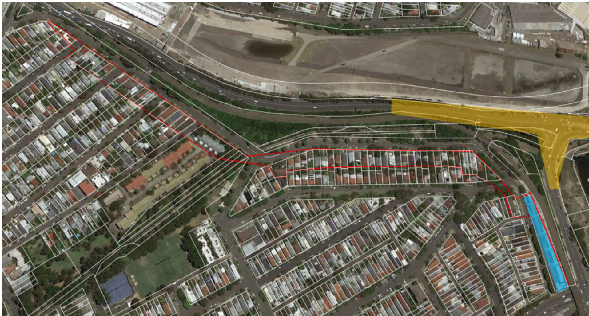
Figure 3 Map 2 of properties within the mitigation zone (red boundary) identified in Appendix D of the CoA.

The blue shaded areas are properties identified as high priority. The orange shaded areas show the locations (indicative) of out of hours works scheduled to occur within the first 6 months of construction commencing.