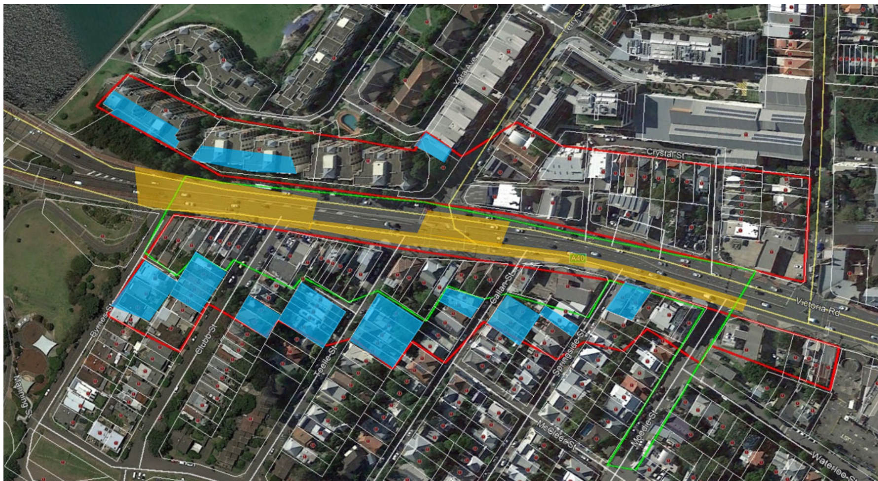
Figure 2 Map 1 of properties within the mitigation zone (red boundary) identified in Appendix D of the CoA.

The green boundary identifies properties scheduled for demolition. The blue shaded areas are properties identified as high priority. The orange shaded areas show the locations (indicative) of out of hours works scheduled to occur within the first 6 months of construction commencing.