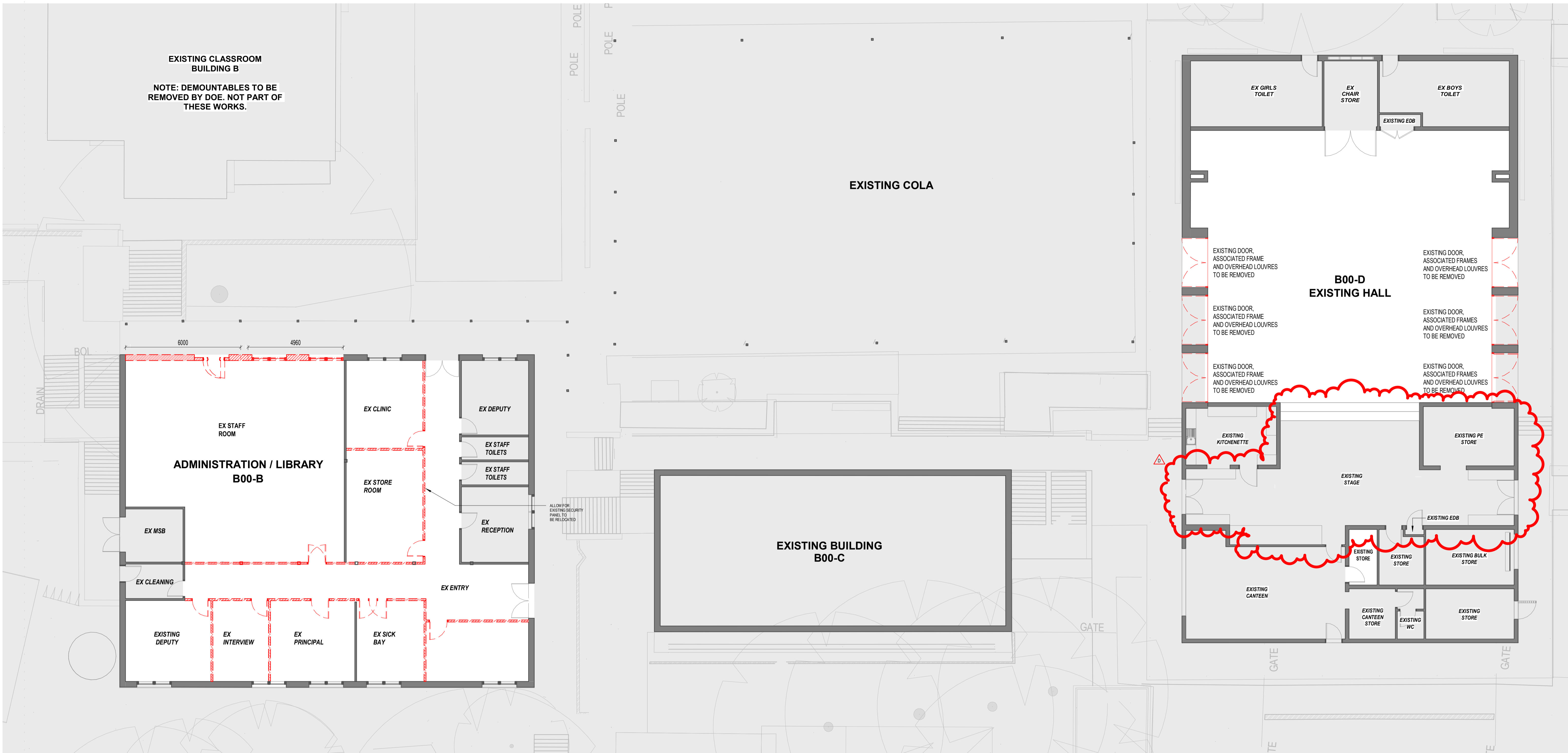
1 Ground Floor - Demolition Plan - South Site B00B and B00D 0201 1:100