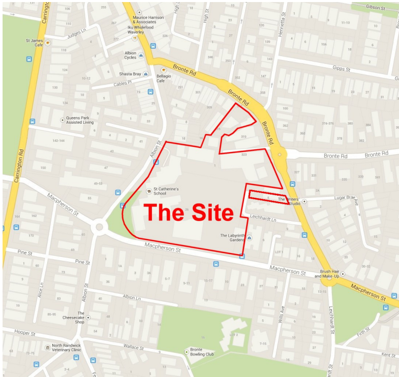
Figure 1 – Site location