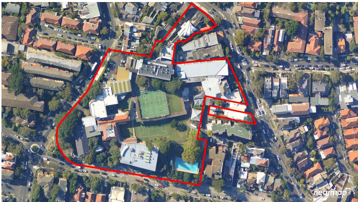
Figure 2 – Aerial photograph